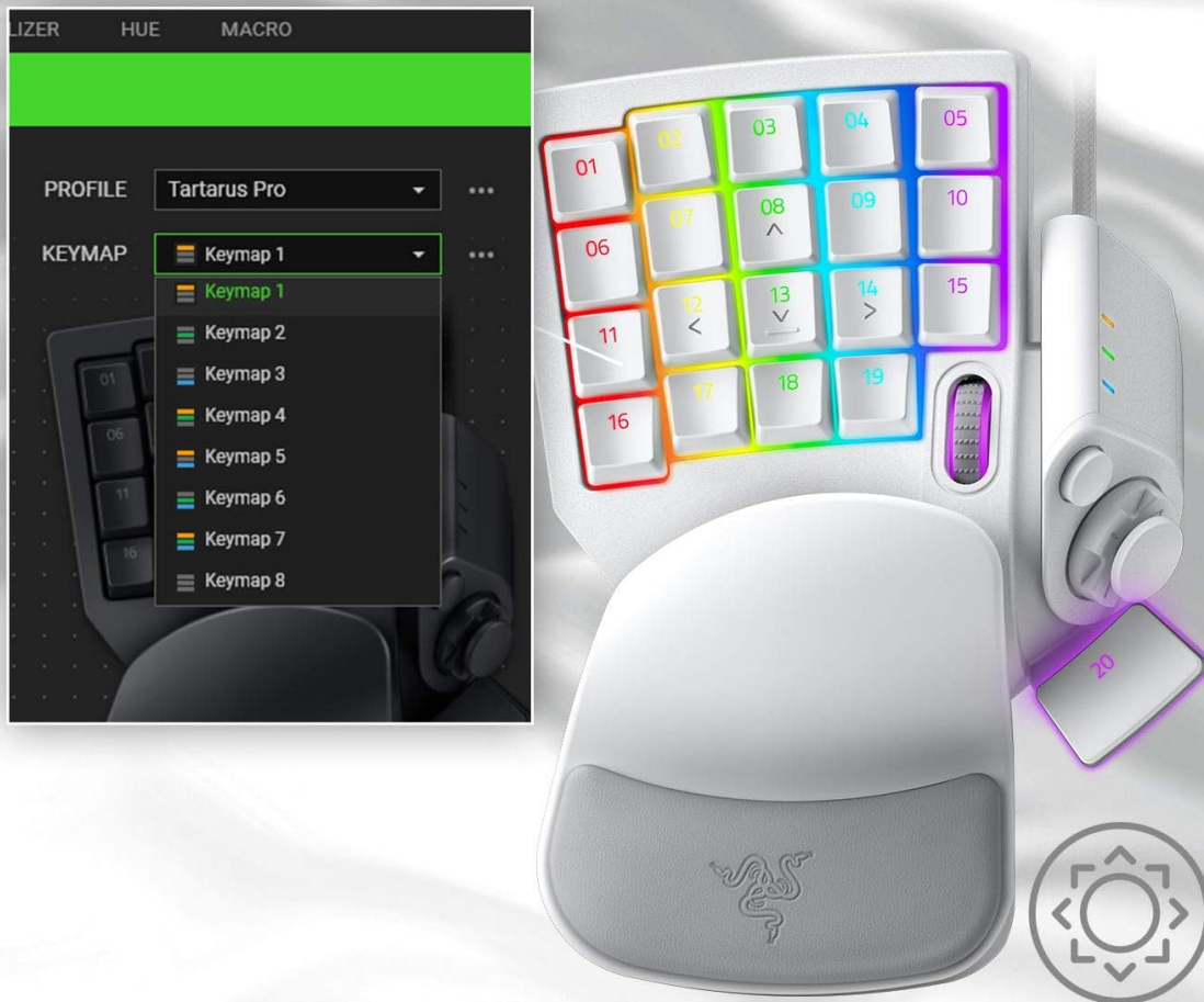
Figure 4: Quick-toggle profiles for instant switching.