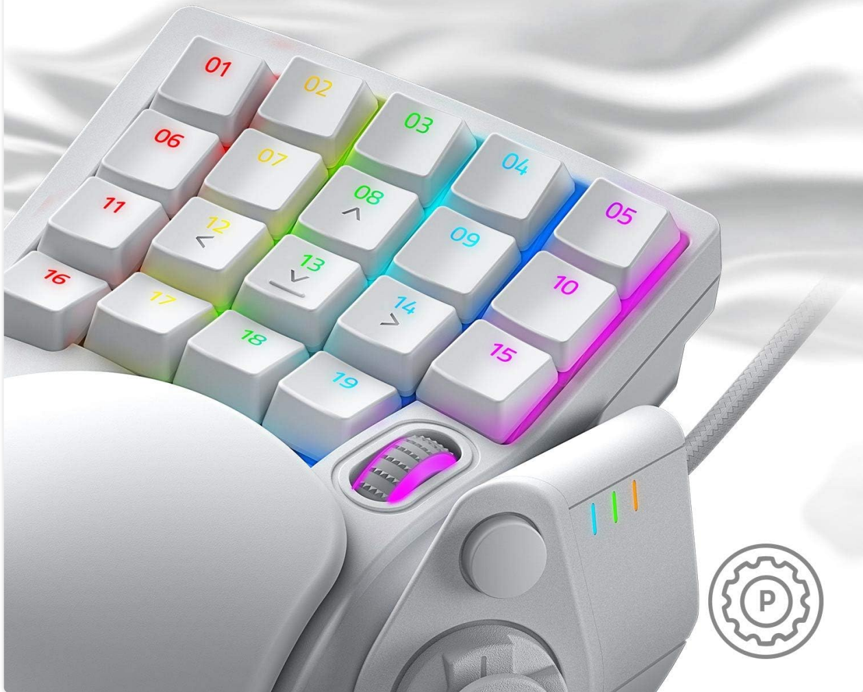
Figure 2: Overview of 32 programmable keys.