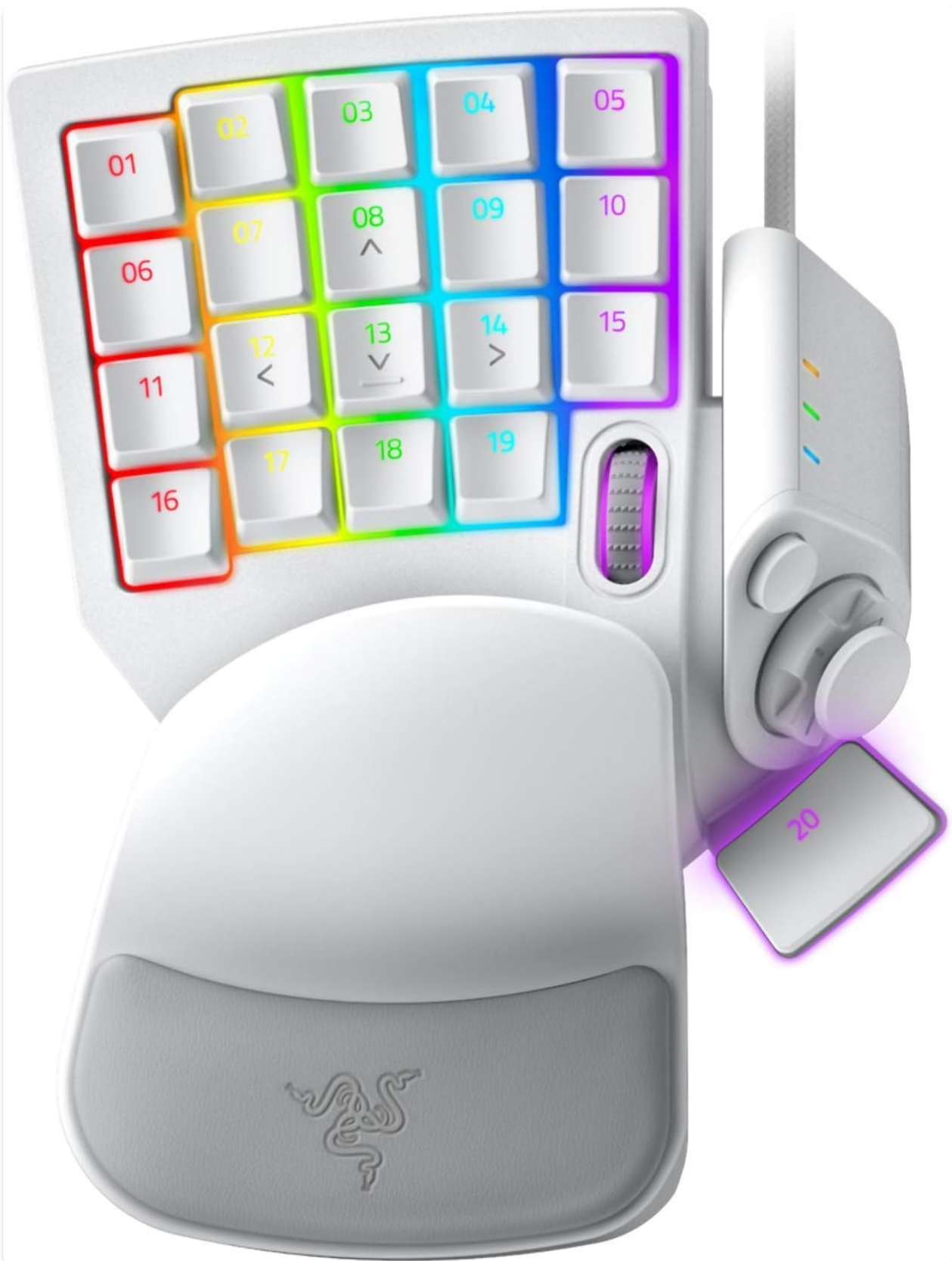
Figure 1: Razer Tartarus Pro Gaming Keypad (Mercury White)