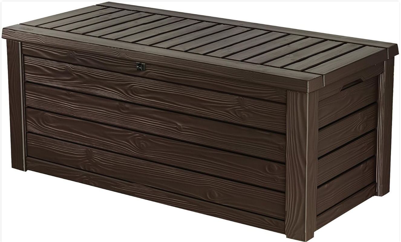
Image 1: The Keter Westwood 570L Outdoor Storage Box, showcasing its brown wood panel effect and sturdy design, suitable for various outdoor settings.

Constructed from durable, weather-resistant resin with a natural wood-paneled effect, the Westwood Deck Box is built to withstand various weather conditions without fading or requiring extensive maintenance. The innovative piston-assisted lid ensures smooth and easy opening and closing, while the integrated latch provides an option for adding a padlock (not included) for enhanced security of your stored items.