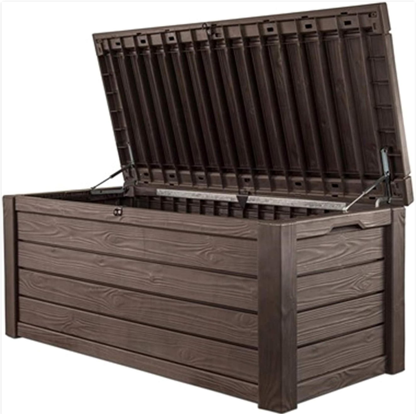
Image 2: The Keter Westwood Storage Box with its lid fully open, revealing the ample storage space and the hydraulic pistons that assist in smooth operation.