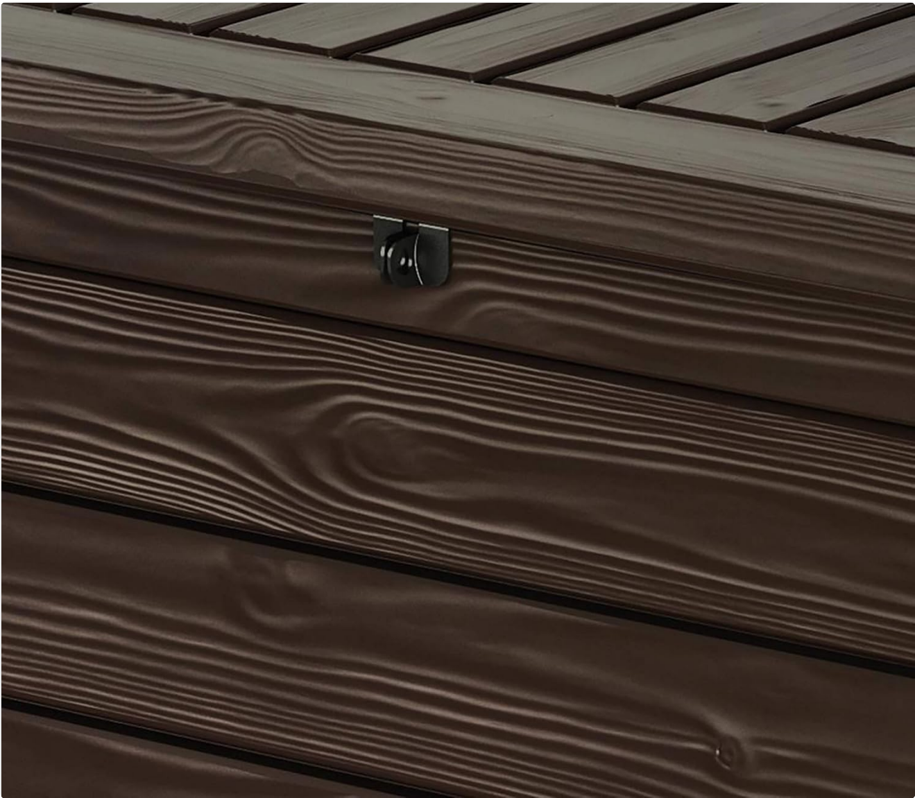
Image 6: A close-up shot highlighting the realistic wood-grain texture of the resin material, which contributes to the box’s aesthetic appeal and durability.