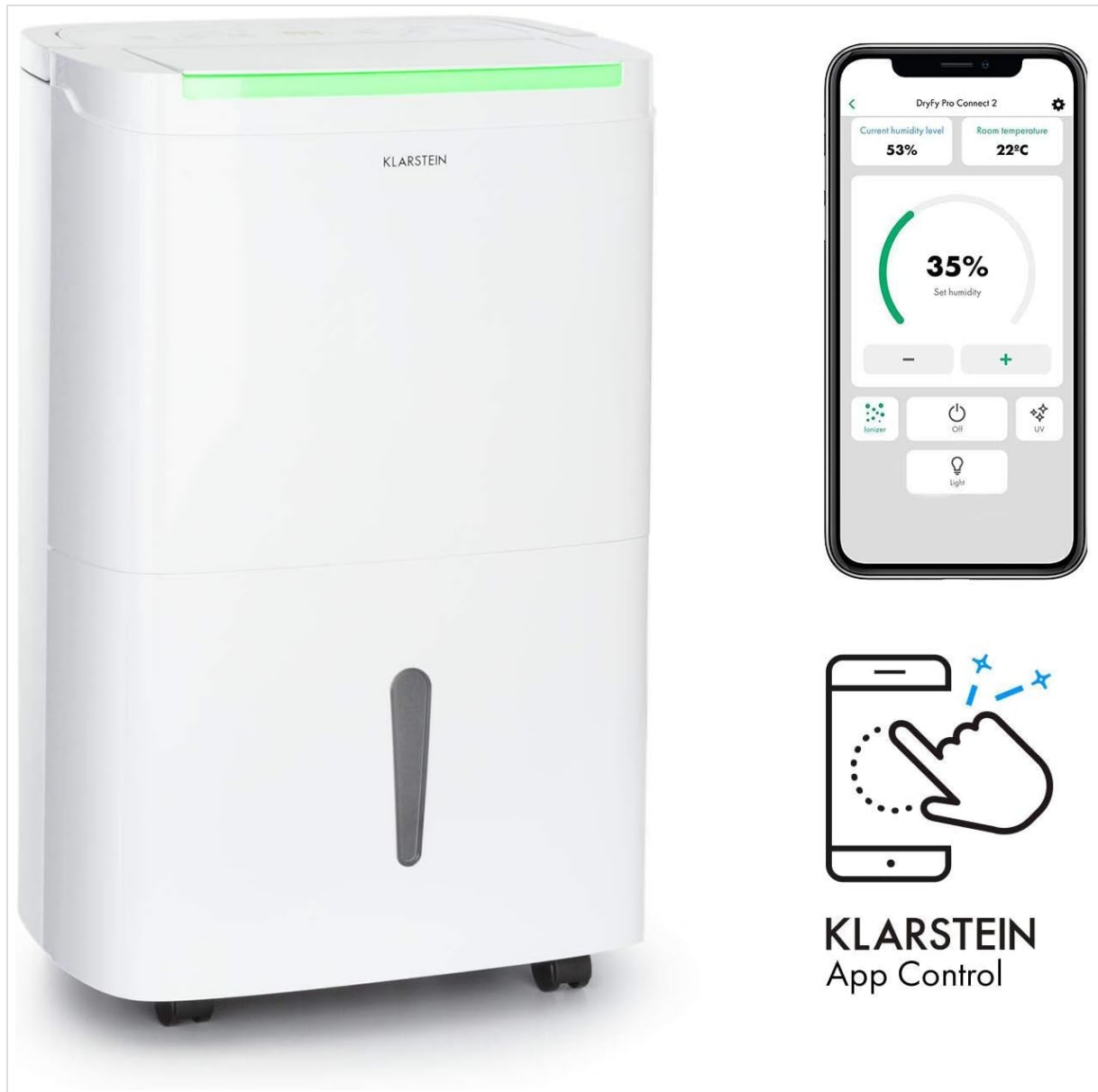
Image: Front view of the KLARSTEIN DryFy Connect 80 Dehumidifier alongside a smartphone displaying the Klarstein app control interface. The dehumidifier is white with a green light indicator on top and a visible water level indicator on the front.

The KLARSTEIN DryFy Connect 80 Dehumidifier is a powerful and efficient appliance designed for optimal humidity control. Below is an image illustrating the main unit and its key features, including the integrated control panel and the Klarstein app control interface.