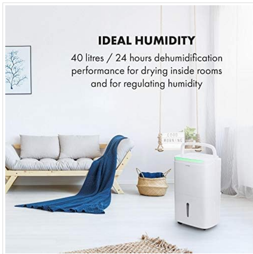
Image: The KLARSTEIN DryFy Connect 80 Dehumidifier placed in a modern living room, demonstrating appropriate placement away from furniture for optimal air circulation. Text overlay indicates "IDEAL HUMIDITY" and "40 litres / 24 hours dehumidification performance".