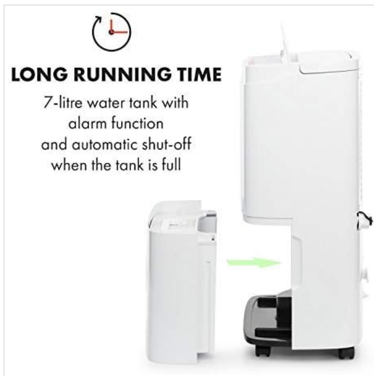
Image: A side view of the KLARSTEIN DryFy Connect 80 Dehumidifier with its 7-liter water tank being removed from the main unit. An arrow indicates the direction of removal. Text overlay highlights "LONG RUNNING TIME" and "7-liter water tank with alarm function and automatic shut-off when the tank is full".

routed downwards to a suitable drain (e.g., floor drain, sink) to allow gravity to drain the water.