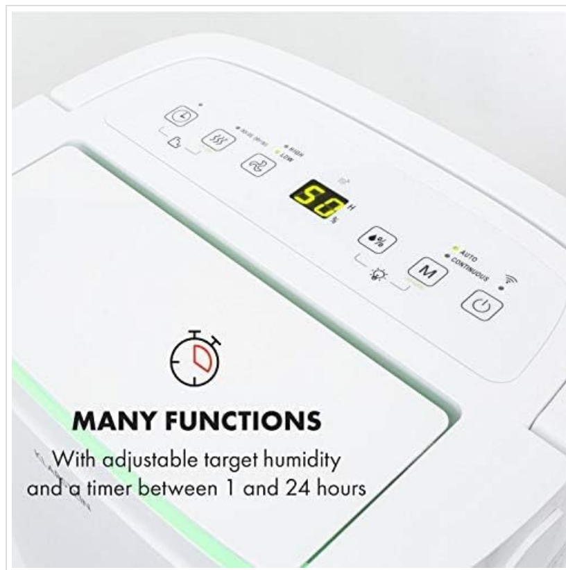
Image: A detailed close-up of the KLARSTEIN DryFly Connect 80 Dehumidifier's control panel. It features a digital display showing "50%" and various touch-sensitive buttons for functions like power, mode, humidity setting, timer, and Wi-Fi. Text overlay indicates "MANY FUNCTIONS" and "With adjustable target humidity and a timer between 1 and 24 hours".