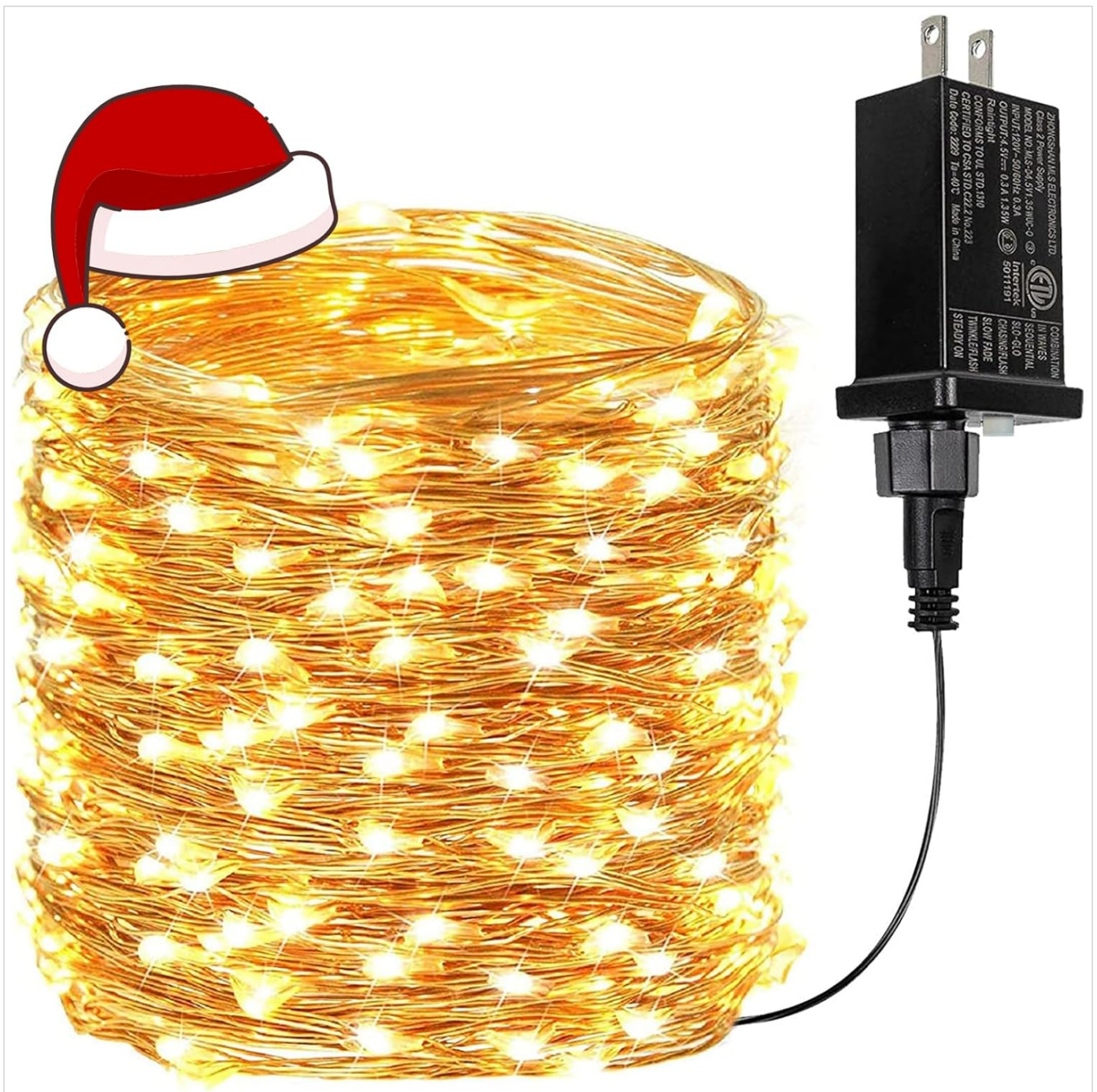
Image: The BHCLIGHT 66Ft 200 LED Warm White Fairy Lights, coiled and ready for setup, showing the attached power adapter.