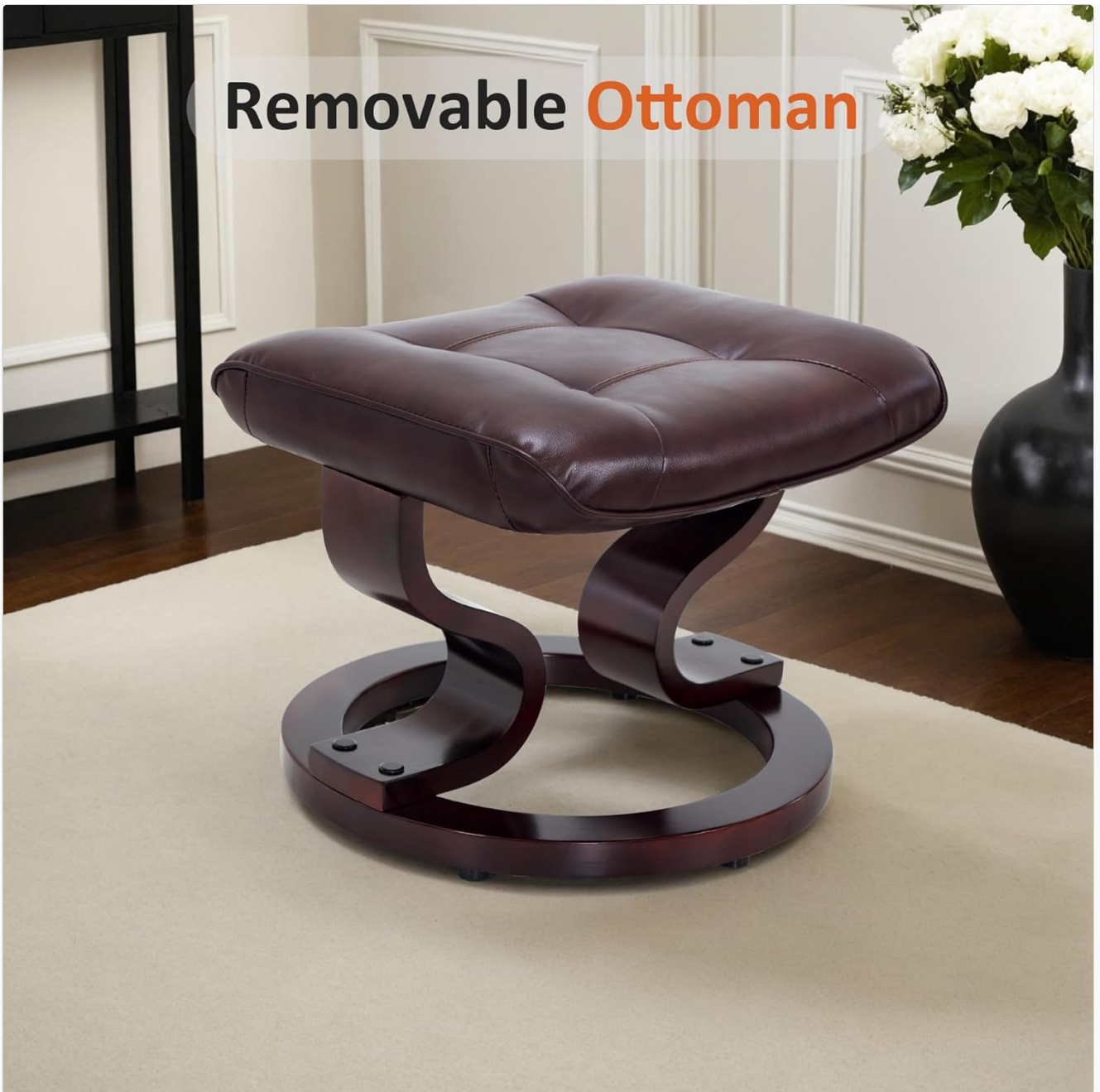
Image: The separate ottoman, designed to complement the recliner for leg support.