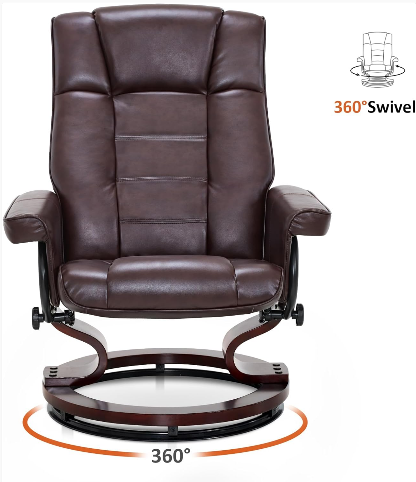
Image: The recliner demonstrating its 360-degree swivel capability on its wooden base.

The chair features a 360-degree swivel mechanism set in a sturdy wooden base. This allows for smooth flexibility while maintaining stability, preventing unintentional spinning.