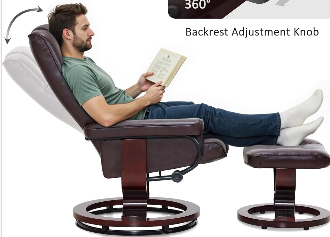
Image: A person demonstrating the recline function of the chair, adjustable between 105 and 140 degrees.