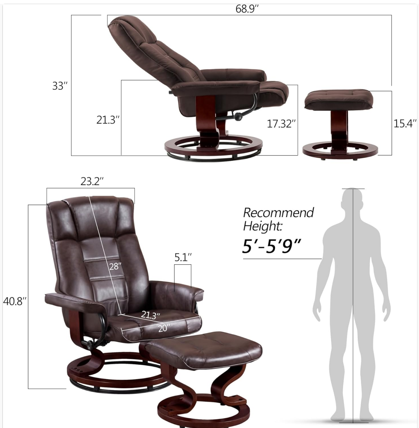
Image: Detailed dimensions of the MCombo recliner and ottoman for space planning.