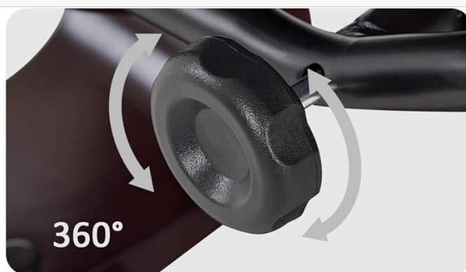
Backrest Adjustment Knob