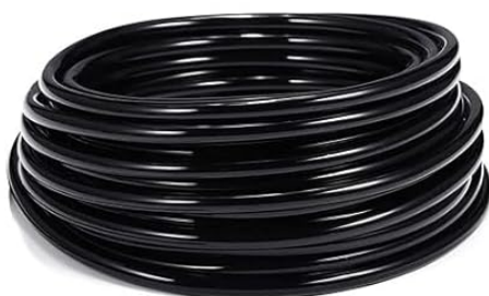
Black tubing X 30m(98FT)