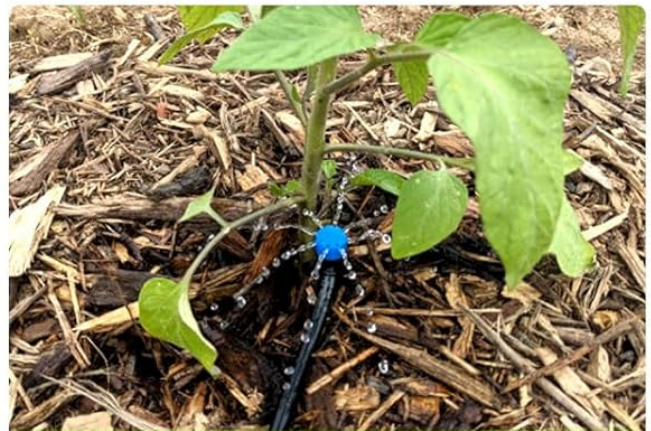
THE VEGGIE GARDEN