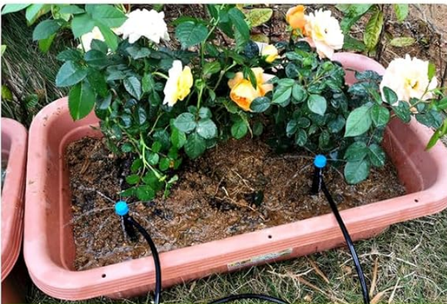
THE RAISED BED