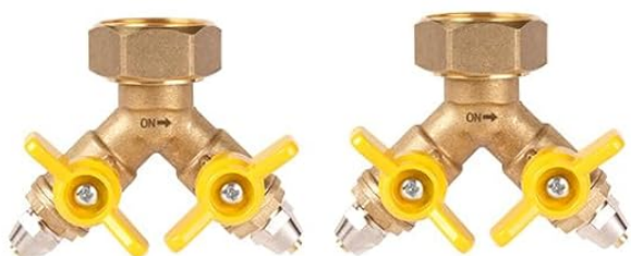
Two-way Connector X 2pcs

This kit includes all accessories to make a drip irrigation system.