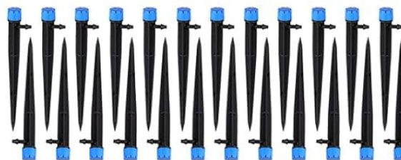
The blue emitter X 24pcs

Various applications of the drip irrigation system.