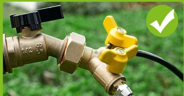
Detail of the no-leaking brass splitter.