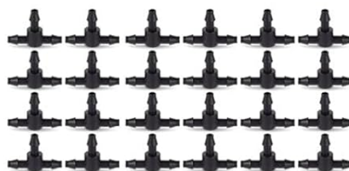
Tee-connector X 24pcs