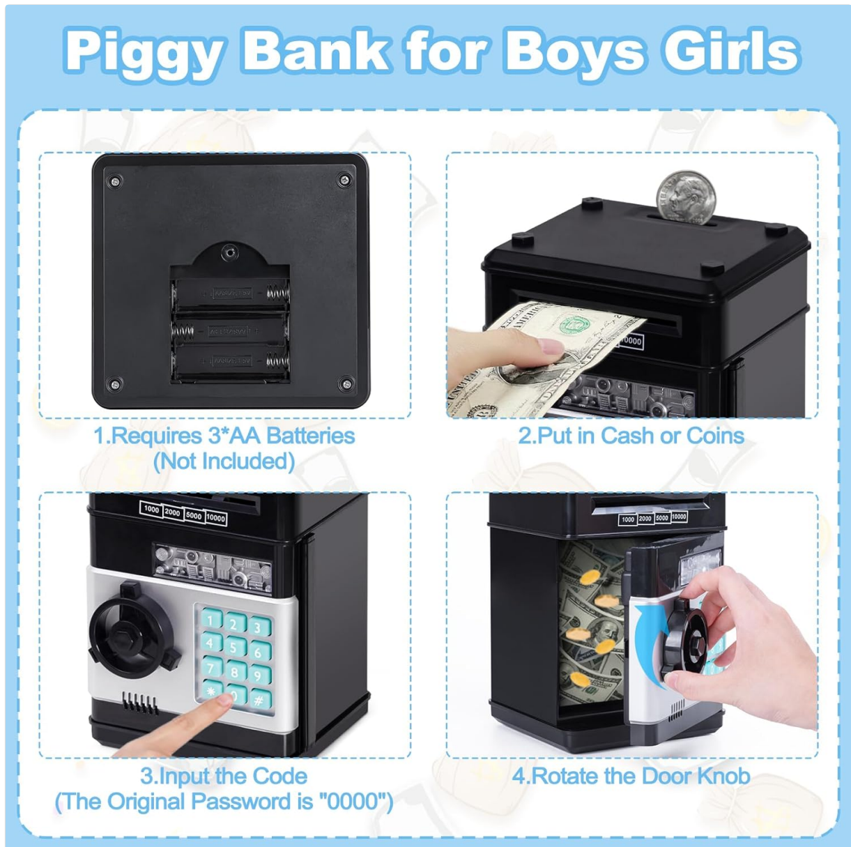
Image: Visual guide for initial setup and usage, including battery placement and password entry.

The default password for your piggy bank is 0000 .