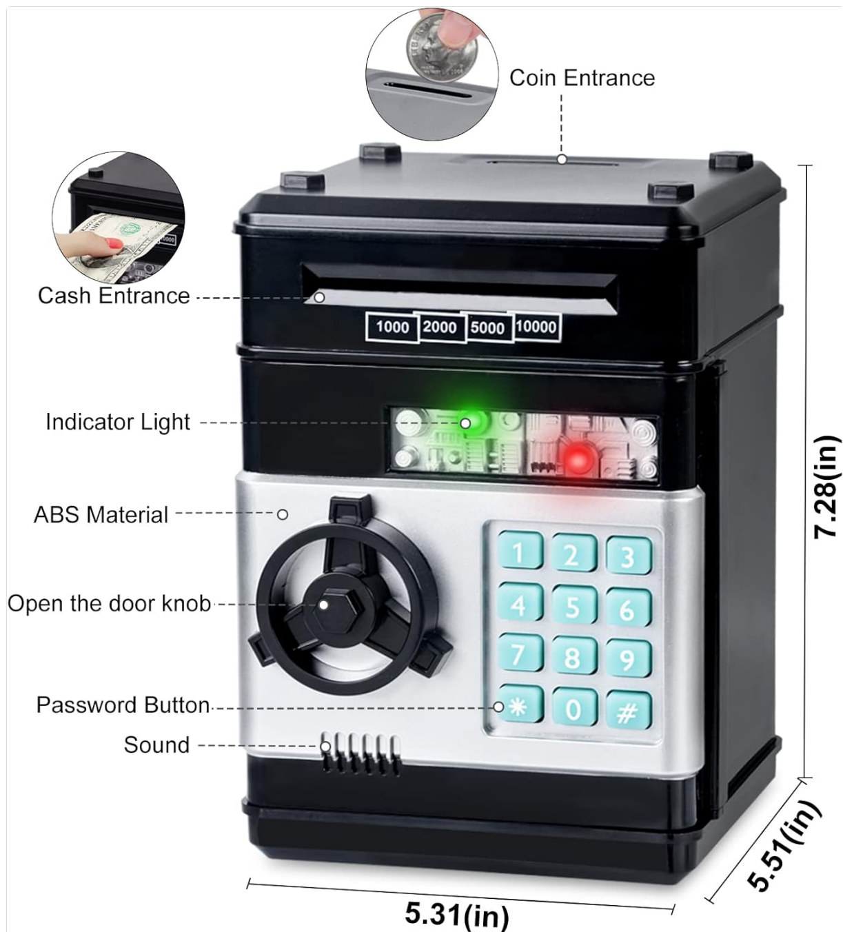
Image: Front view of the piggy bank highlighting key features like cash and coin slots, keypad, and door knob.