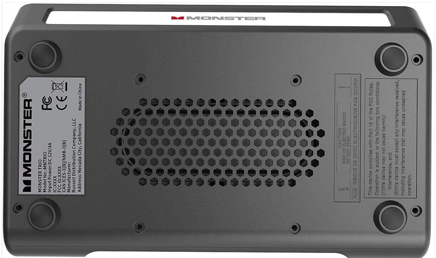
Figure 4: Bottom View with Specifications. This image shows the bottom of the Monster Trio, displaying the product label which includes