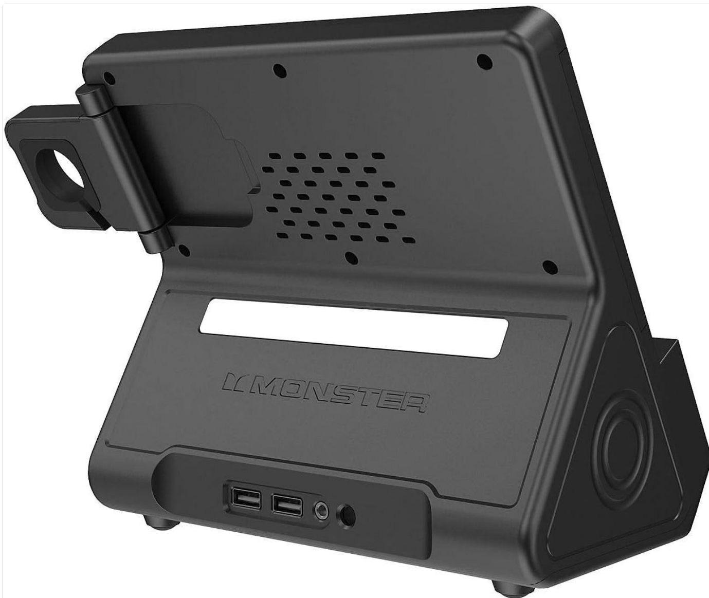
Figure 2: Rear View. This image displays the back of the Monster Trio, featuring two USB charging ports and the power input jack at the bottom. A ventilation grille is visible above the ports.