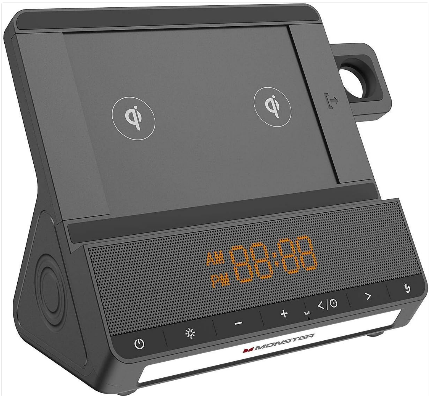
Figure 1: Front View. This image shows the front of the Monster Trio, highlighting the digital LED clock display, the control buttons below it, and the two Qi wireless charging pads on the angled top surface.