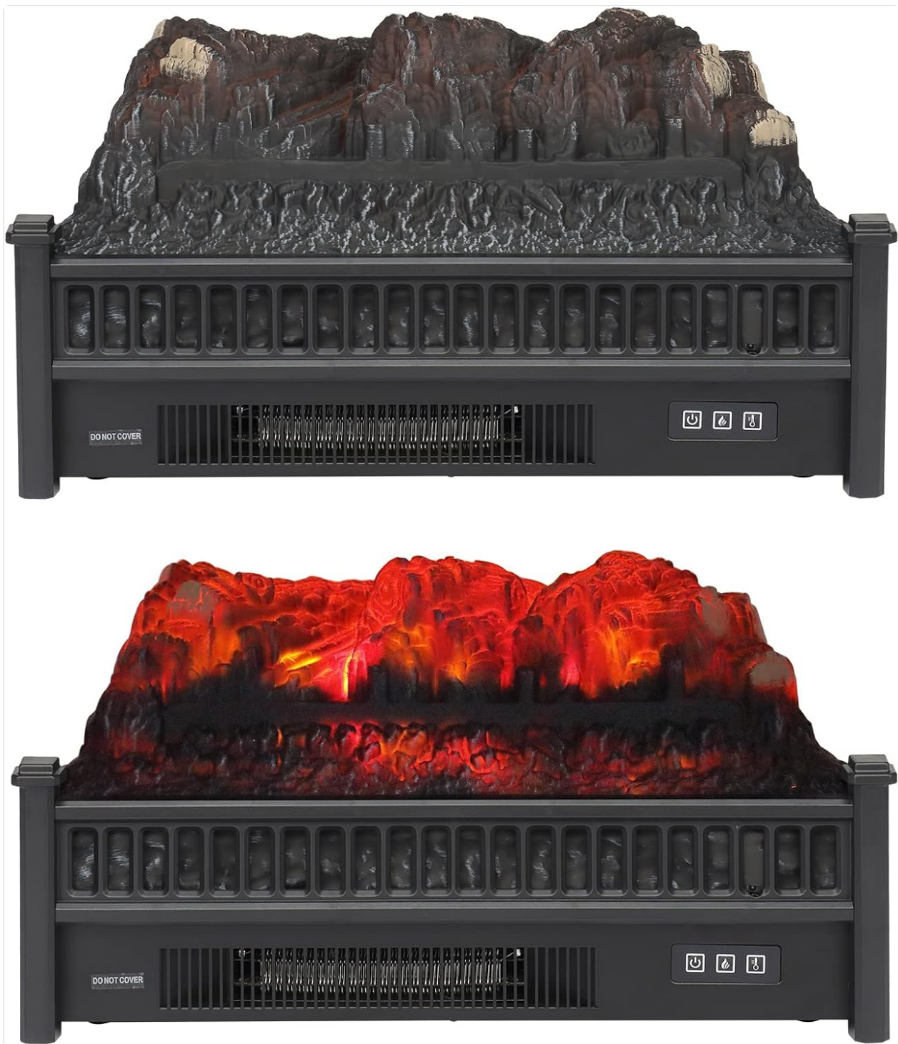
Image: The fireplace insert displaying its realistic flame effect and ember bed, with logs appearing to glow.