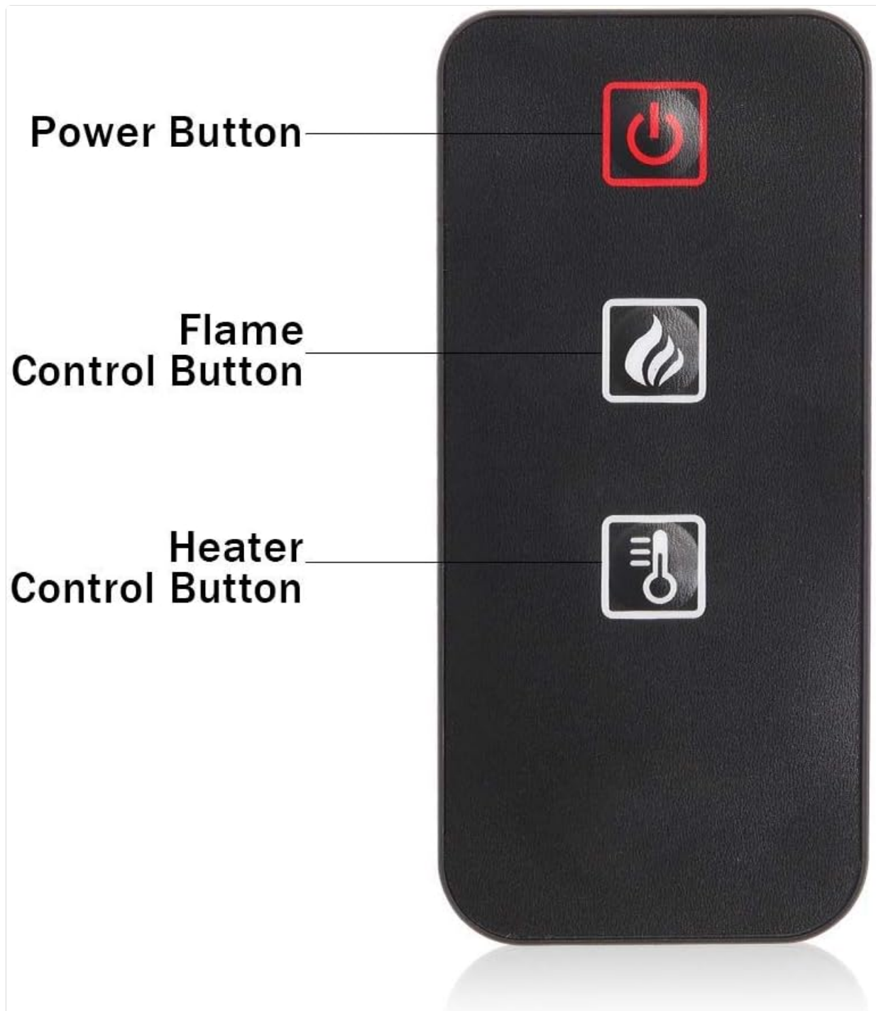
Image: The remote control with clearly visible buttons for operating the fireplace functions.