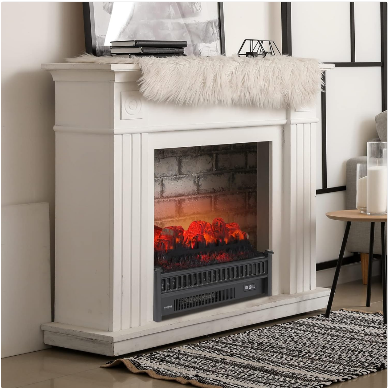
Image: The ZOKOP Electric Fireplace Insert positioned within a fireplace opening, demonstrating typical placement.