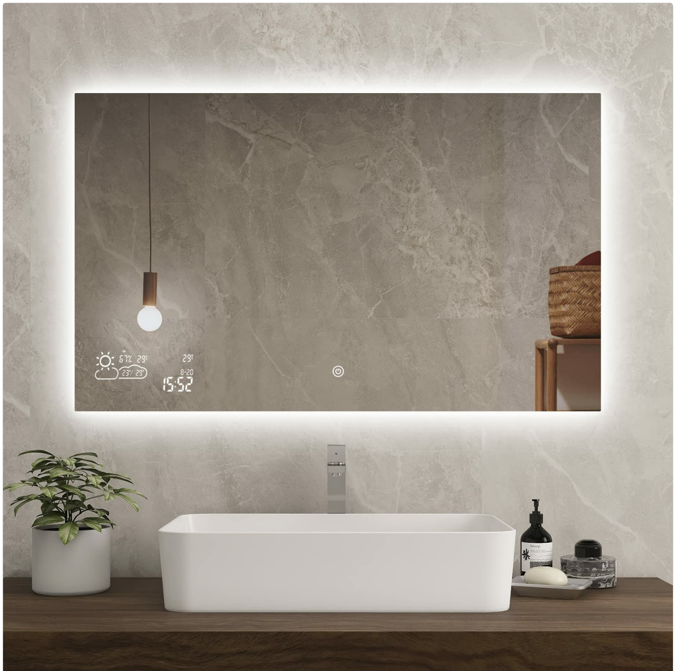
Image: The BYECOLD Smart Bathroom Mirror, showcasing its illuminated design and integrated digital display for weather and time.