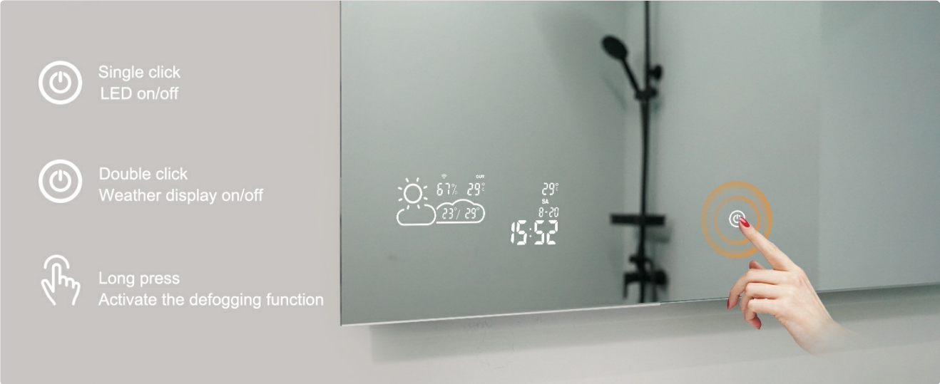
Image: The mirror's heated defogging function in action, ensuring a clear view even in a steamy bathroom environment.