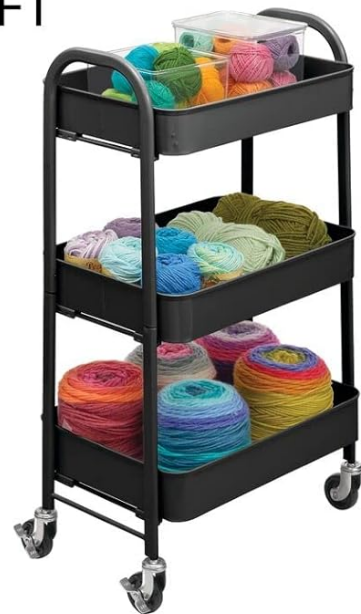
Figure 5.1: Versatile uses of the mDesign 3-Tier Rolling Utility Cart. This composite image illustrates how the cart can be effectively used in various environments such as a bathroom for toiletries, a laundry room for supplies, an office for documents, and a craft room for art materials.