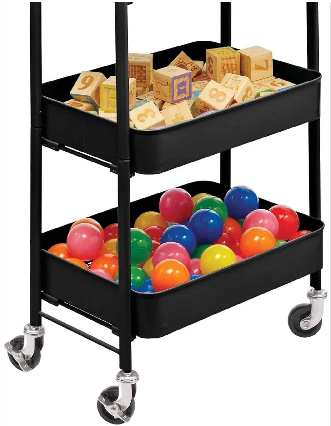
Figure 5.3: Cart used for kids' room storage. This image highlights the cart's suitability for organizing toys, books, and other items in a child's play area or bedroom.