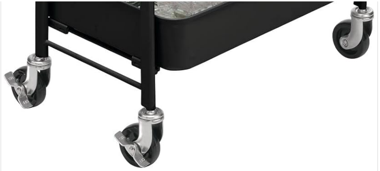
Figure 4.2: Fully assembled mDesign 3-Tier Rolling Utility Storage Cart. This image demonstrates the cart's capacity and design, suitable for organizing various household items.