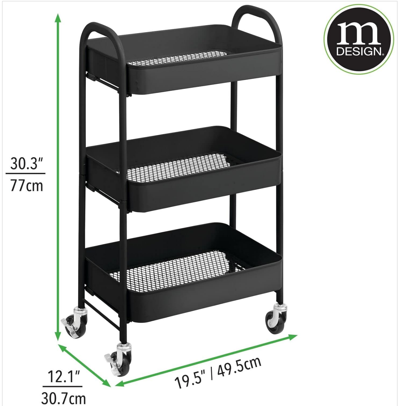
Figure 8.1: Product Dimensions. This diagram provides a clear visual representation of the cart's height, width, and depth, including both imperial and metric measurements.