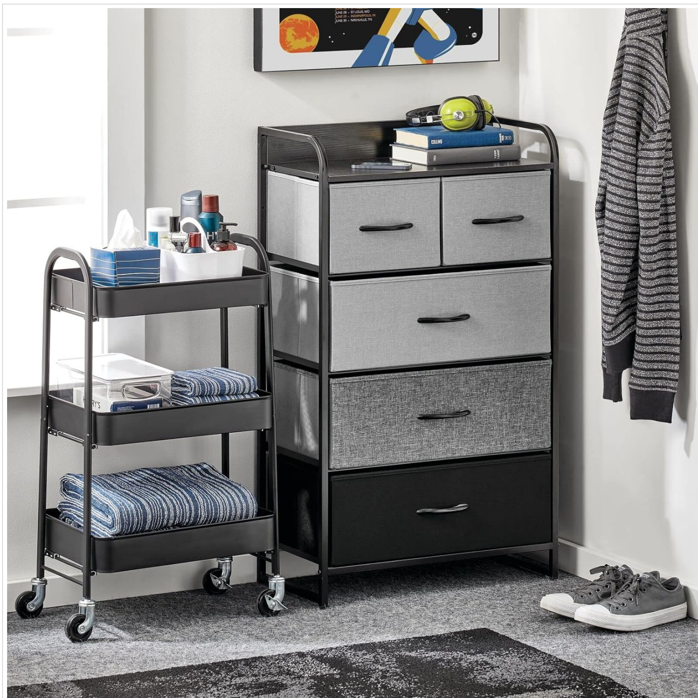
Figure 5.2: Cart in a bedroom setting. This image shows the cart's compact size and how it can fit into smaller spaces, providing additional storage next to furniture.