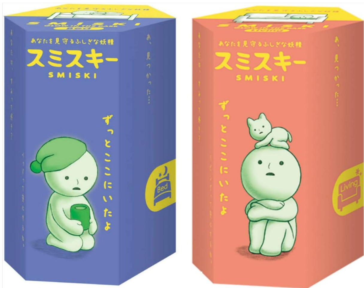
Image: The packaging for the Smiski Bed Series (blue box) and Living Series (orange box).