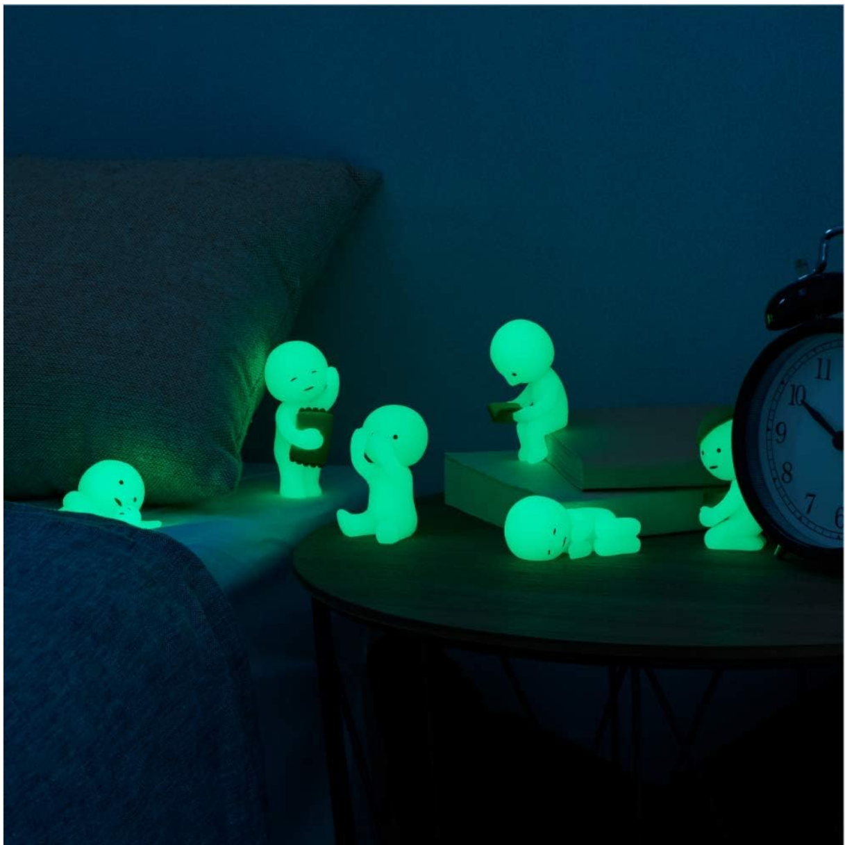
Image: Smiski figures glowing in a dark bedroom, illustrating their primary function.