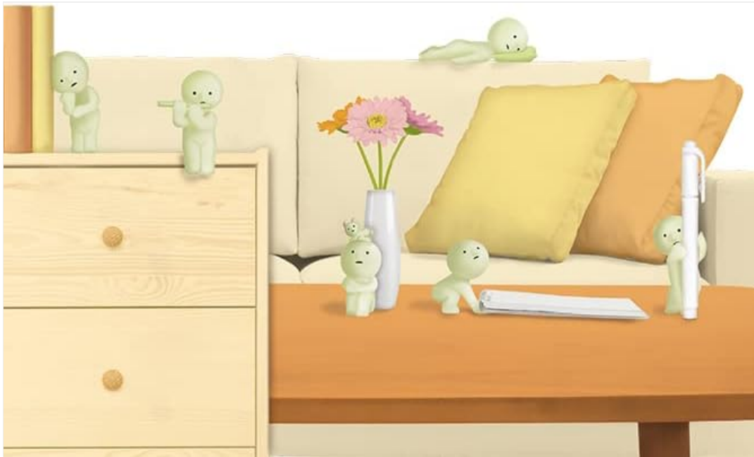
Image: Smiski figures positioned on furniture, showcasing their versatility in home decor.