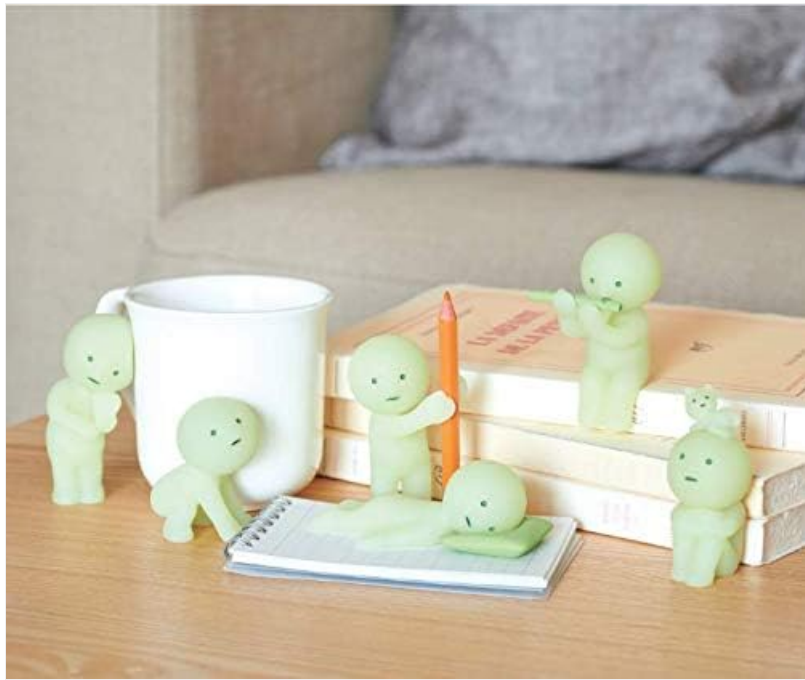
Image: Smiski figures displayed on a desk, demonstrating their suitability for various placements.