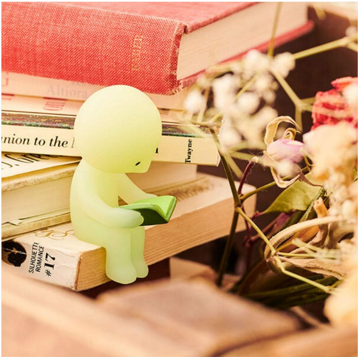
Image: Another Smiski figure from the Bed Series, depicted reading a book.