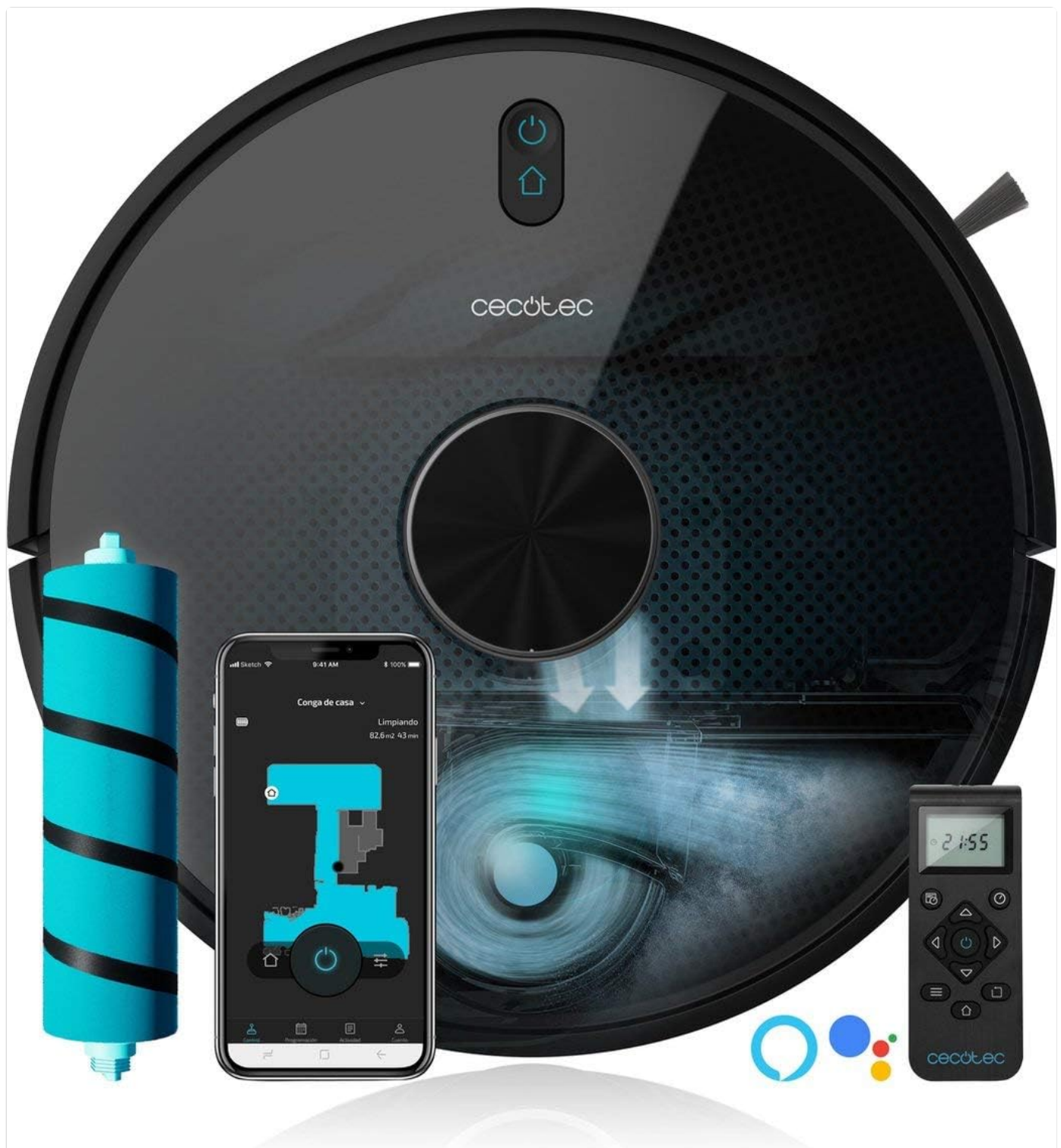
Figure 2.1: The Cecotec Conga 5090 Robot Vacuum Cleaner, showcasing its top view, a side brush, the Jalisco brush, the mobile application interface, and the remote control. This image illustrates the main components and control options.