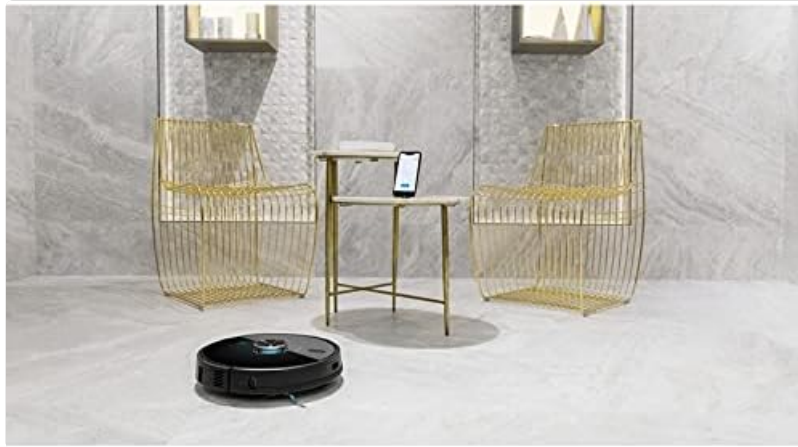
Figure 4.1: The Cecotec Conga 5090 Robot Vacuum Cleaner positioned in a room, demonstrating its compact design and ability to navigate home environments. The image shows the robot on a light-colored floor between two chairs and a small table.