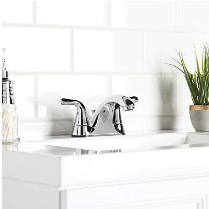
Image 2: The Project Source F51B0066CP faucet shown installed on a white bathroom sink, demonstrating its appearance in a typical bathroom setting. The chrome finish reflects the surrounding environment, and the two handles are visible.