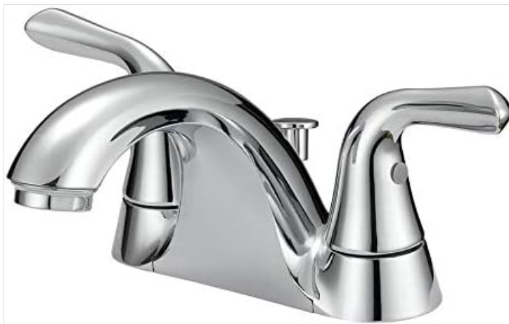
Image 1: Main view of the Project Source F51B0066CP 4-inch Chrome Bathroom Faucet. This image displays the faucet's polished chrome finish, the two handles, and the spout, highlighting its compact and elegant design.

This manual provides detailed instructions for the installation, operation, and maintenance of your Project Source F51B0066CP 4-inch Chrome Bathroom Faucet. This faucet features a versatile design suitable for various bathroom aesthetics, durable solid brass construction, and washerless cartridges for reliable, drip-free performance. Please read this manual thoroughly before beginning installation or use to ensure proper function and longevity of your product.