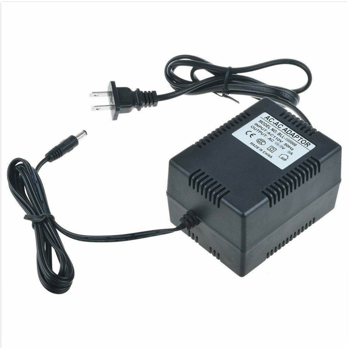
A general view of the YUSTDA 12V AC/AC Adapter, showing its compact design and power plug.