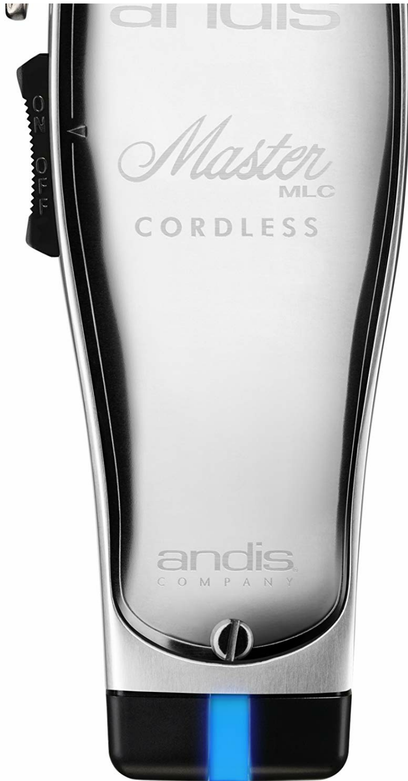
Image: The Andis 12470 Professional Master Corded/Cordless Hair & Beard Trimmer, showcasing its sleek chrome design.