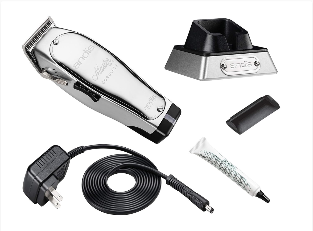
Image: The Andis 12470 trimmer along with its charging stand, power adapter, blade cleaning brush, and blade oil.