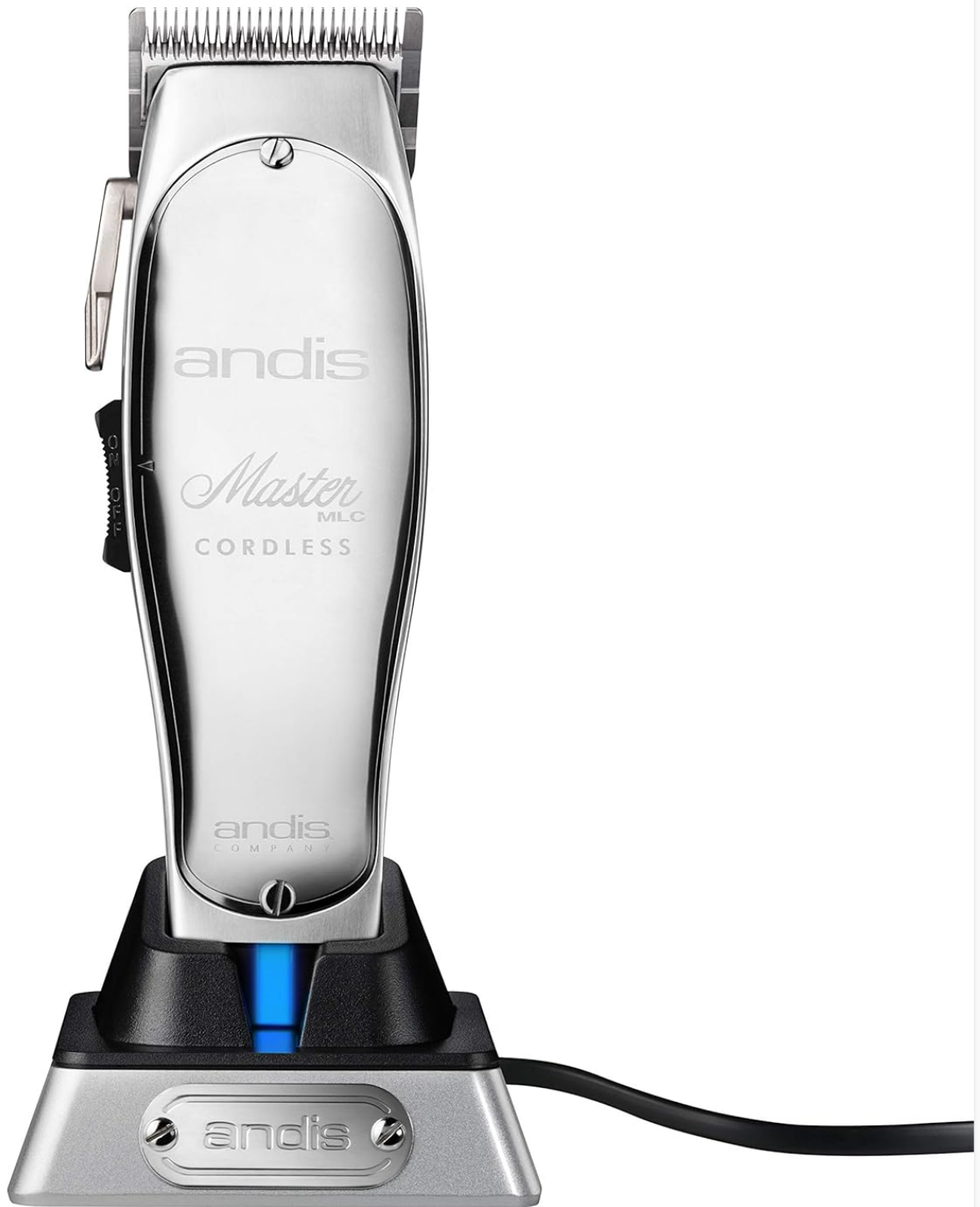
Image: The Andis 12470 trimmer securely placed on its charging stand, ready for use or charging.