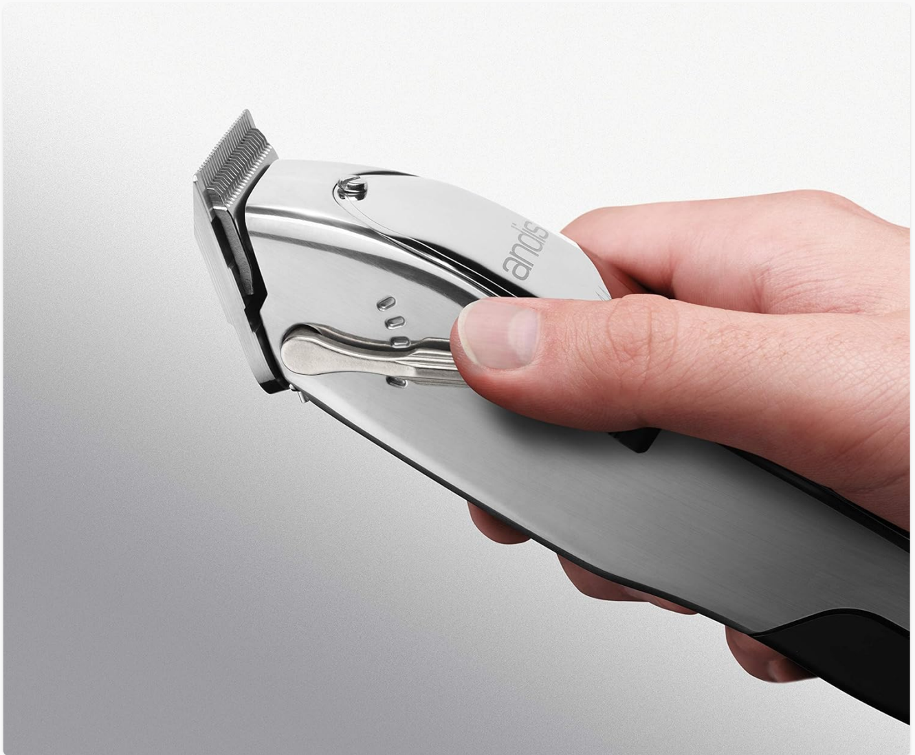
Image: A hand demonstrating the use of the adjustable blade lever on the side of the Andis 12470 trimmer.