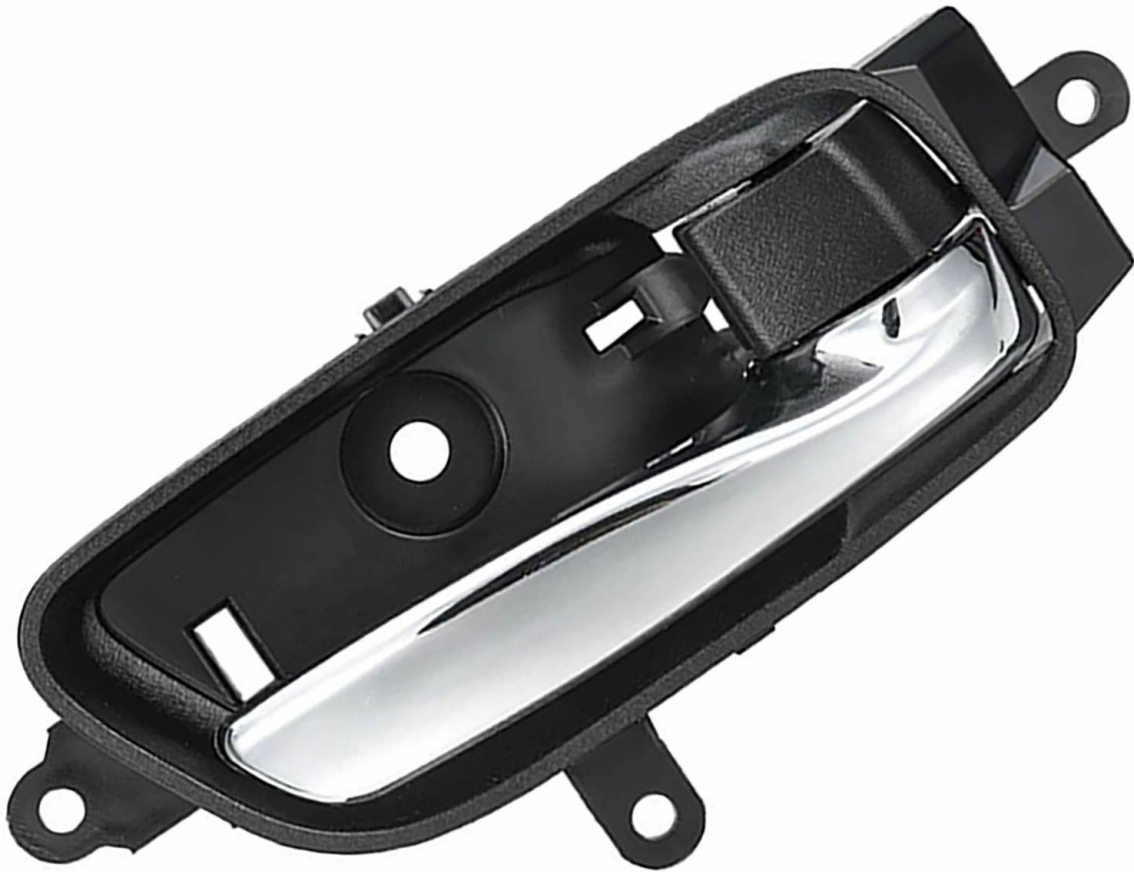
Image: NPAUTO Interior Passenger Side Door Handle installed in a car interior.