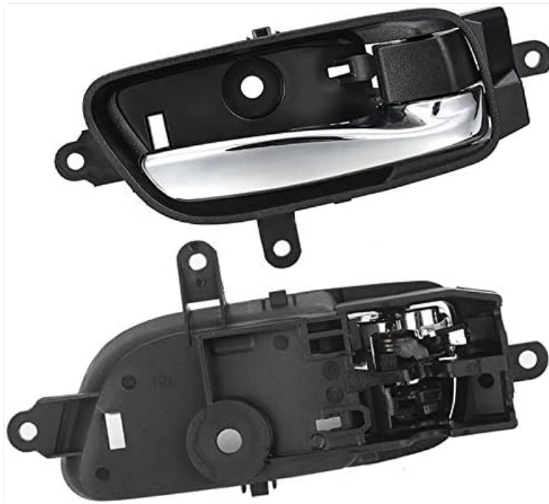
Image: Side view of the NPAUTO Interior Door Handle, illustrating its mechanism.

If you are unsure about any step, it is recommended to seek professional assistance or consult a vehicle-specific repair guide.