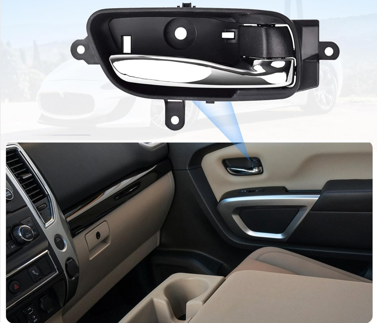
Image: Visual representation of compatible vehicle models.