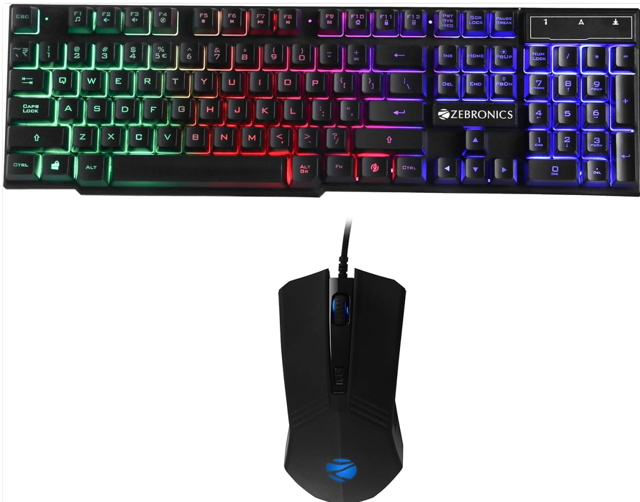
Image: The Zebronics Zeb-Fighter Gaming Keyboard and Mouse Combo, showcasing both devices with multi-color LED

Thank you for choosing the Zebronics Zeb-Fighter Gaming Keyboard and Mouse Combo. This manual provides essential information for setting up, operating, maintaining, and troubleshooting your new gaming peripherals. Please read these instructions carefully before use to ensure optimal performance and longevity of your product.