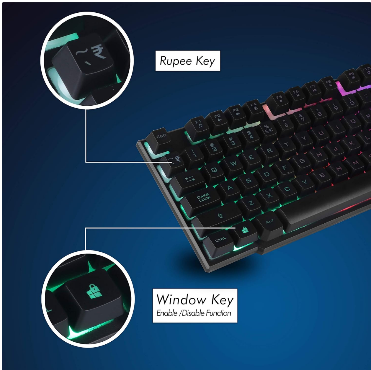
Image: Close-up view of the keyboard, specifically pointing out the Rupee key and the Windows key with its enable/disable function.