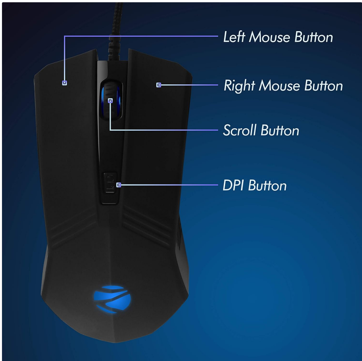
Image: The gaming mouse with labels indicating the Left Mouse Button, Right Mouse Button, Scroll Button, and DPI Button.