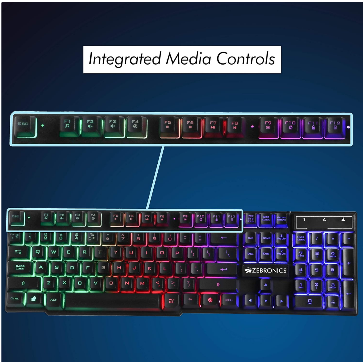
Image: The keyboard with a visual overlay highlighting the integrated media control keys (F1-F12) for quick access to audio and playback functions.