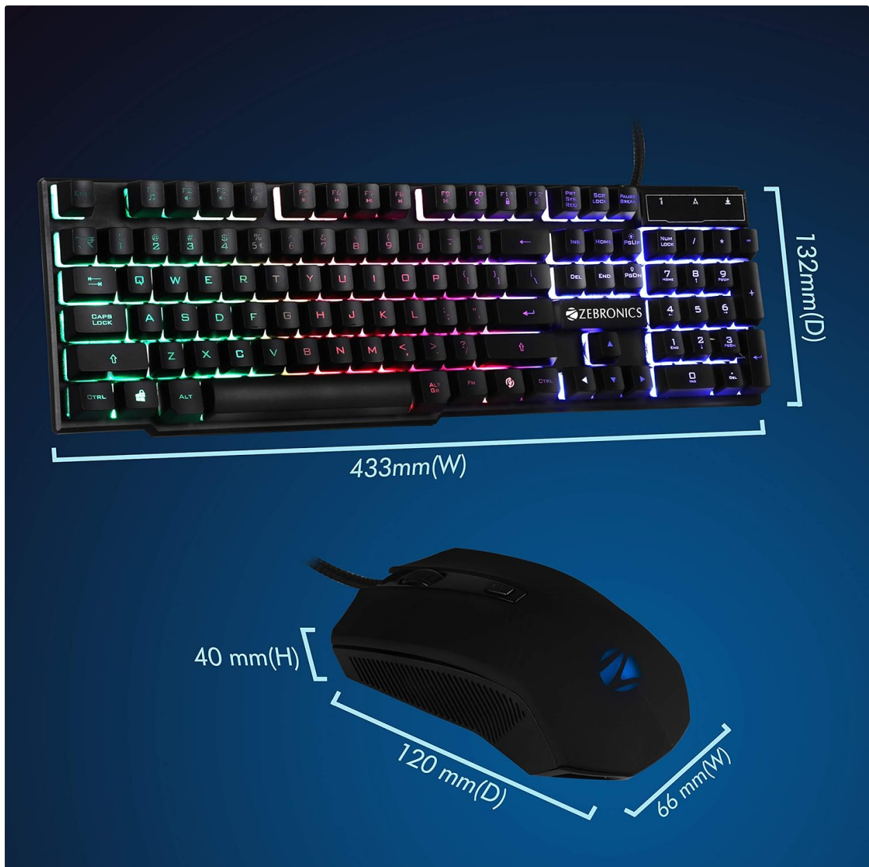
Image: Diagram illustrating the dimensions of both the Zebronic Zeb-Fighter keyboard (433mm W x 132mm D) and mouse (120mm D x 66mm W x 40mm H).