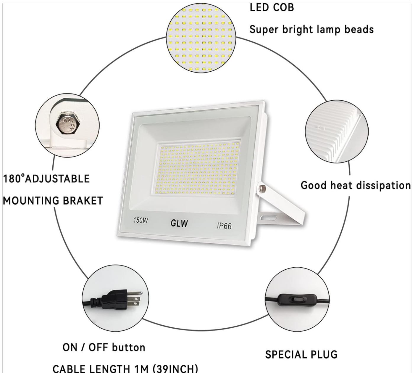
Image 1: Overview of the GLW 150W LED Flood Light components, highlighting the LED COB, 180° adjustable mounting bracket, good heat dissipation fins, ON/OFF button, and special plug. The cable length is 1 meter (39 inches).