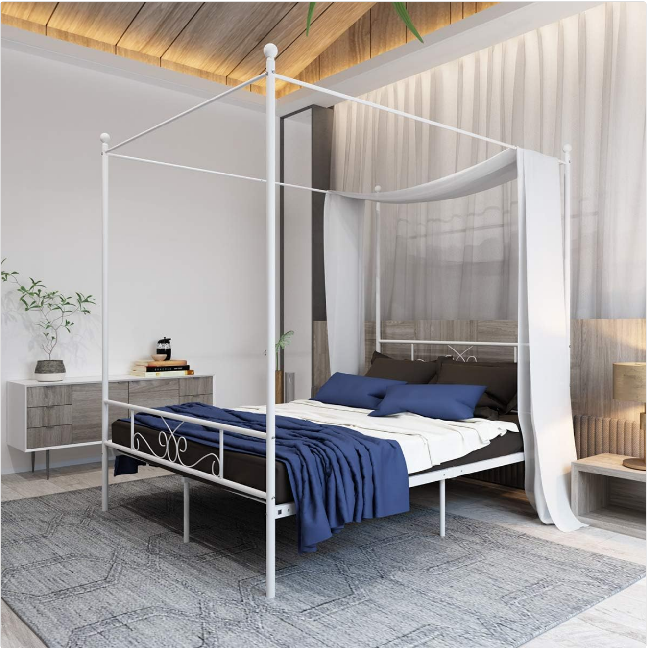
Image: The Weehom Full Canopy Bed Frame, white, with bedding and decorative canopy drapes, positioned in a modern bedroom.