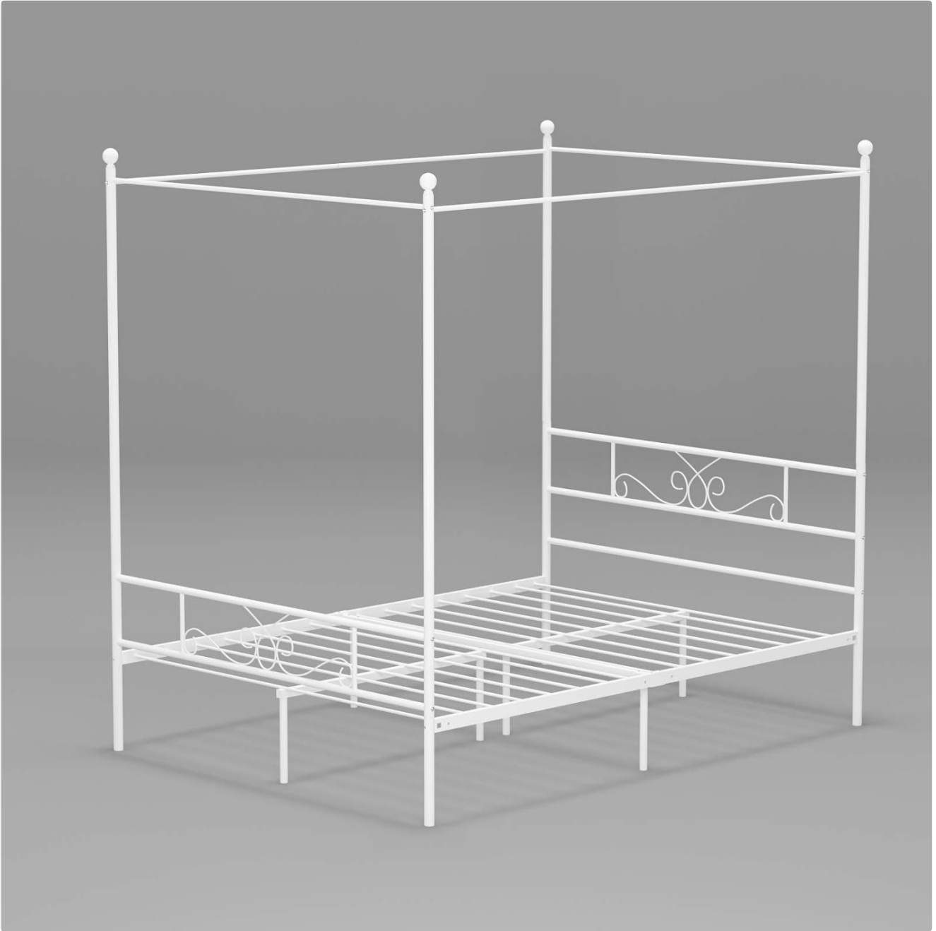
Image: The assembled bed frame structure, highlighting the metal slats that support the mattress.