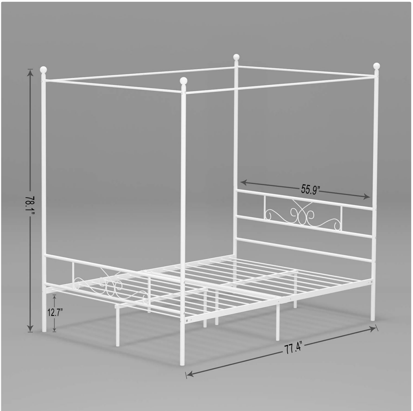
Image: Dimensional drawing of the bed frame, indicating length, width, height, and under-bed storage height.