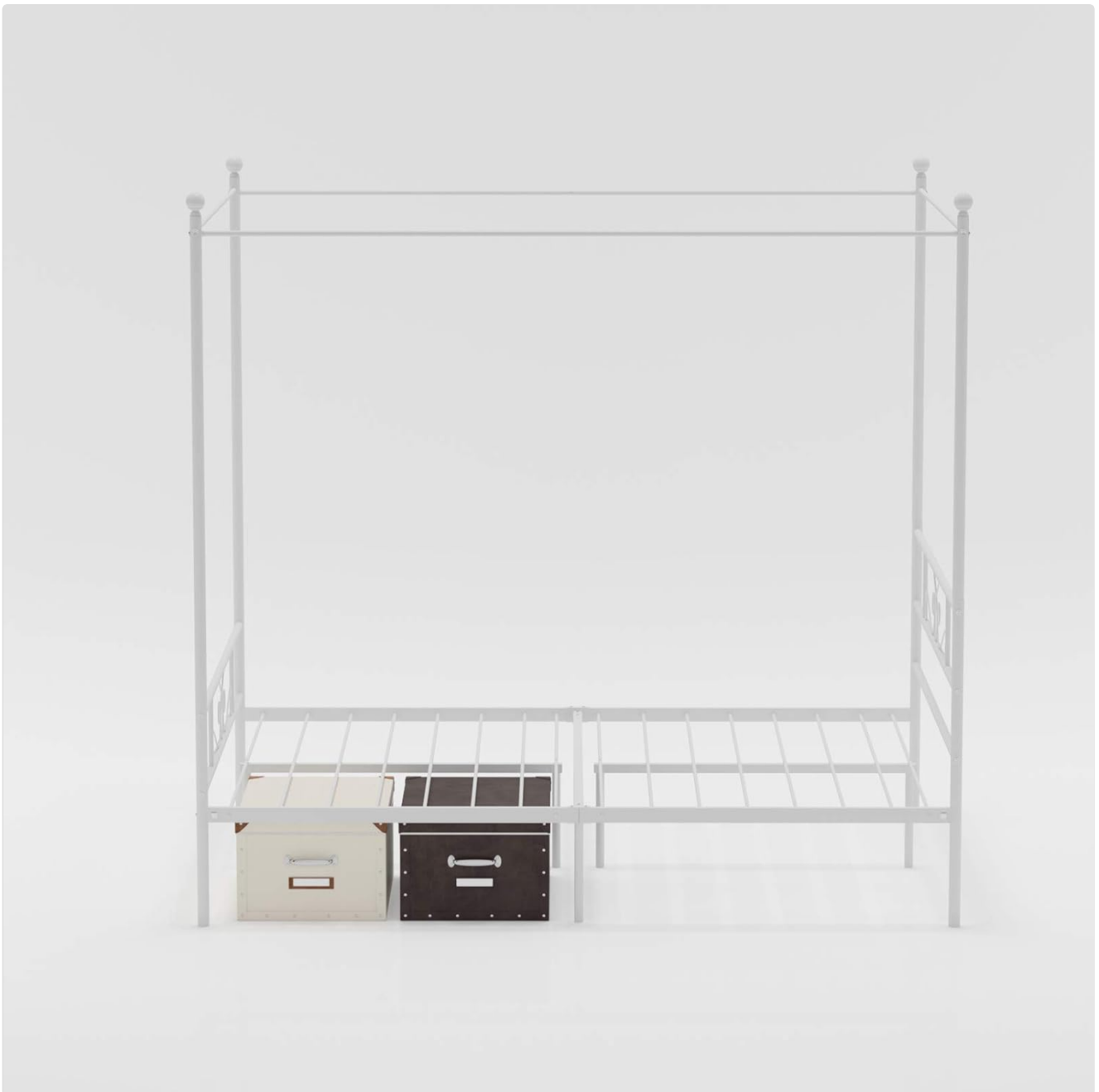
Image: The bed frame illustrating the available under-bed storage space, with two storage bins placed underneath.