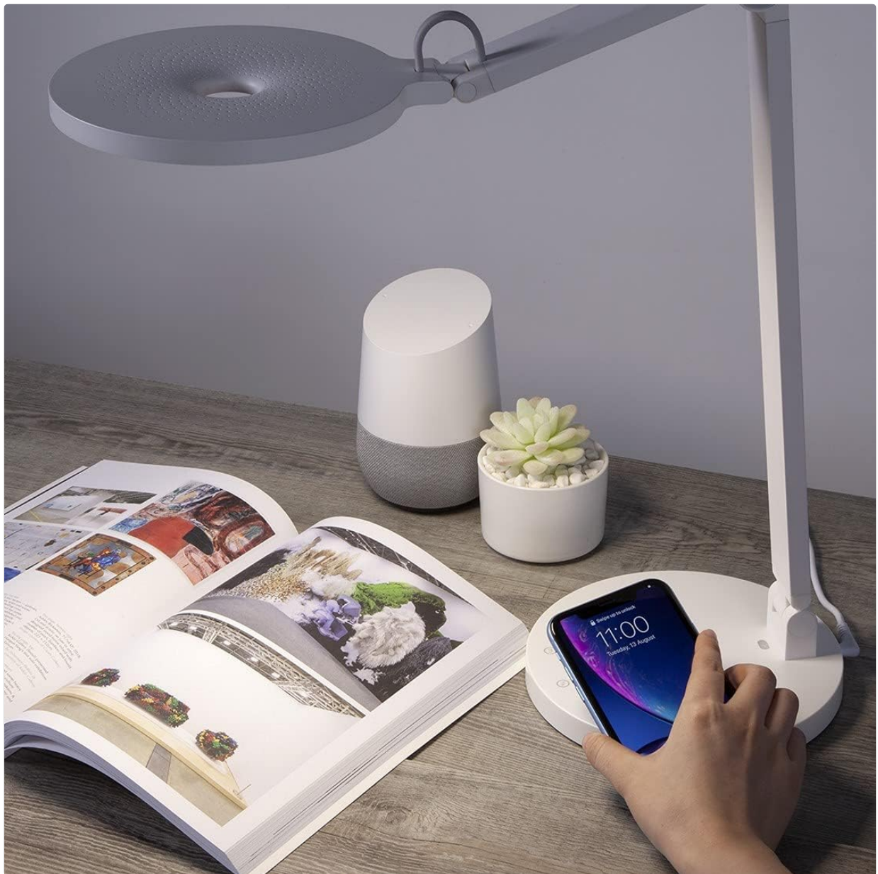
Figure 5.2: The lamp offers three distinct color temperature modes to suit various activities and preferences.