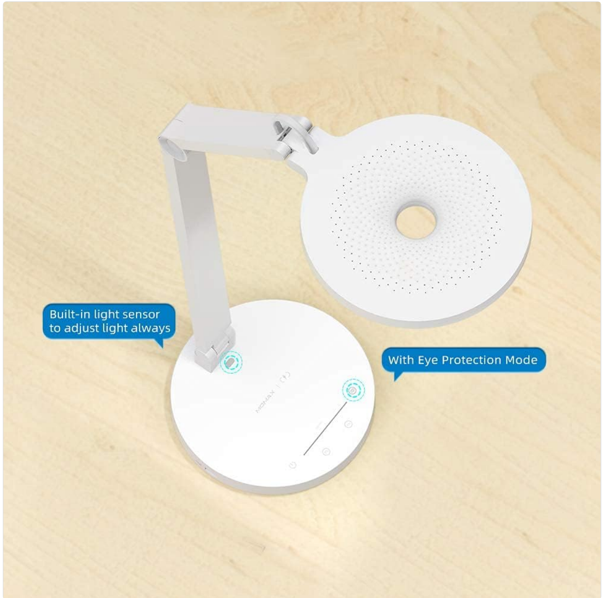
Figure 5.1: The touch control panel on the lamp base for power, brightness, mode, eye protection, and timer functions.