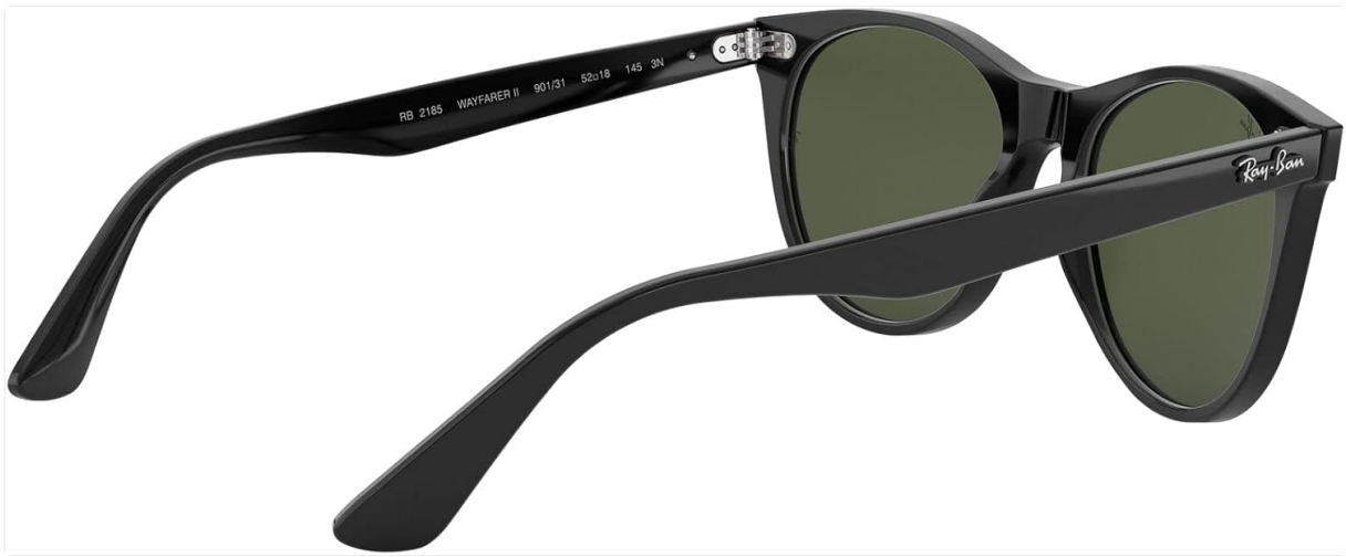
Image: A back view of the Ray-Ban RB2185 Wayfarer II sunglasses, showing the inner side of the temples and the bridge.