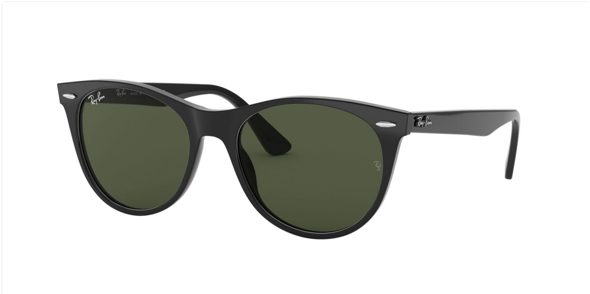
Image: Front view of the Ray-Ban RB2185 Wayfarer II sunglasses in black with G-15 green lenses. This image displays the iconic Wayfarer shape with a slightly rounded frame.

The Ray-Ban RB2185 Wayfarer II sunglasses combine classic design with modern features. This manual provides essential information for the proper use, care, and maintenance of your sunglasses to ensure their longevity and optimal performance.