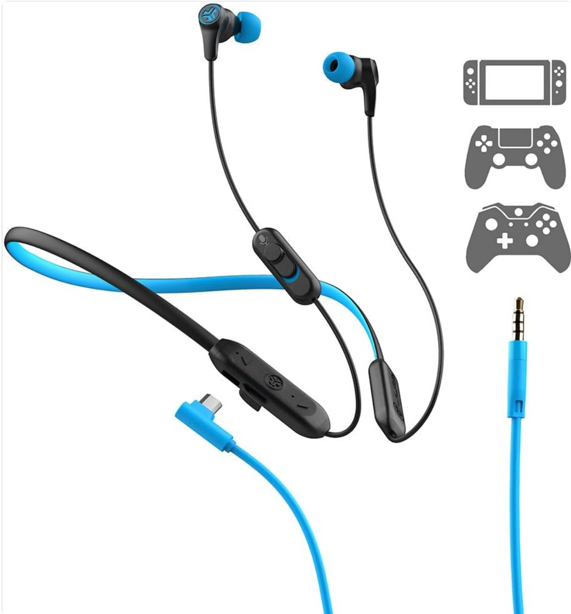
Image: JLab Play Gaming Wireless Earbuds shown with the AUX console cord, illustrating wired connection capability.