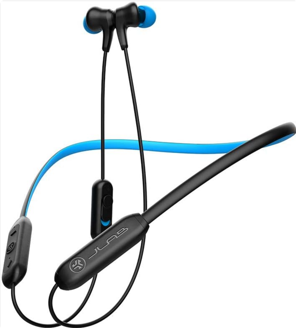
Image: The JLab Play Gaming Wireless Earbuds with their magnetic earpieces connected, demonstrating a convenient storage method.