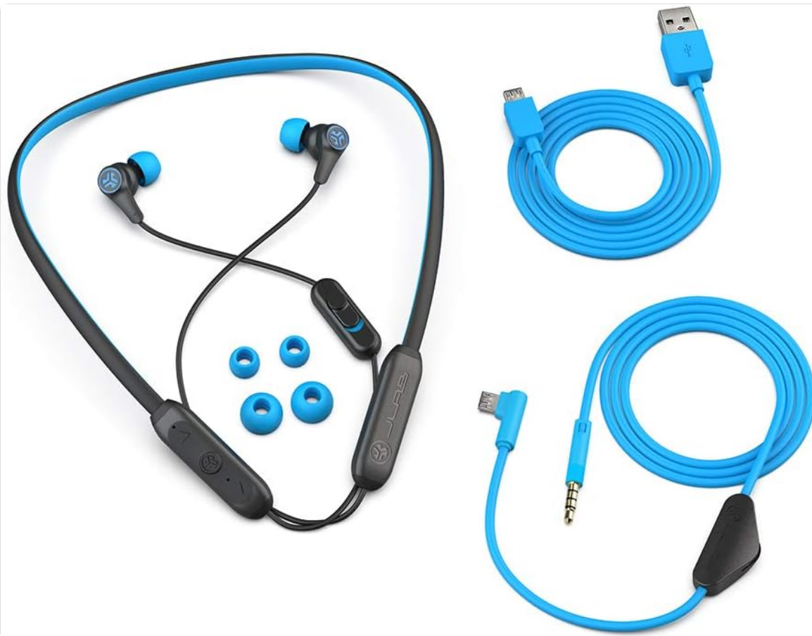
Image: JLab Play Gaming Wireless Earbuds, Micro USB charging cable, 3.5mm AUX console cord, travel bag, and various ear tip sizes.