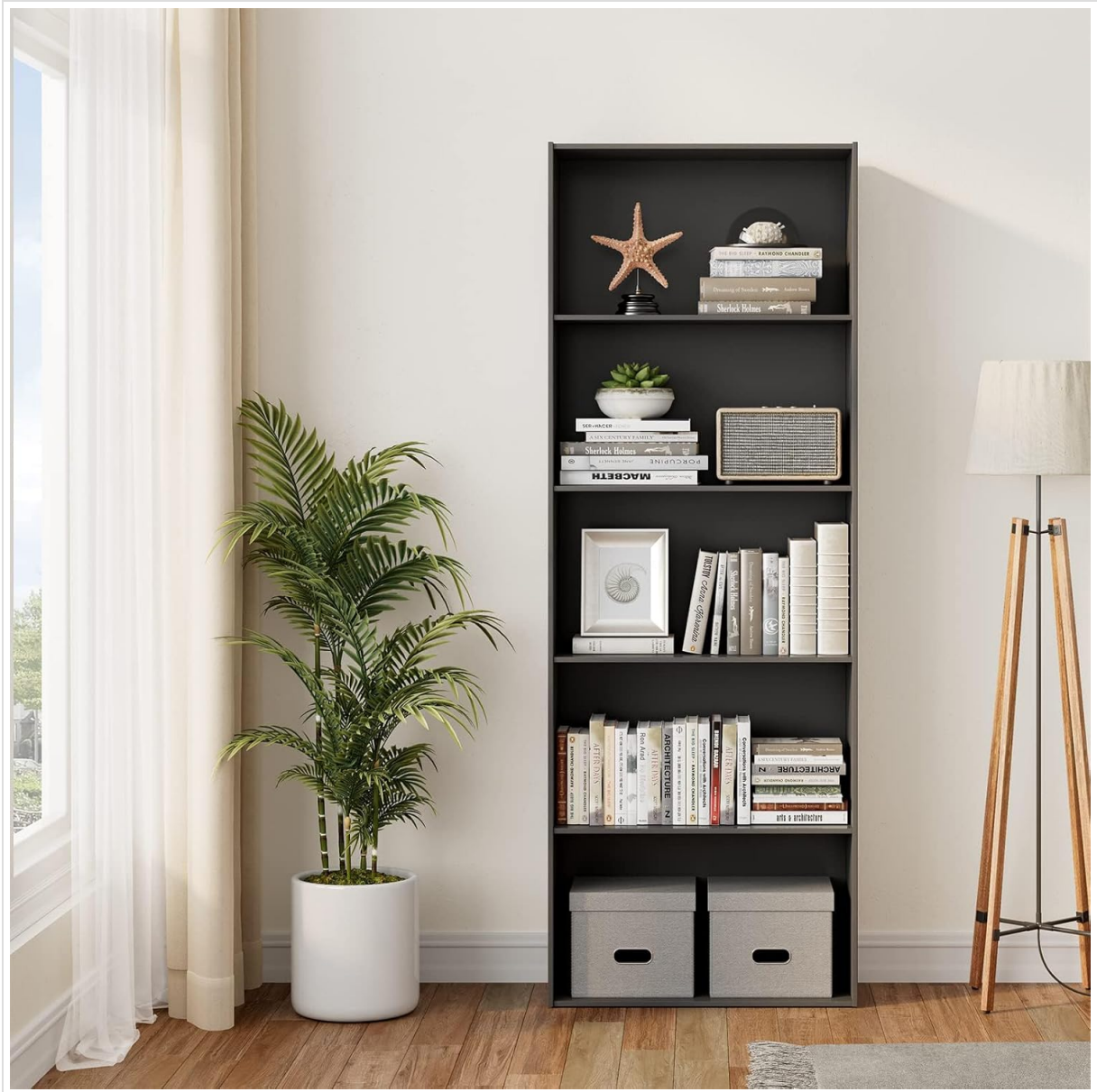
A full view of the CasartUS 5-Shelf Open Bookcase, elegantly styled in a room, highlighting its capacity for books and decorative items.