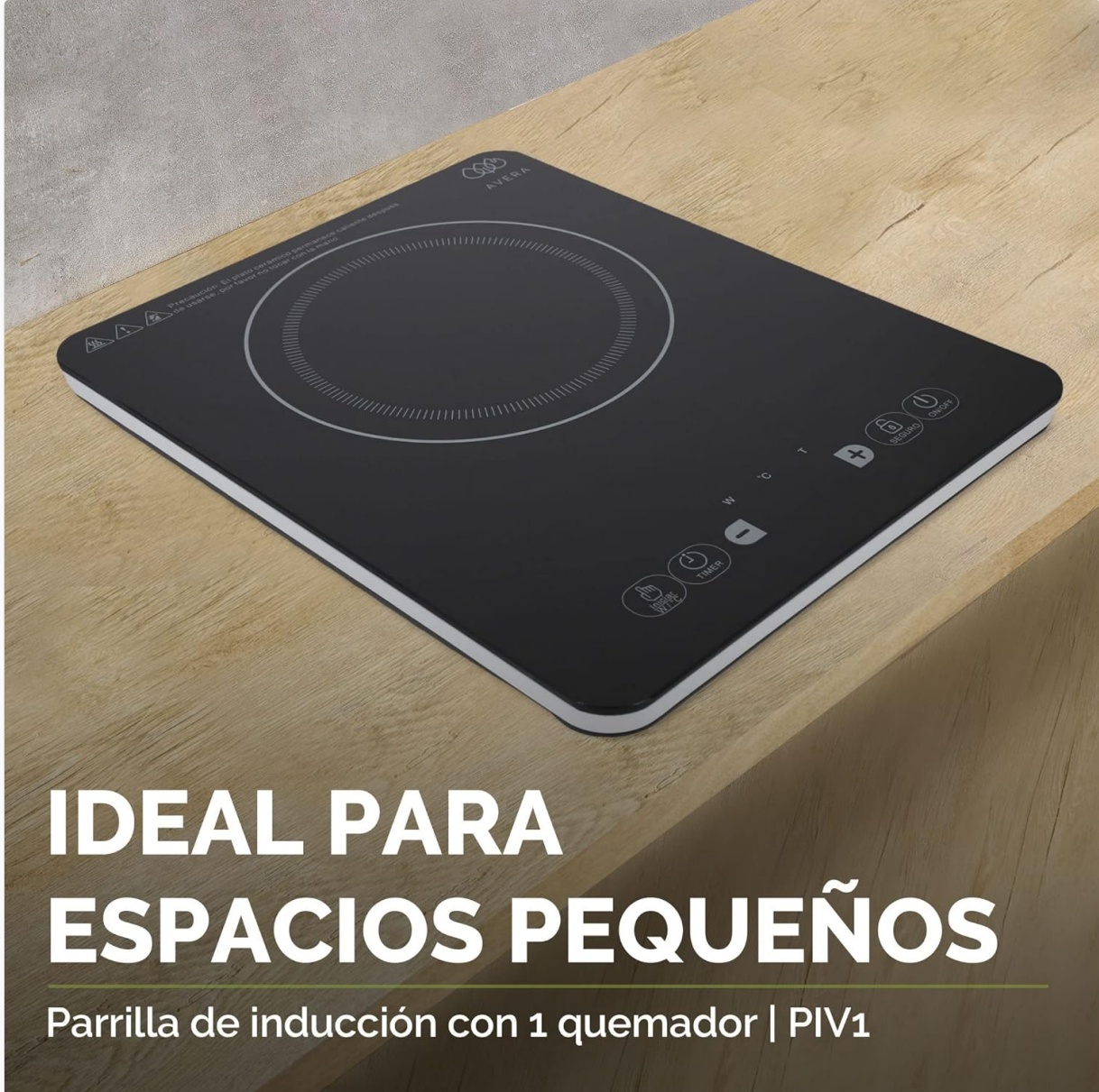
Figure 3: Cooktop Placement. This image shows the compact AVERA PIV1 cooktop placed on a kitchen countertop, demonstrating its suitability for small spaces.