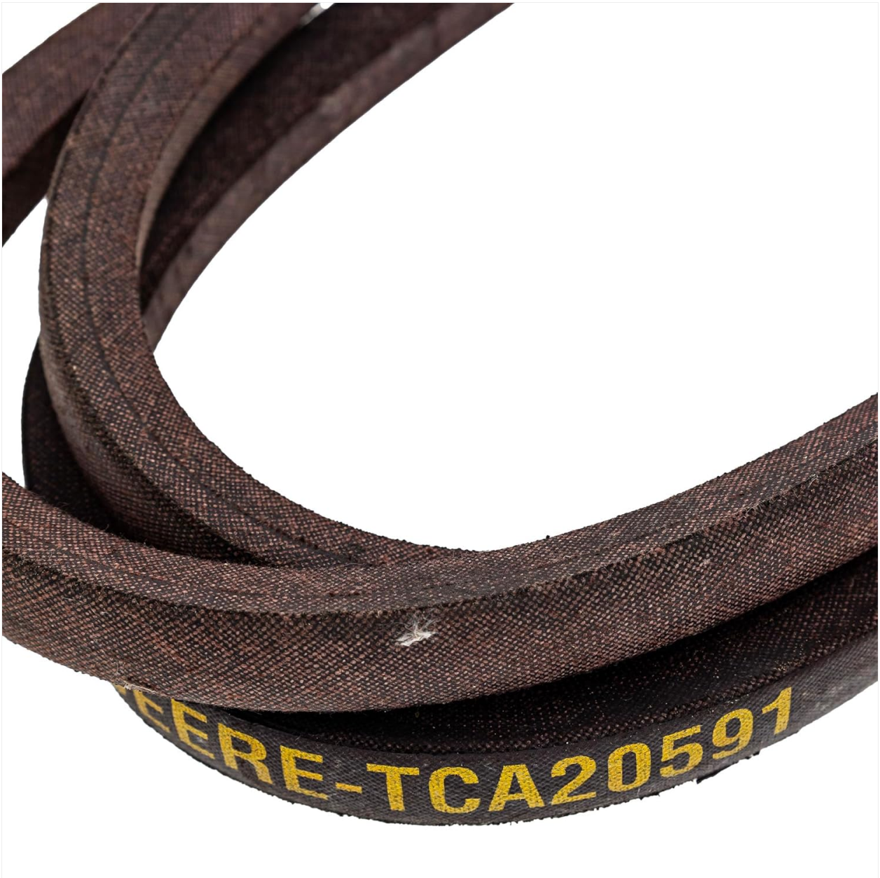
Figure 3: A close-up view of the belt, highlighting the "DEERE-TCA20591" marking, confirming its compatibility and OEM replacement status.