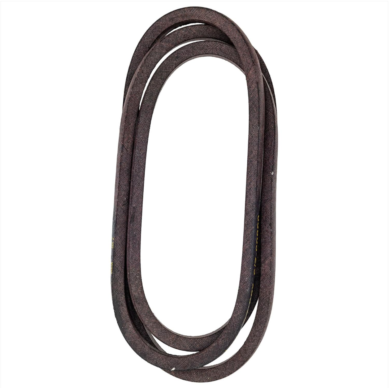
Figure 2: The SureFit 36" Deck Drive Belt uncoiled, ready for installation. Note the smooth, consistent surface.