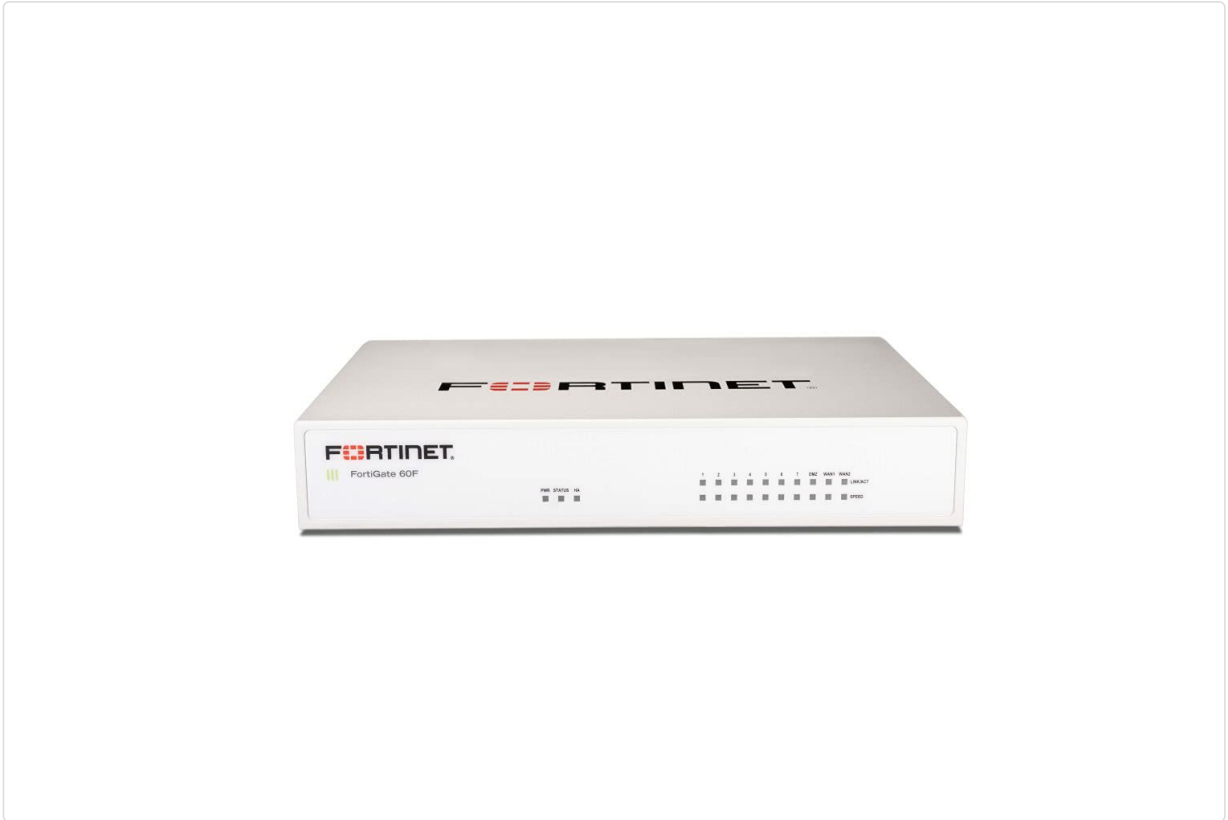
Figure 1: Front and Rear View of FortiGate-60F with 10 GE RJ45 ports highlighted. Also shows indicators for small form factor, SPU for unparalleled performance, and Universal ZTNA.

The FortiGate-60F features a compact design with multiple ports for flexible network connectivity and robust security processing capabilities.