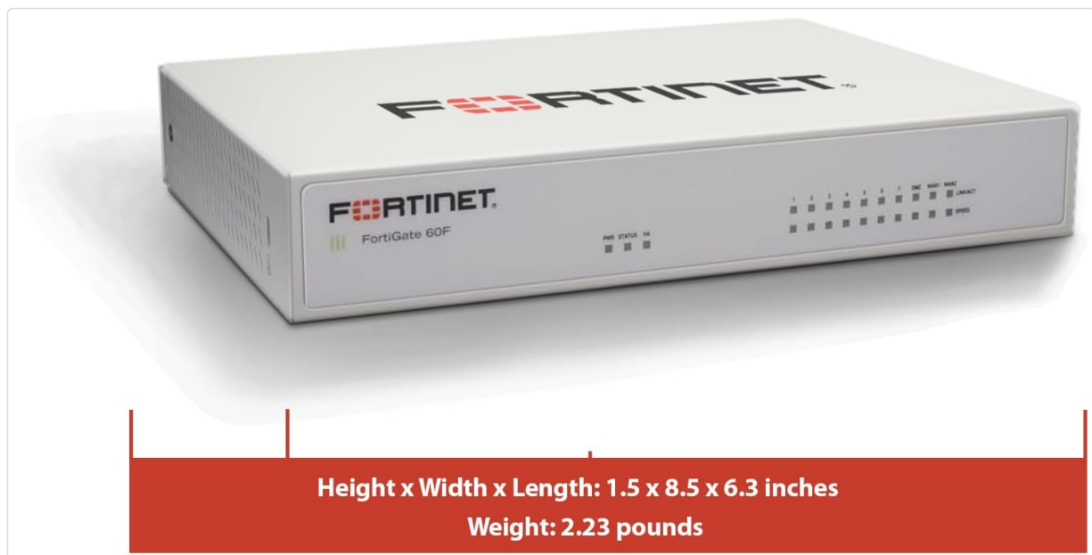
Figure 3: Physical dimensions and weight of the FortiGate-60F. Height x Width x Length: 1.5 x 8.5 x 6.3 inches. Weight: 2.23 pounds.

Detailed technical specifications for the FortiGate-60F: