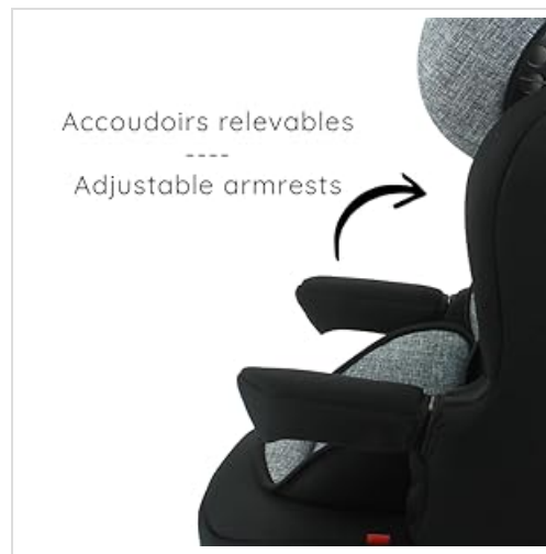
Figure 5.3: Detail of the articulated armrest.