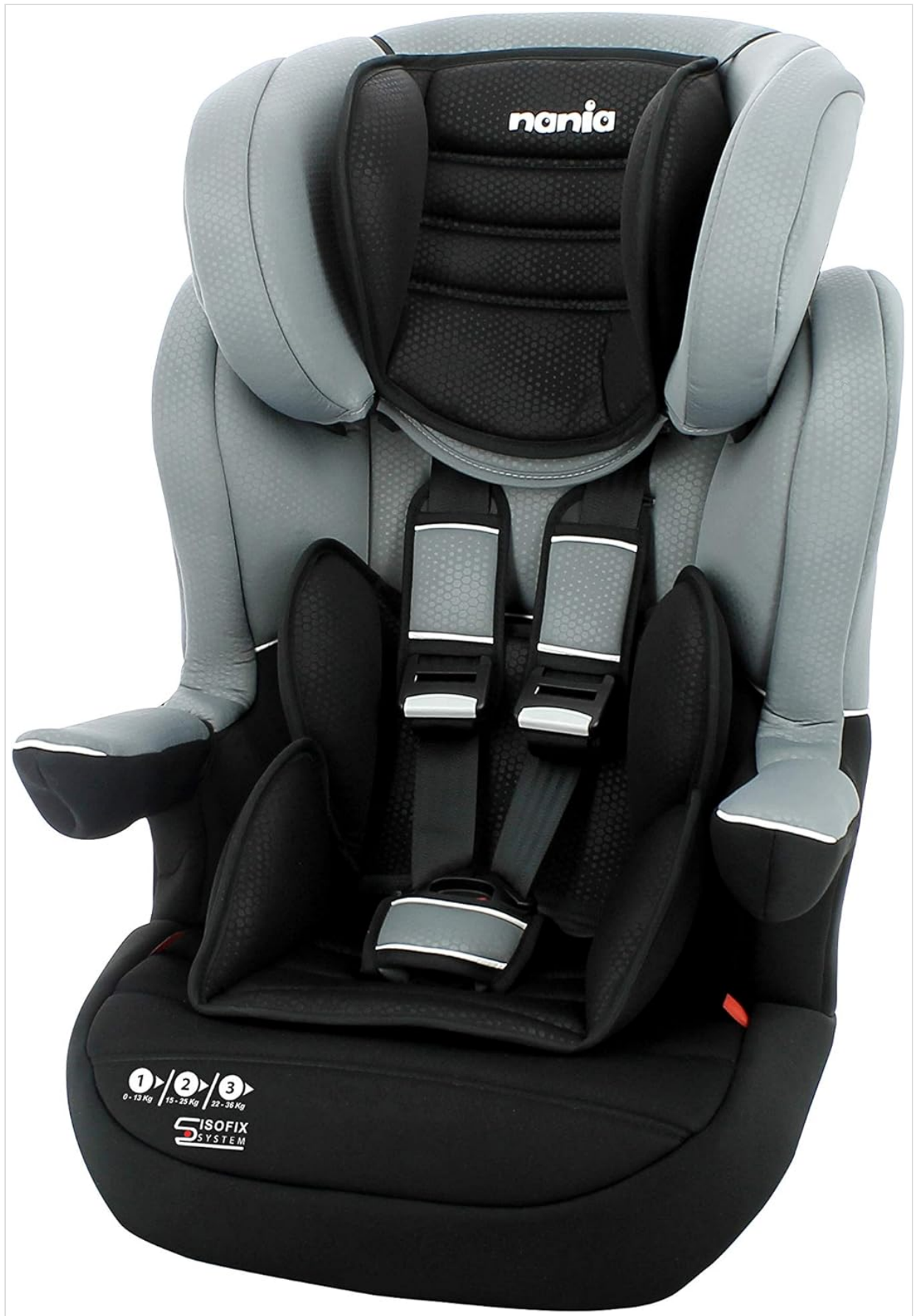
Figure 3.1: Front view of the Nania IMAX Isofix Car Seat, showing the 5-point harness and adjustable headrest.