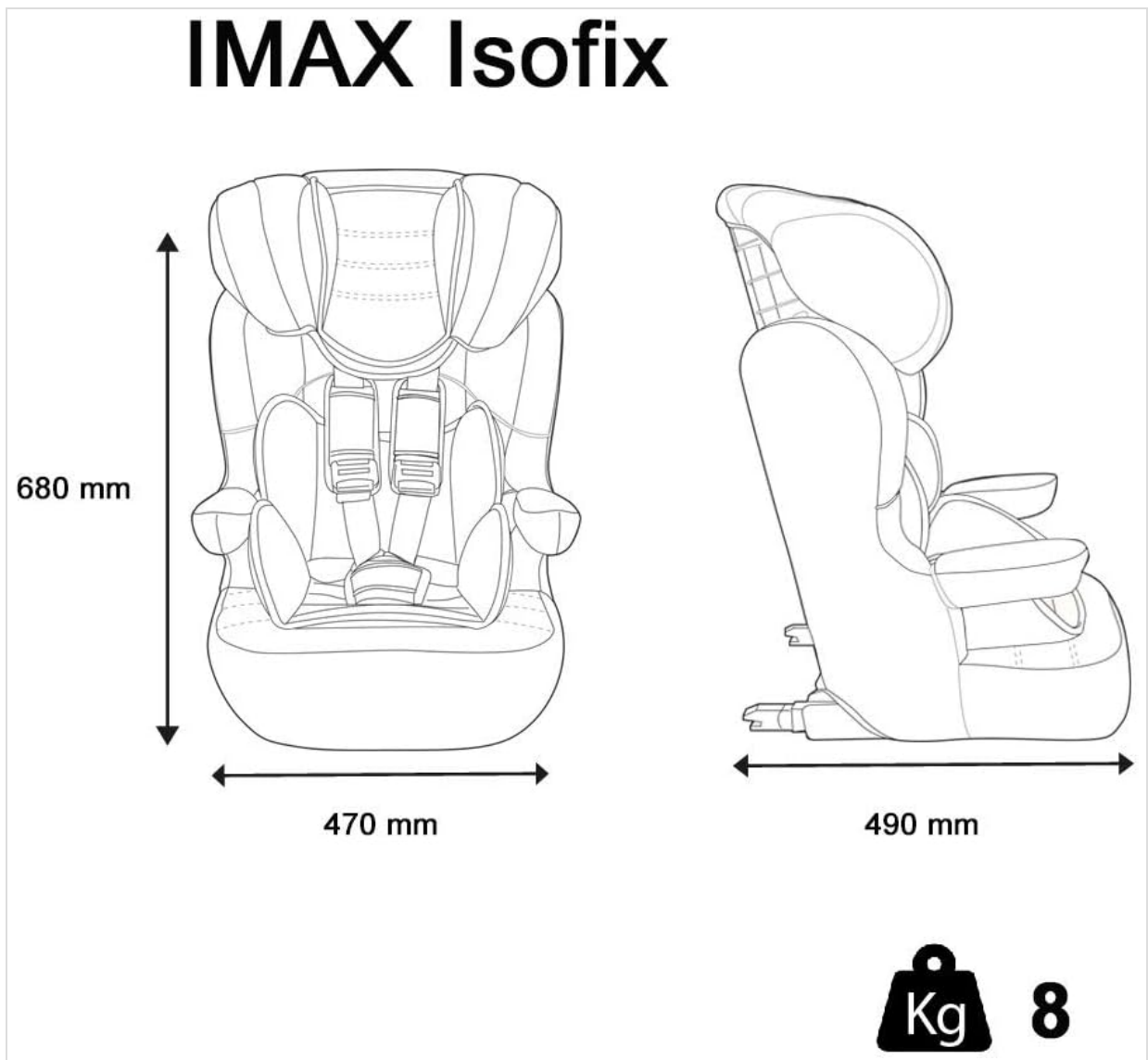
Figure 8.1: Diagram showing the dimensions of the Nania IMAX Isofix Car Seat.