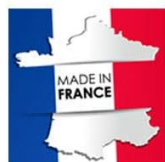
Image descriptive - coloris non contractuel Descriptive image - non-contractual colours