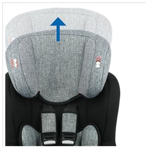
Figure 5.2: Close-up of the headrest adjustment mechanism.