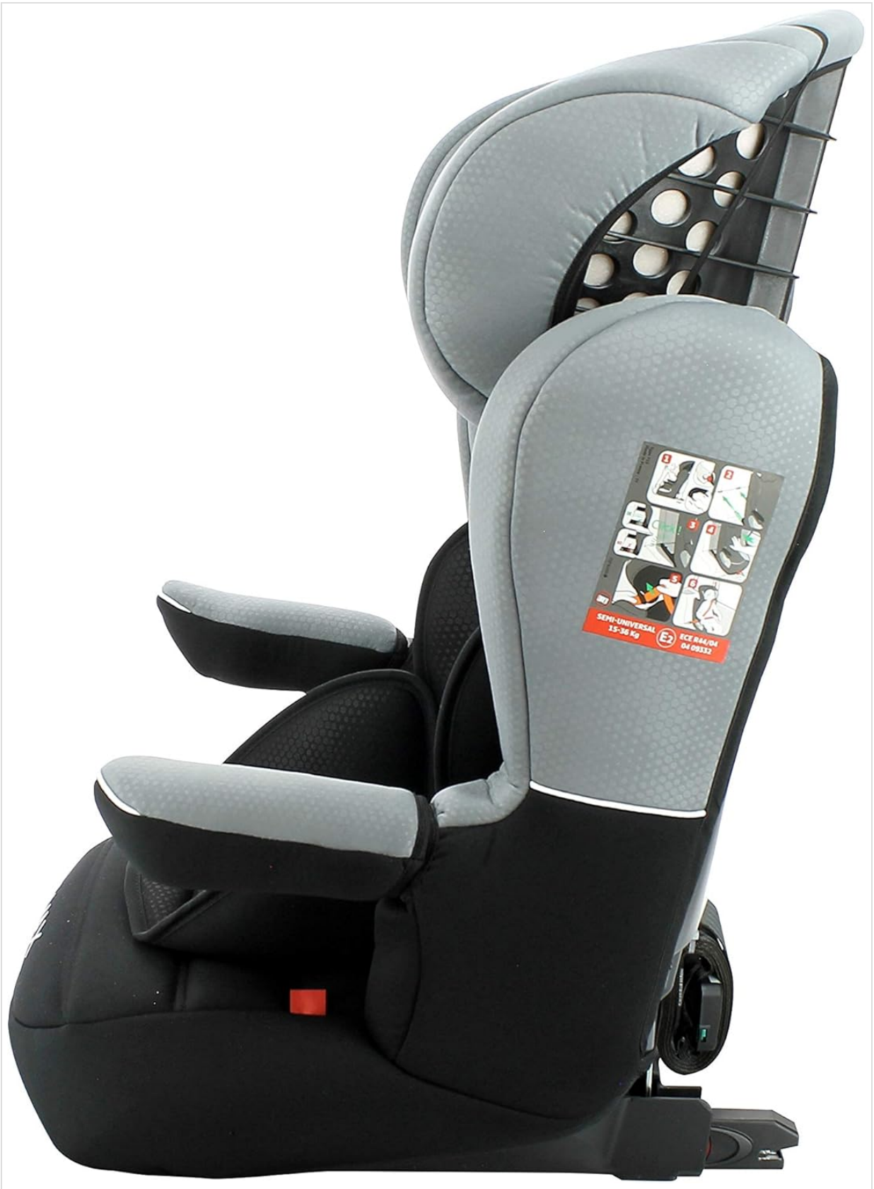
Figure 3.2: Side view of the car seat, highlighting the side protection and Isofix indicators.