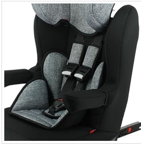
Figure 4.3: Close-up of the 5-point harness system.