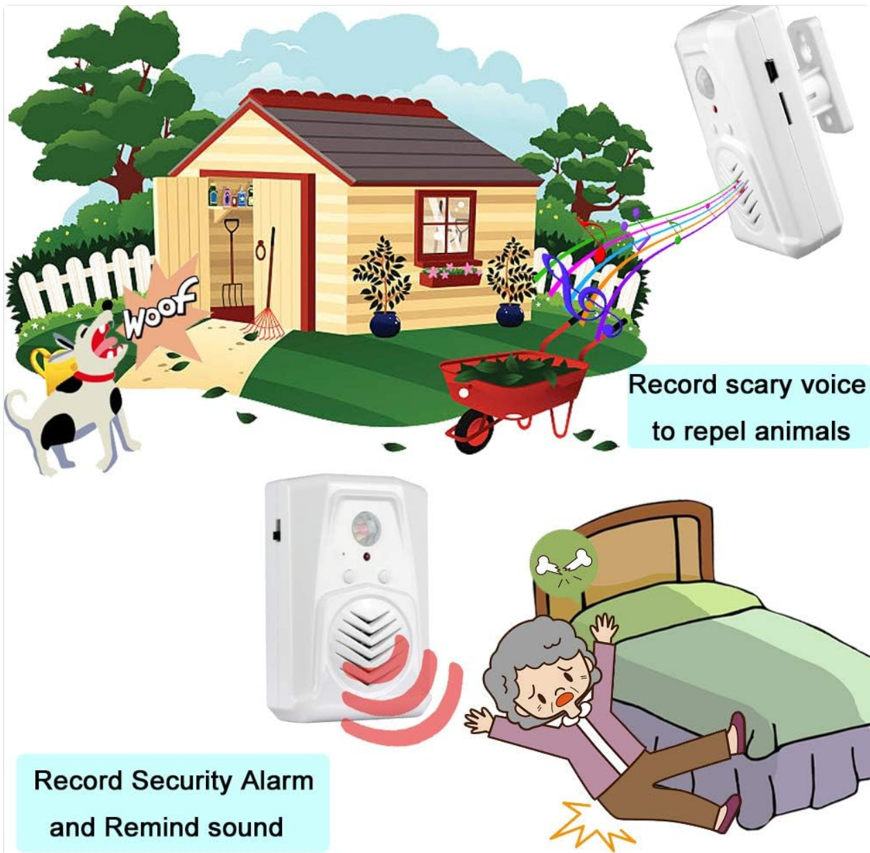
Figure 6.2: Examples of animal repelling and security reminder uses.