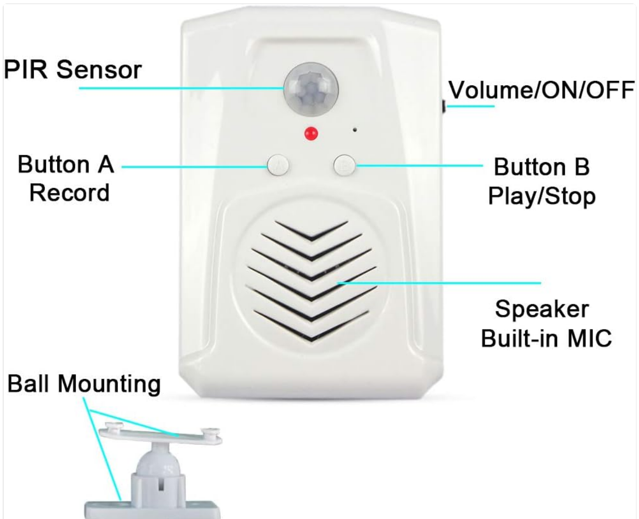
Figure 2.1: Front view of the Waytronic WT-14 with labeled components.