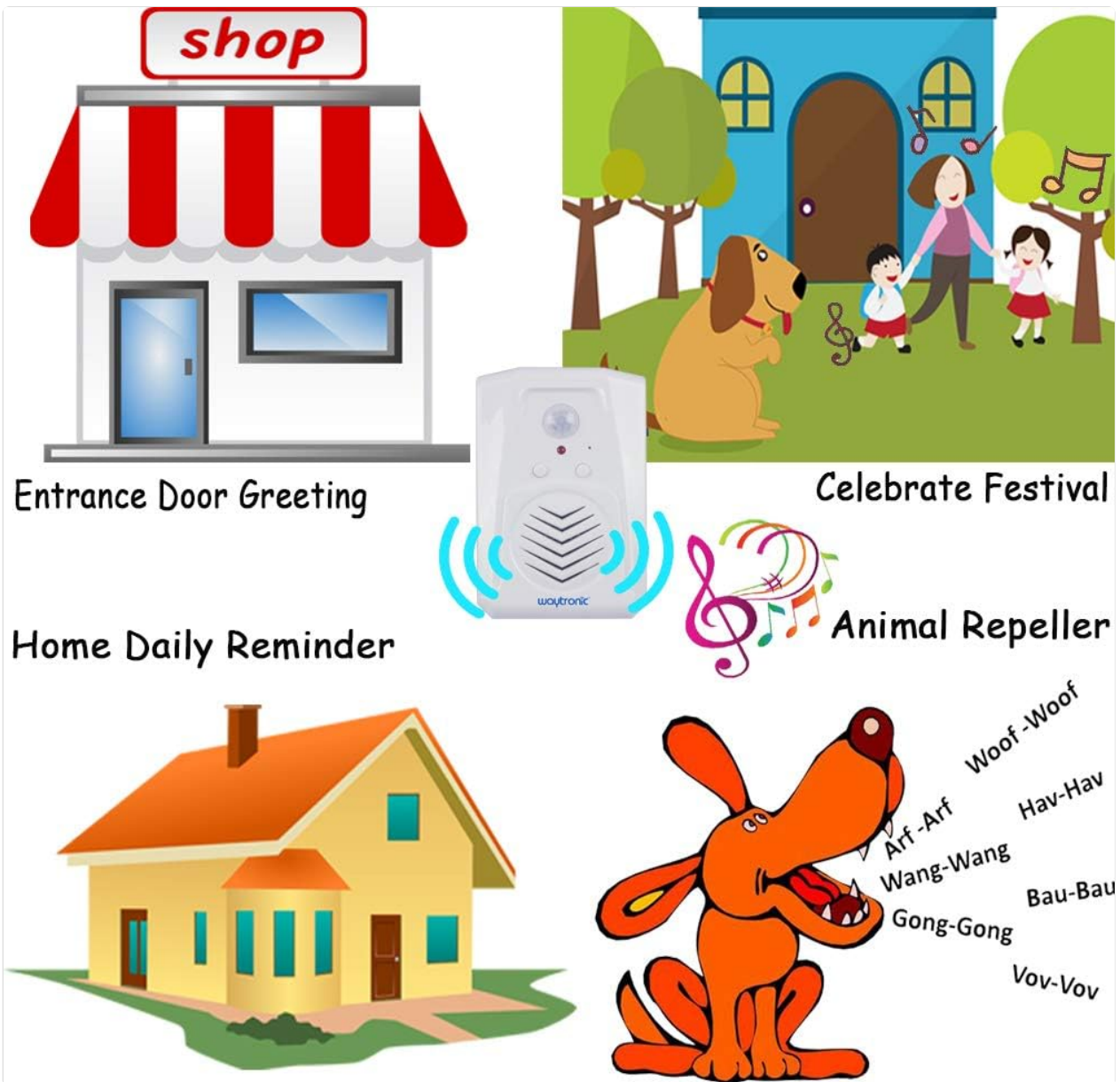
Figure 6.1: Common applications of the sound speaker.