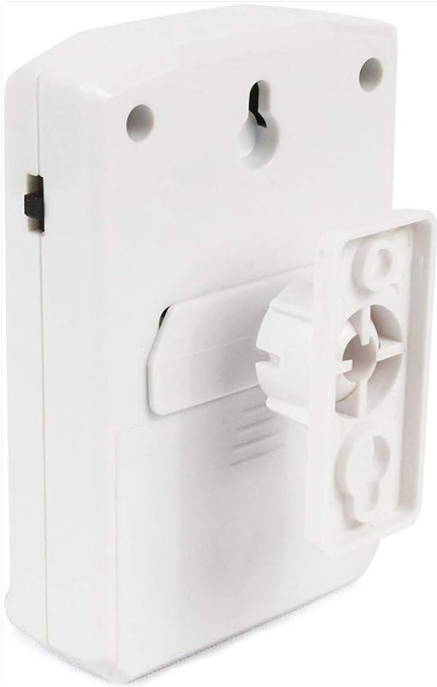
Figure 4.2: Side view showing USB power port and switch.