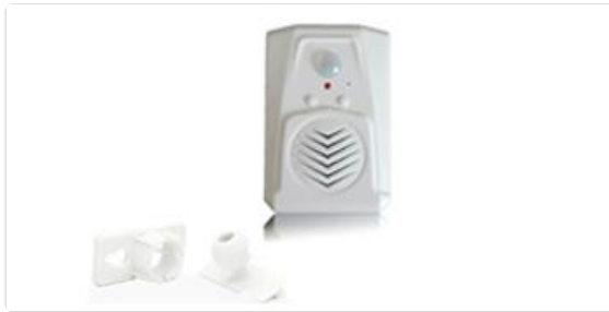
Figure 5.1: Audio file change methods (Button Recording only).