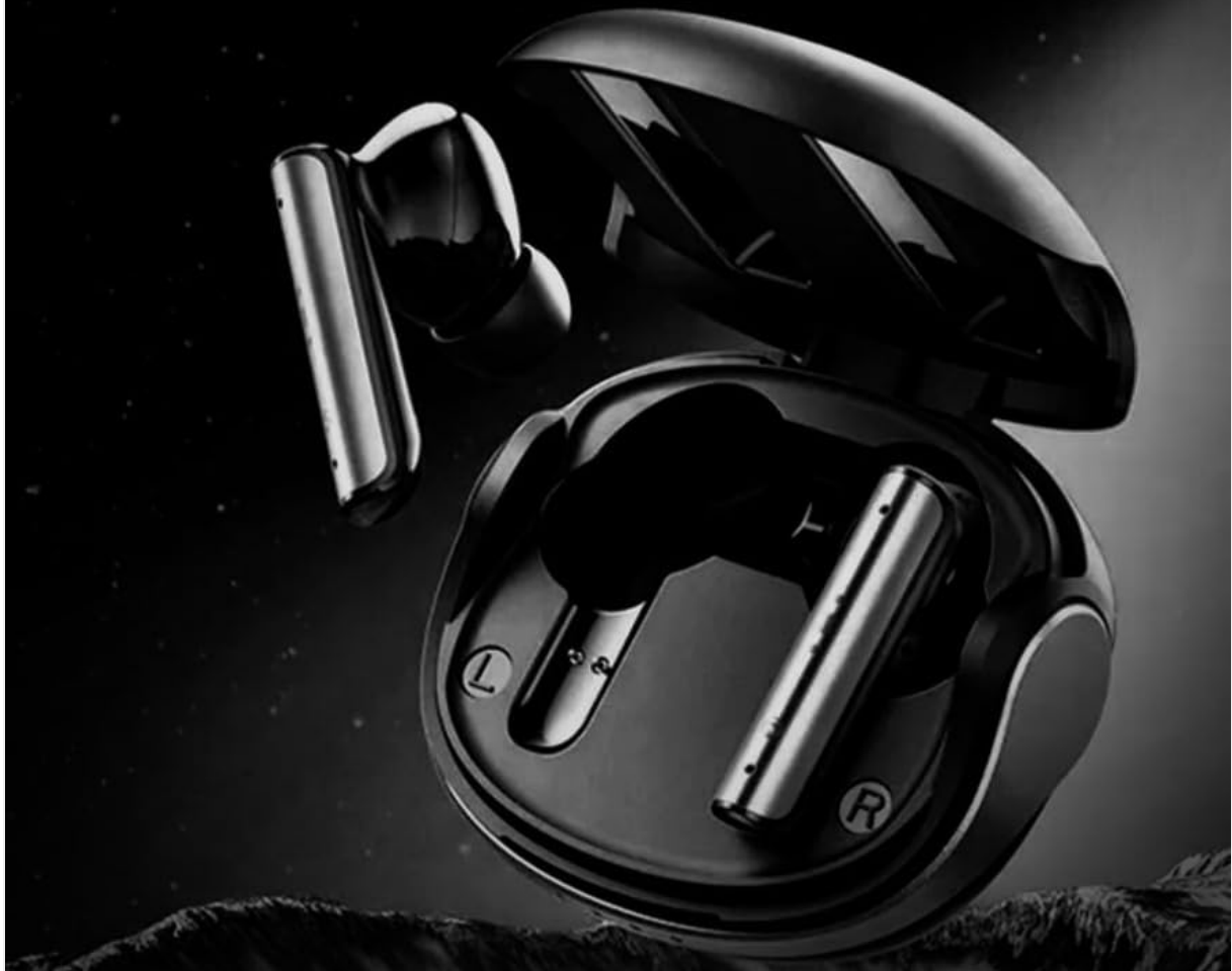
Image: The REMAX CozyPods W8N Bluetooth headphones resting inside their sleek black charging case, ready for use.