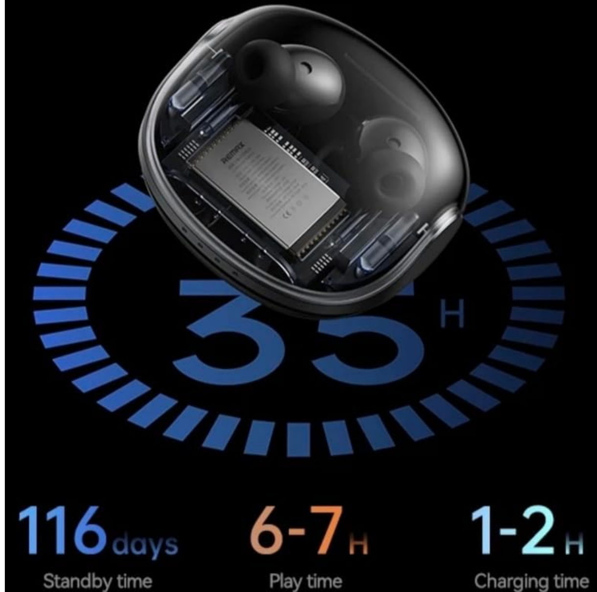
Image: An illustration detailing the battery performance of the CozyPods W8N, highlighting 35 hours of total battery life with the charging case, 116 days of standby time, 6-7 hours of continuous play time, and a 1-2 hour charging duration.

Long-lasting battery life for a whole day use Say goodbye to low battery anxiety