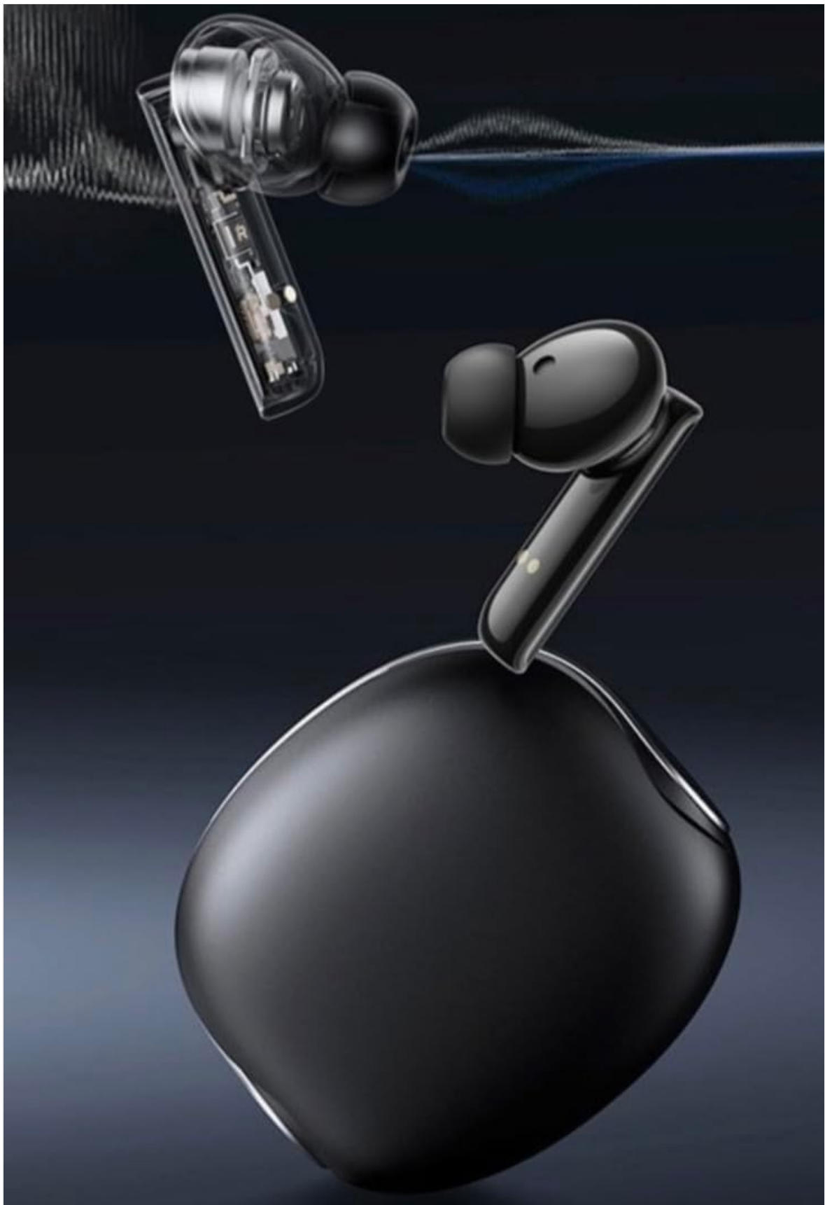
Image: A visual representation of the ANC-ENC technique in the CozyPods W8N, showing sound waves being actively cancelled to provide clear audio and calls.