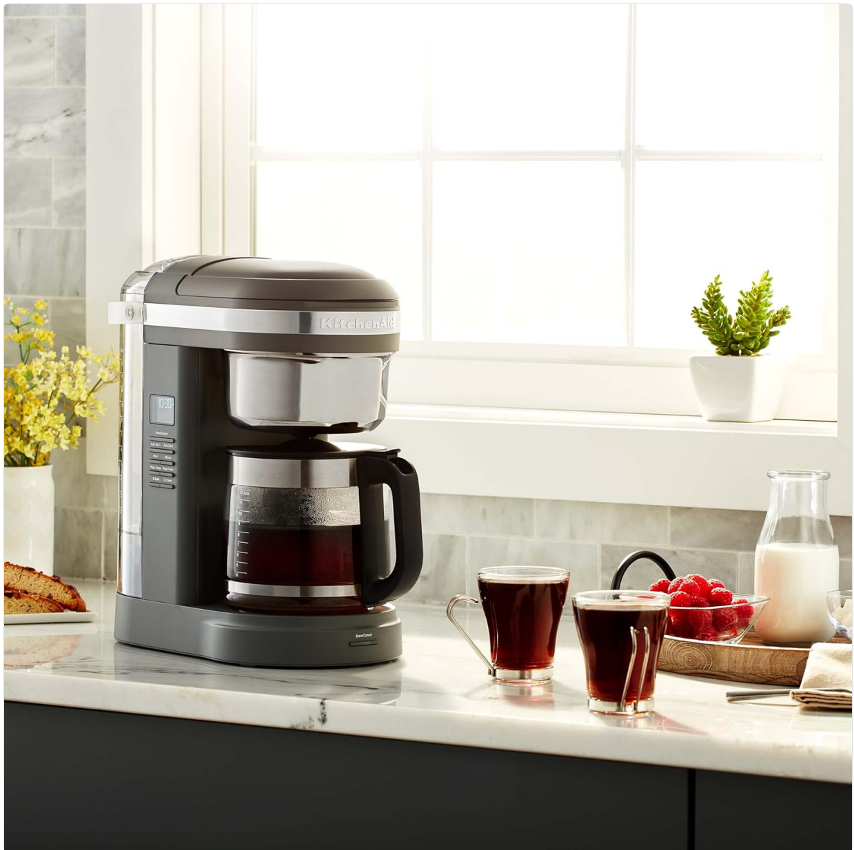
Image: The KitchenAid KCM1209 Drip Coffee Maker on a kitchen counter, with a full carafe of freshly brewed coffee.