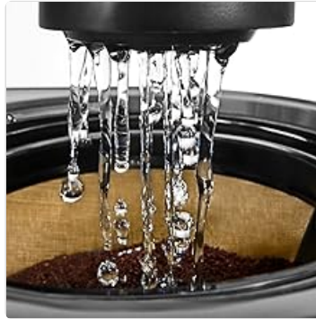
Image: Close-up of the coffee filter basket, showing the internal dosage marks for coffee grounds.