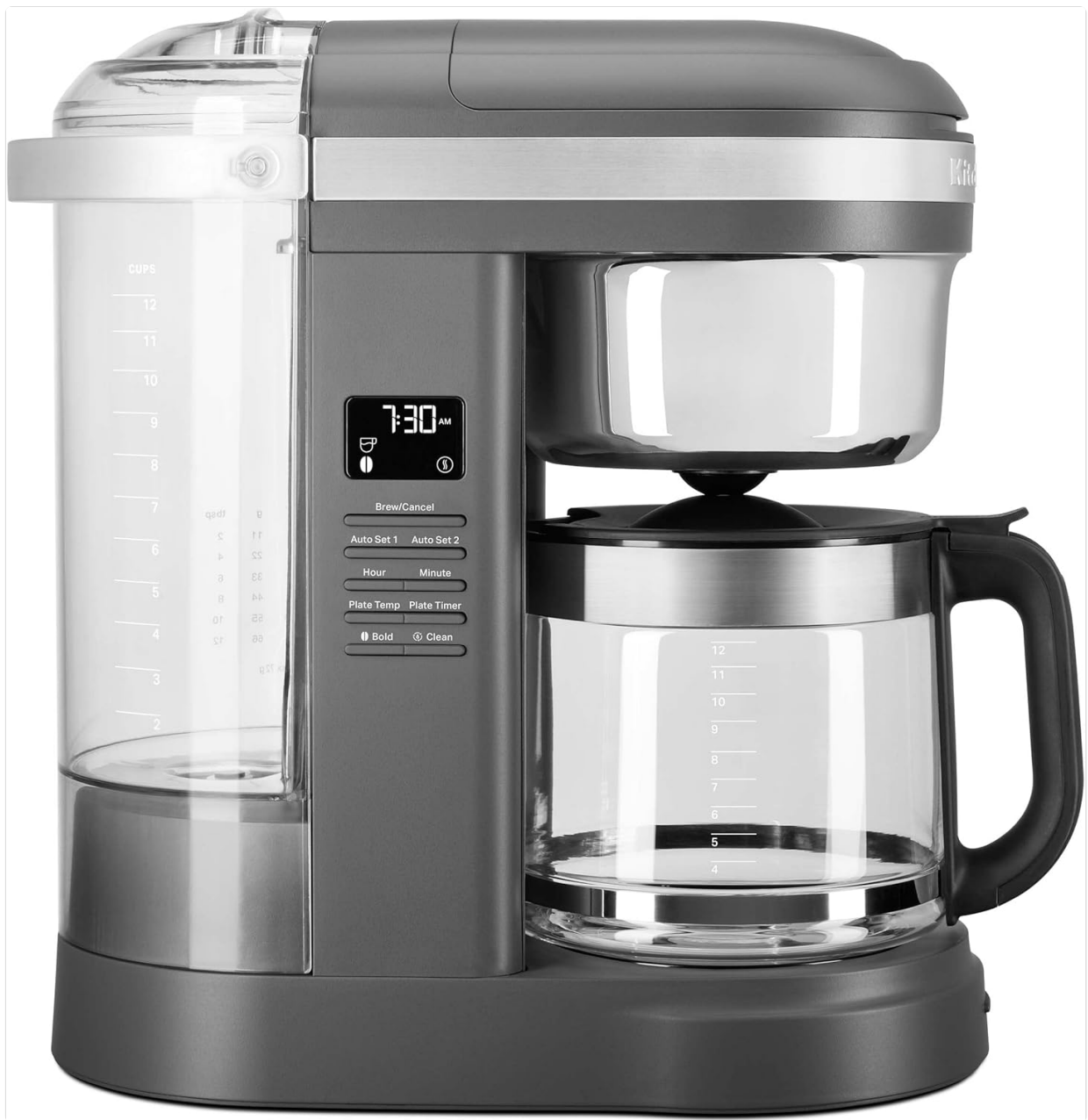
Image: Side view of the KitchenAid KCM1209 Drip Coffee Maker, showing the removable water tank and control panel.