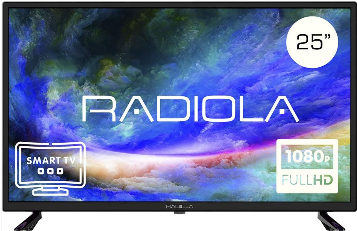
Figure 4.1: Front view of the Radiola 25-inch Full HD Smart TV. The image displays the screen with a colorful abstract background, the 'RADIOLA' brand logo prominently in the center, '25\"

Familiarize yourself with the television's components and connection ports.