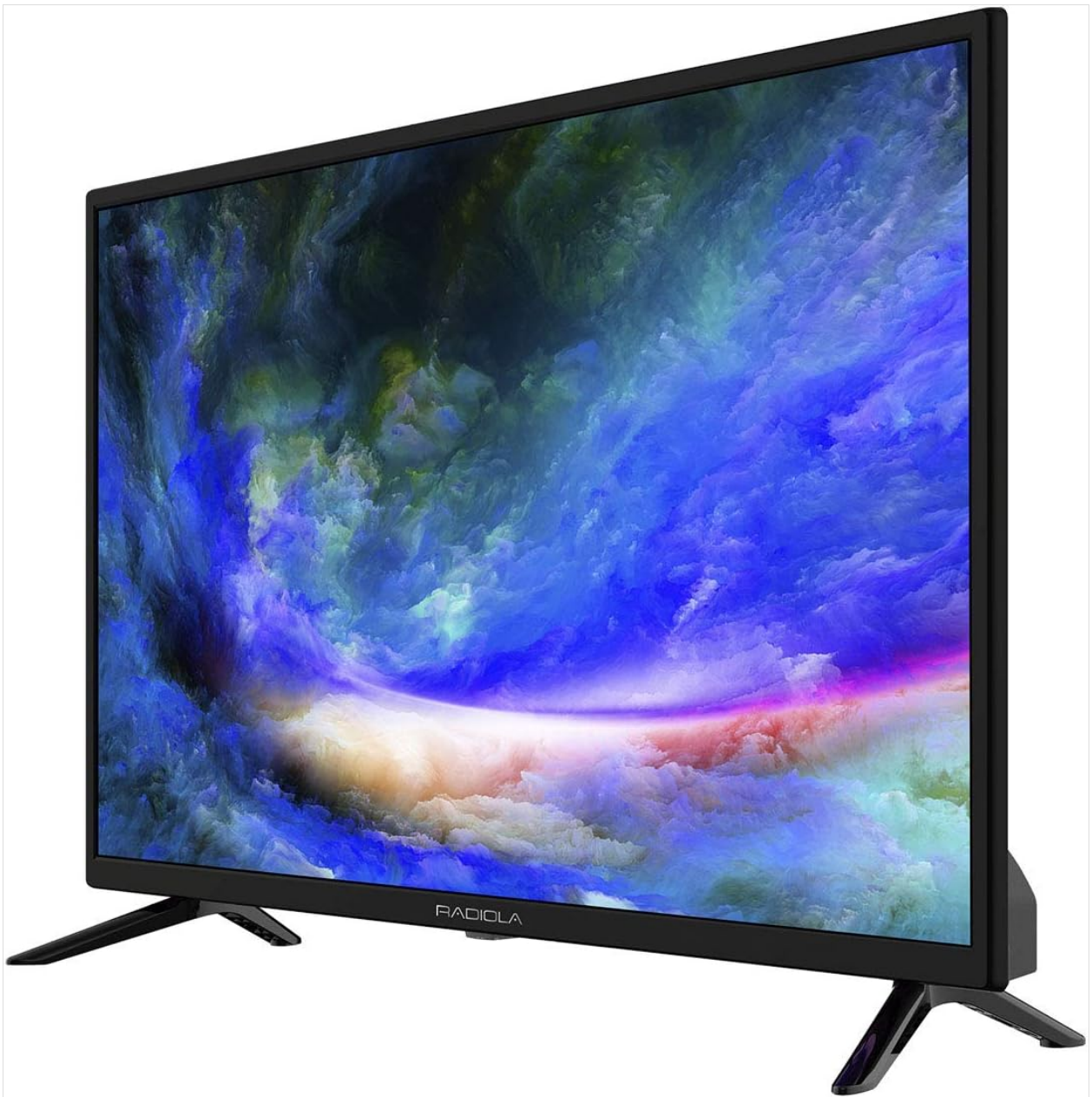
Figure 4.2: Angled side view of the Radiola 25-inch Full HD Smart TV, showing the slim profile and one of the two stand feet. The screen displays the same colorful abstract background.