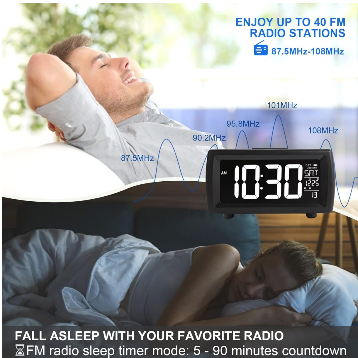
Image 3.4: The alarm clock displaying FM radio frequencies and indicating the sleep timer function, allowing users to fall asleep to their favorite radio station.