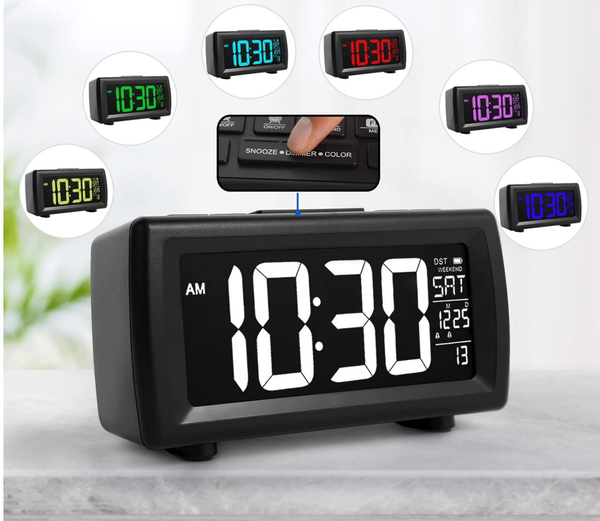
Image 3.1: The clock display showing various color options for the time, date, and day of the week.

More choices for people who are sensitive to a certain digit color