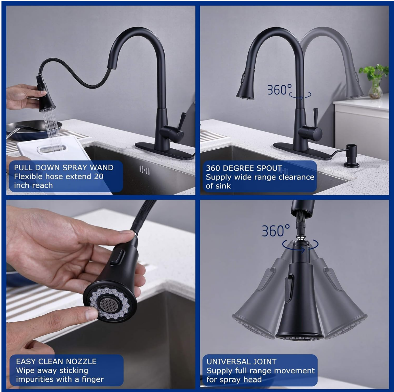
Image: A collage demonstrating key operational features: the pull-down spray wand with its flexible hose, the 360-degree rotatable spout, the easy-clean nozzle with rubber spray holes, and the universal joint for full range movement of the spray head.

The faucet features a flexible pull-down spray wand with a 20-inch reach, allowing for extended maneuverability around your sink. The high-arc spout can swivel 360 degrees, providing ample clearance for large pots and pans and covering multiple sink basins.