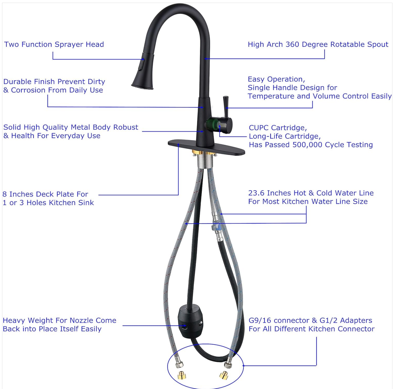
Image: Exploded diagram illustrating the various components of the RKF Pull Down Kitchen Faucet, including the sprayer head, high arch spout, single handle, main body, deck plate, hot and cold water lines, and connectors.