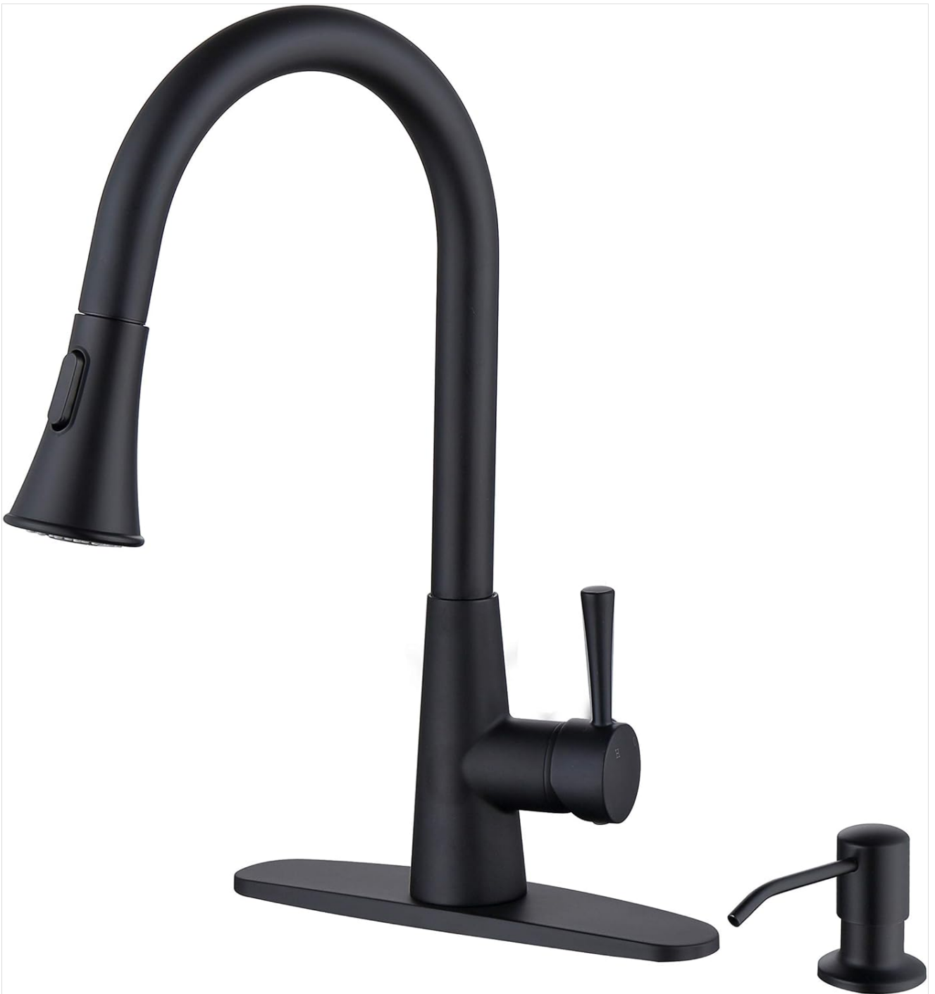
Image: RKF Pull Down Kitchen Faucet Model 198003 in Matte Black finish, featuring a high-arc design, pull-down sprayer, and a single handle. A matching soap dispenser is also shown.