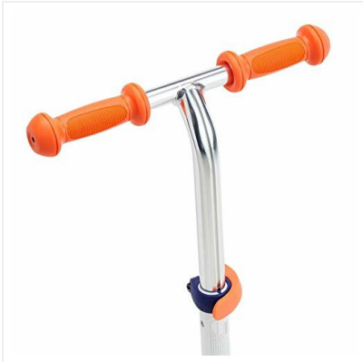
Figure 3.4: Detail of the adjustable handlebar with ergonomic grips, designed for comfortable handling.