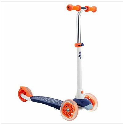
Figure 3.1: Overall view of the OXELO B1 500 Kids' Scooter, showcasing its blue and red color scheme and three-wheel design.