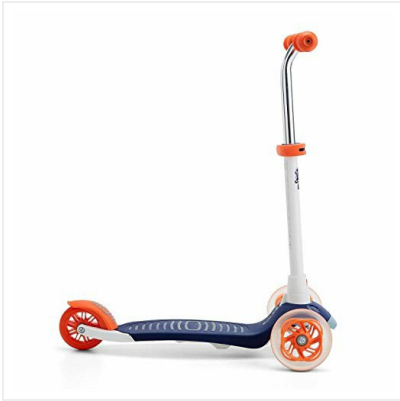
Figure 3.2: Side profile of the scooter, highlighting the low deck for easy foot placement and the rear wheel.