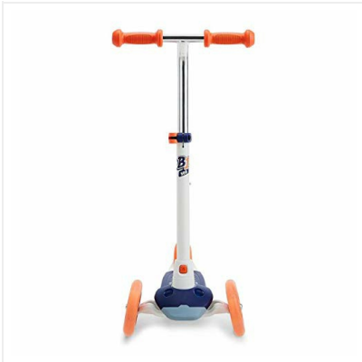
Figure 3.3: Front view of the scooter, showing the two front wheels and the handlebar.