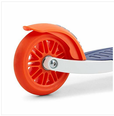
Figure 3.5: View of the rear wheel and the integrated foot brake mechanism.