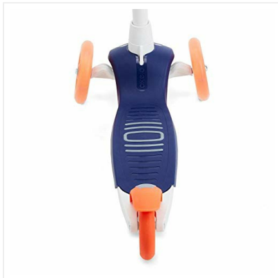
Figure 3.6: Top-down perspective of the scooter's deck, showing the wide foot platform.