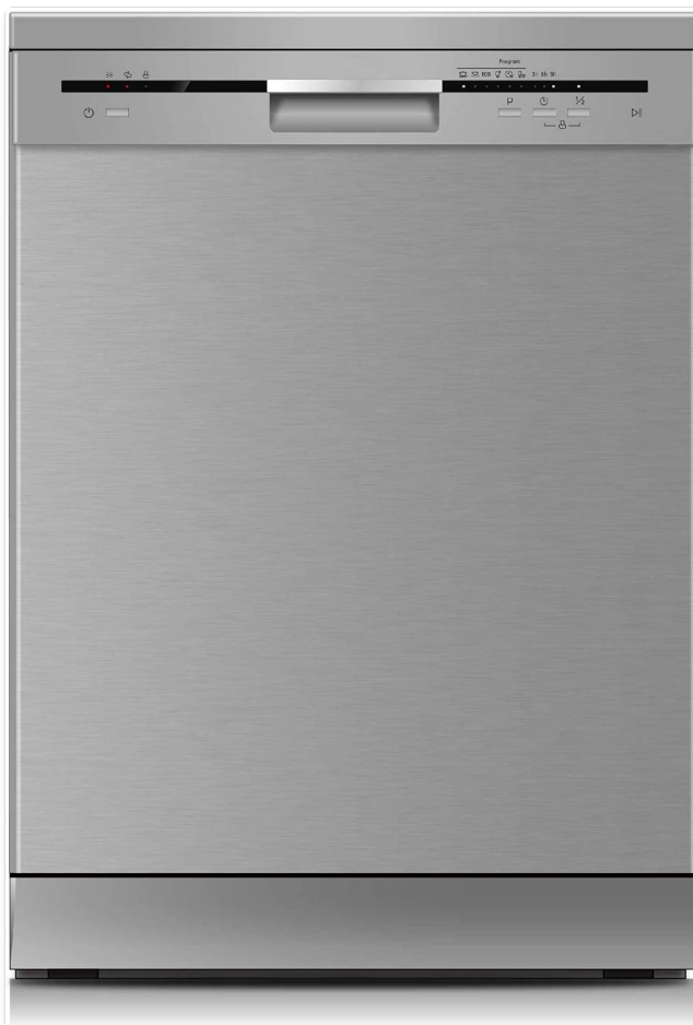
Front view of the Sharp QW-MB612-SS3 Free Standing Dishwasher, showcasing its sleek steel finish and integrated control panel.

Thank you for choosing the Sharp QW-MB612-SS3 Free Standing Dishwasher. This appliance is designed to provide efficient and convenient dish cleaning for your household. With its 12 place settings and 6 versatile programs, it offers flexibility to handle various types of loads. Please read this manual carefully before using your dishwasher to ensure safe and optimal operation, and keep it for future reference.