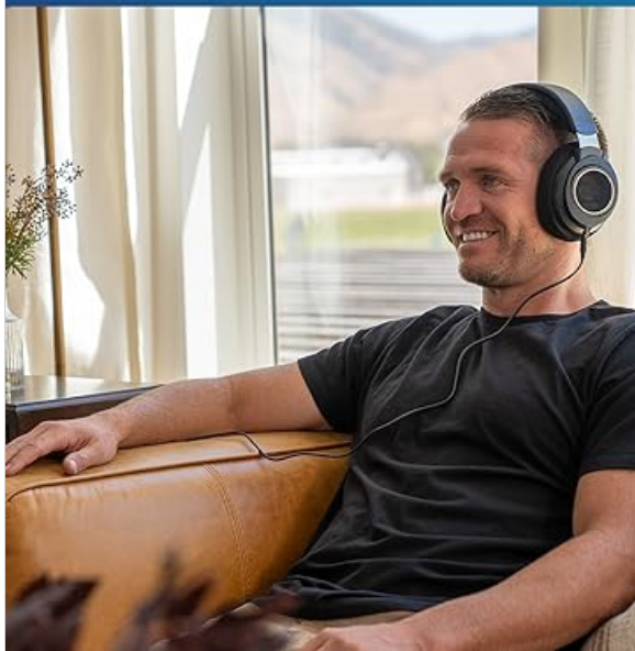
Image: A user enjoying music with Philips SHP6000 Wired Headphones, demonstrating superior comfort during use.