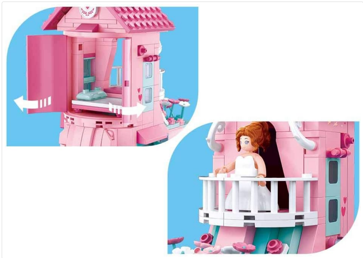
Figure 3: Detail of the wedding room's interior, highlighting a movable door and a figure on a balcony, demonstrating interactive features.