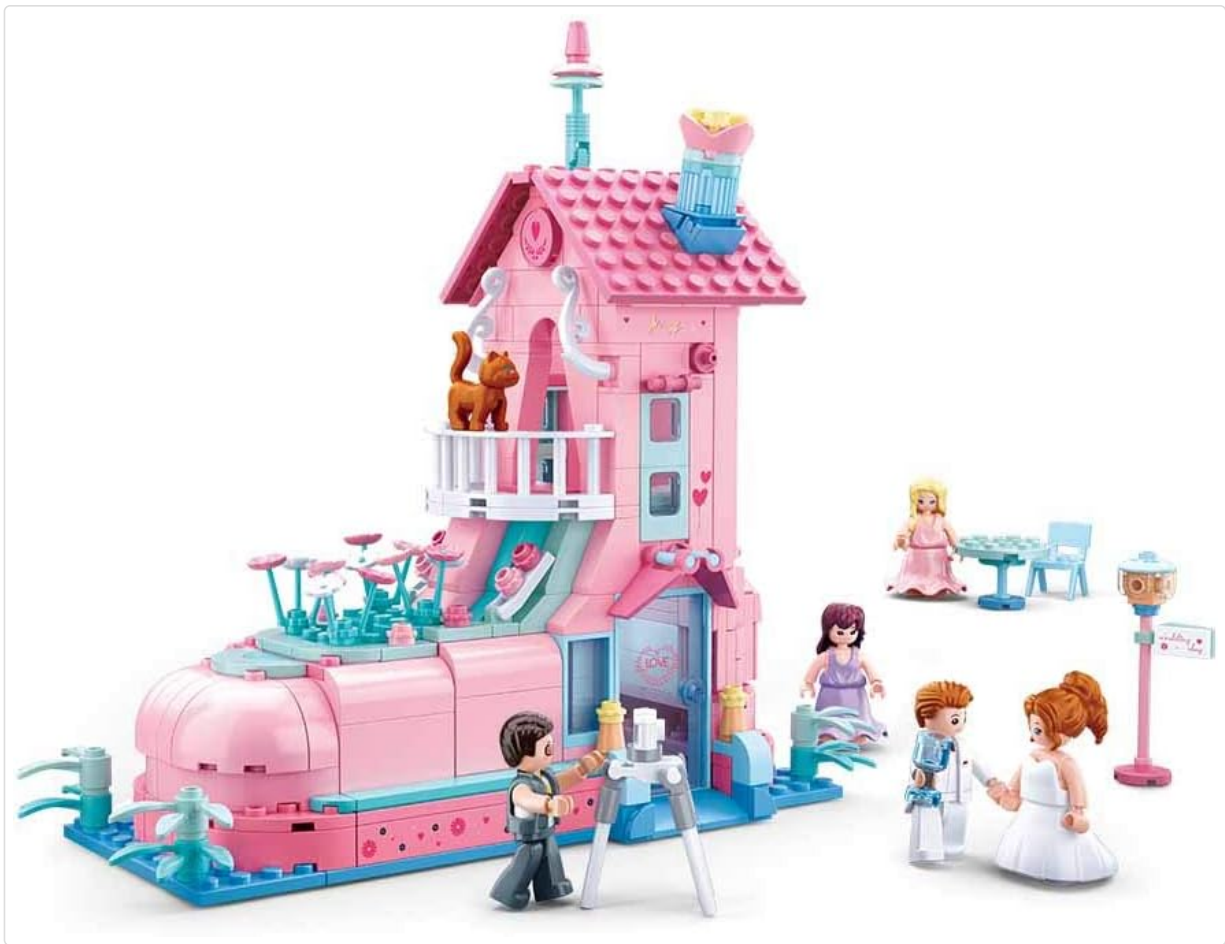
Figure 2: The completed Sluban Girls Dreams Wedding Room set, showcasing its detailed design and included figures.