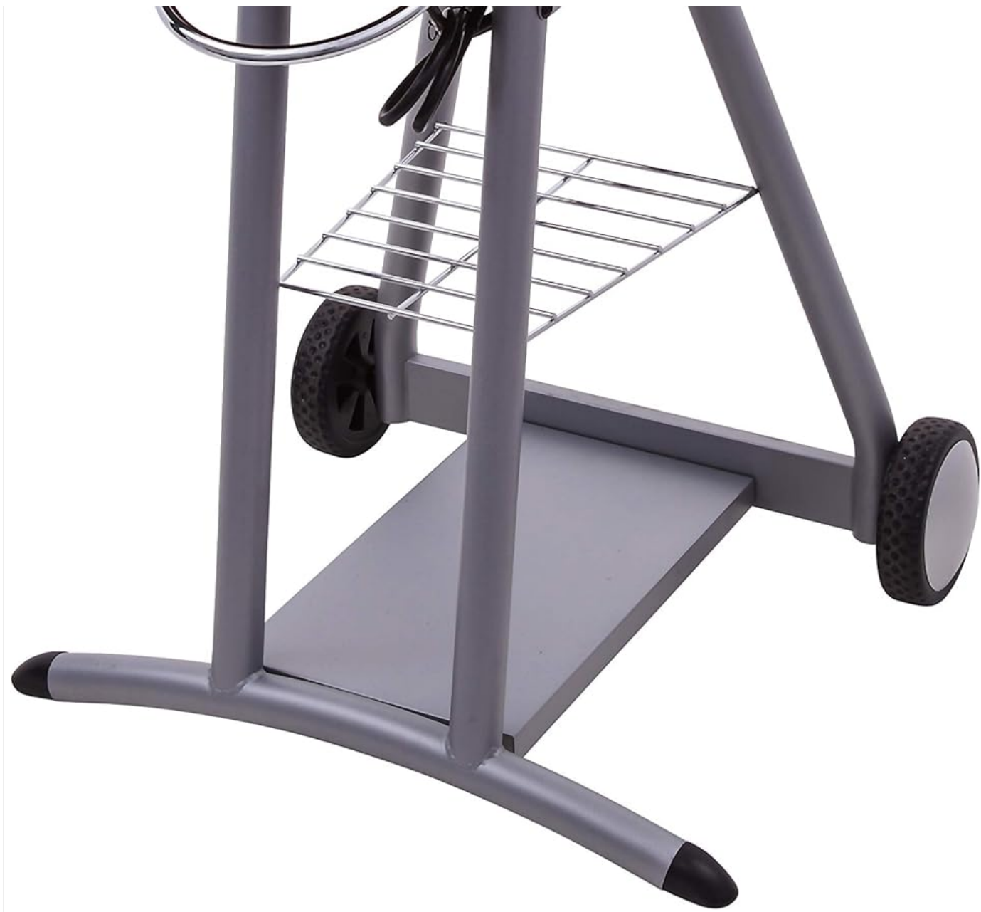
Figure 1: Char-Broil Patio Bistro TRU-Infrared Electric Grill (Red)