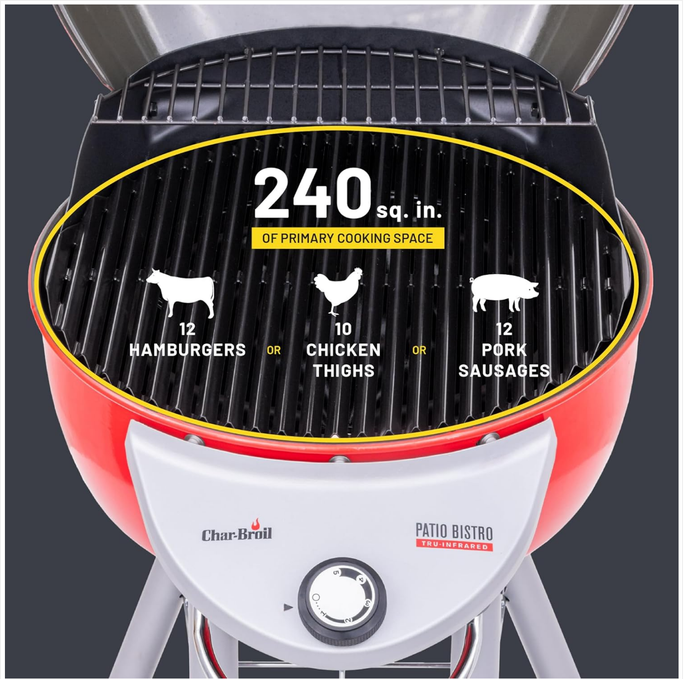
Figure 8: Grill in Operation