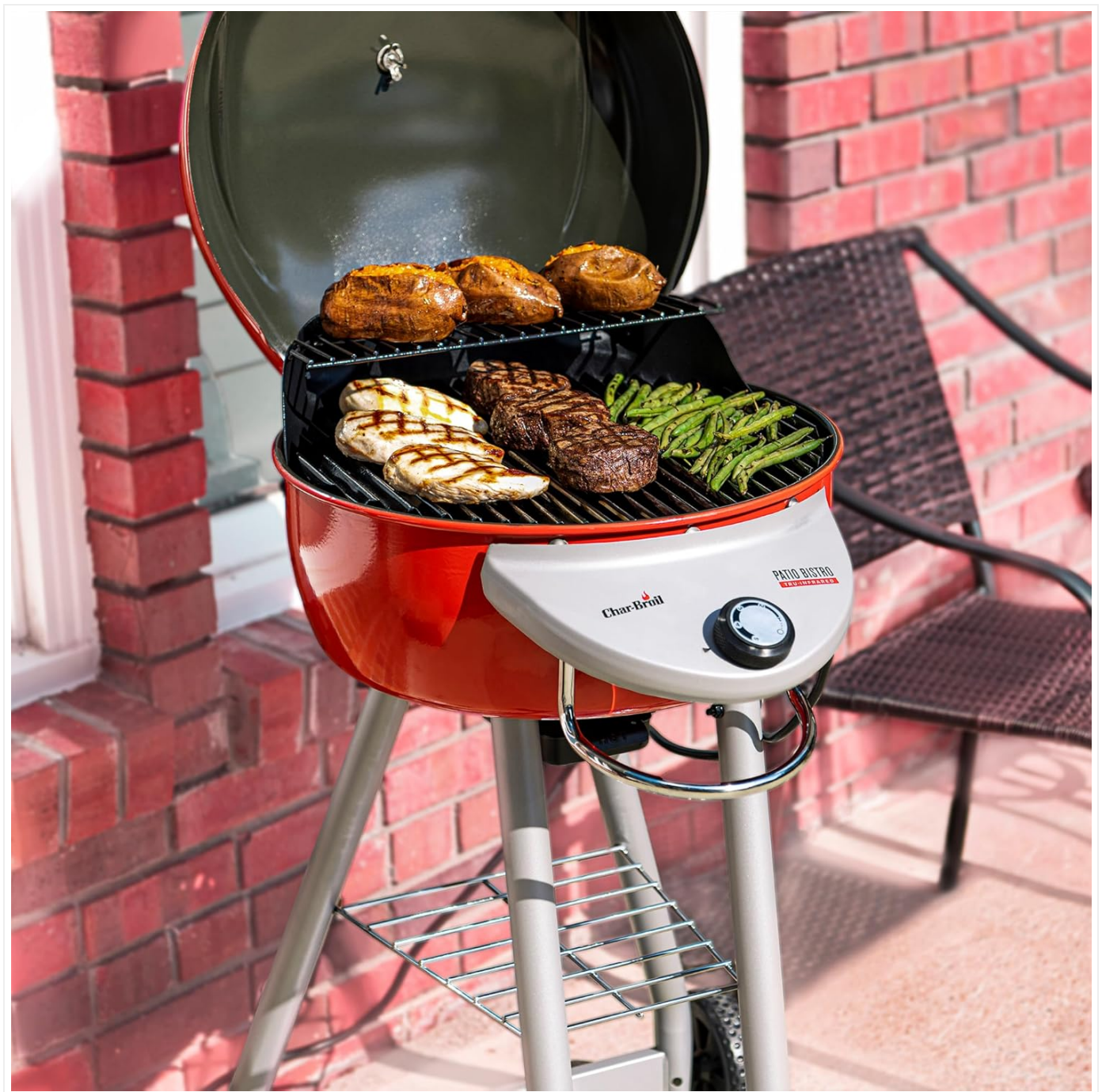
Figure 4: Cooking Area Capacity (240 sq. in. primary cooking space)