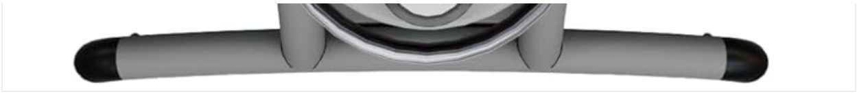
Figure 6: Front View of Assembled Grill