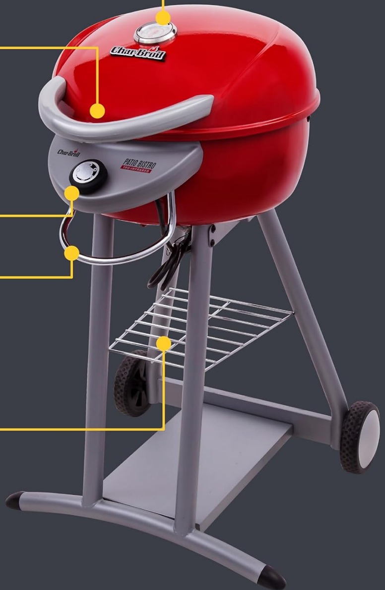
Figure 7: Control Knob for Temperature Adjustment