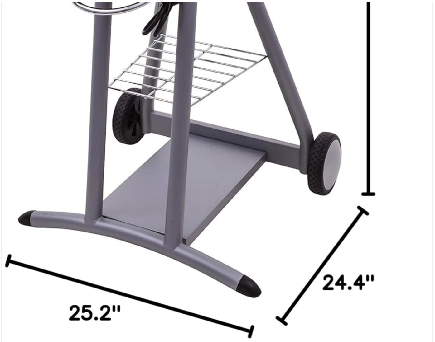
Figure 11: Product Dimensions