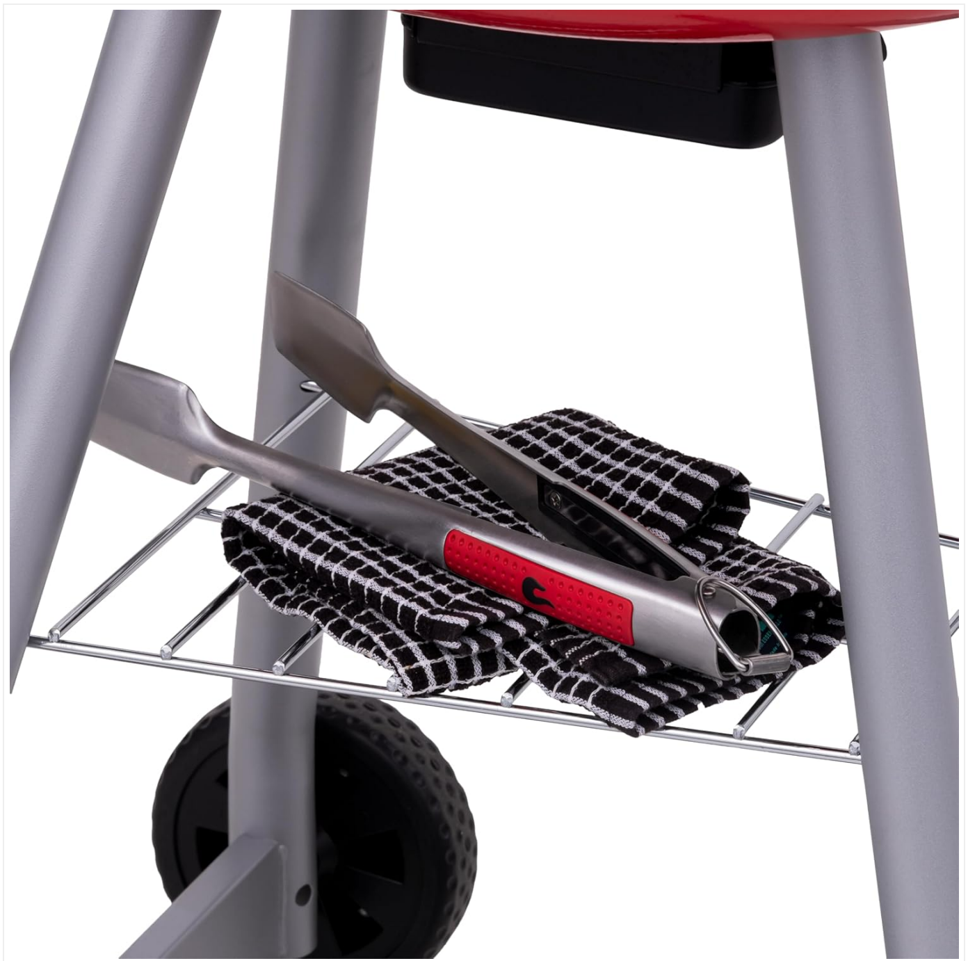
Figure 3: Key Product Features