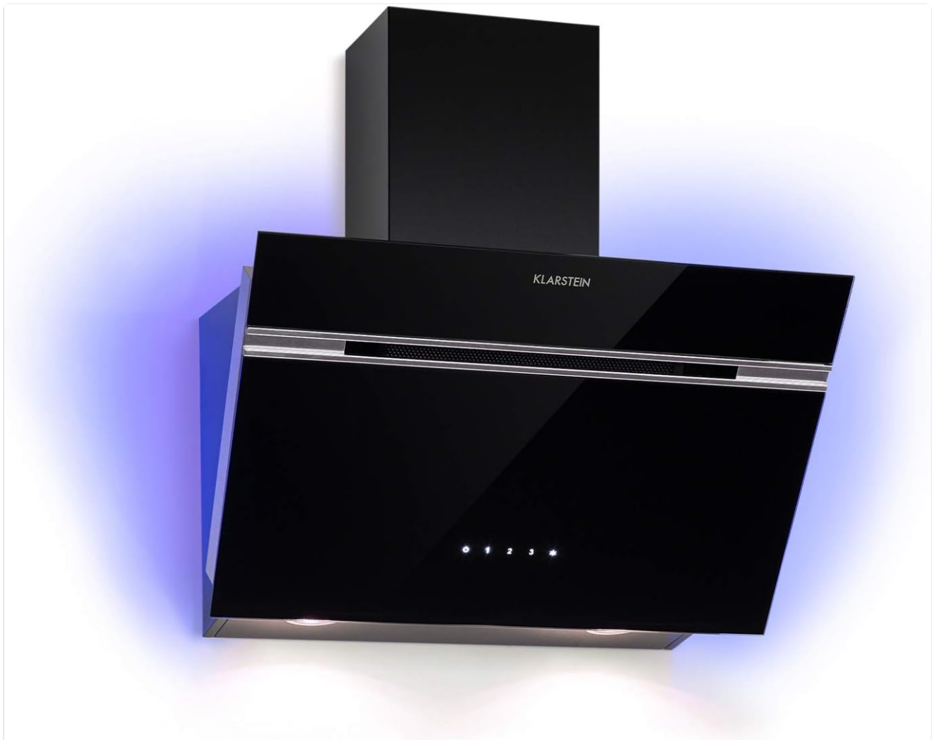
Image 1.1: The Klarstein Alina Hood, showcasing its sleek black design and illuminated with blue ambient lighting.

The Klarstein Alina Hood is a modern and efficient wall-mounted extractor hood designed to enhance your kitchen environment. Featuring a sleek glass front, touch controls, and integrated LED lighting with customizable RGB ambient light, it effectively removes cooking odors and steam while adding a stylish touch to your kitchen. This hood operates with a maximum extraction capacity of 600 m 3 /h and can be used in both extraction and recirculation modes.