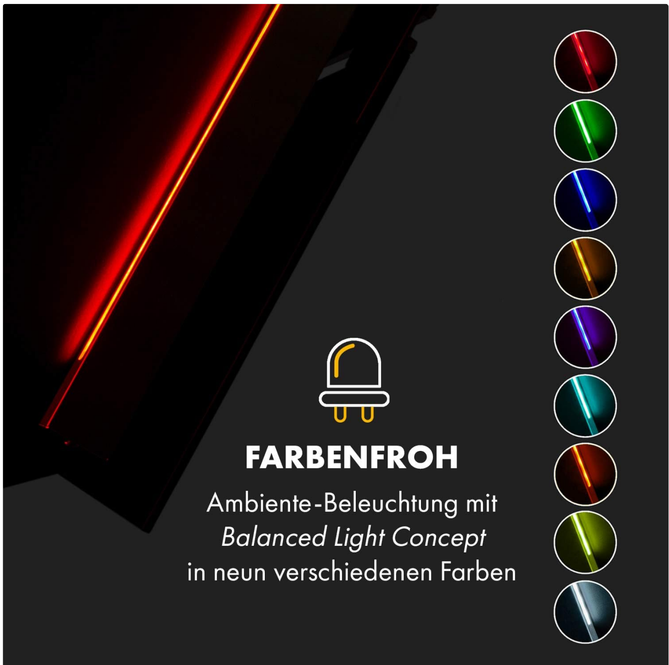
Image 5.3: A detailed view of the hood's side, highlighting the customizable RGB ambient lighting feature.