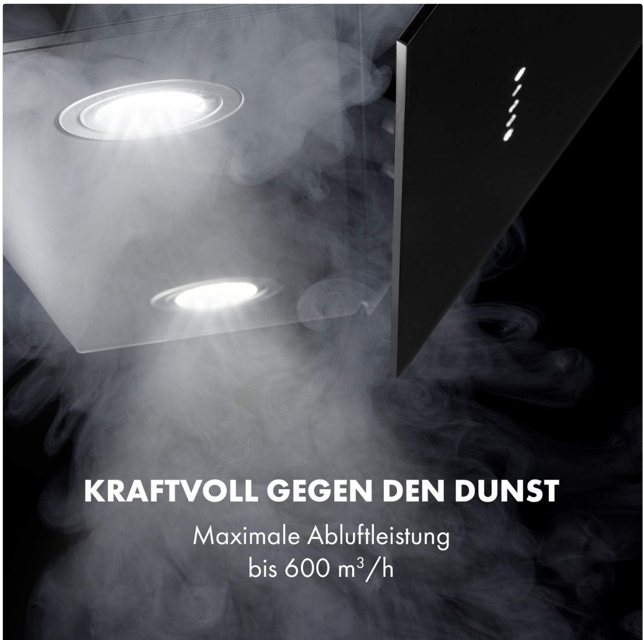
Image 5.2: The hood in action, demonstrating its powerful extraction capability against cooking steam.