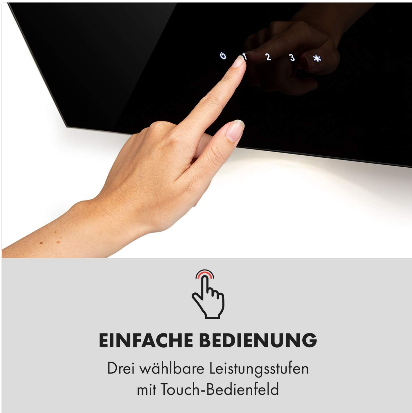
Image 5.1: Detail of the touch control panel, showing the power, speed, and light controls.

The Klarstein Alina Hood features a user-friendly touch control panel for easy operation.