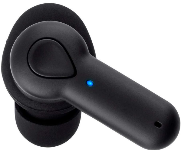
Image: A single black Monoprice TWE-04 TrueWireless Earphone is displayed, featuring a prominent blue LED indicator light on its stem, indicating power or connection status. The earbud's design, including the ear tip and control button, is visible.