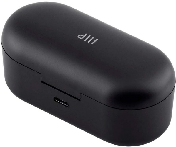
Image: The black, oval-shaped charging case for the Monoprice TWE-04 TrueWireless Earphones is shown closed. The case has a matte finish and features a subtle "IIP" logo on the lid and a USB charging port on the front.