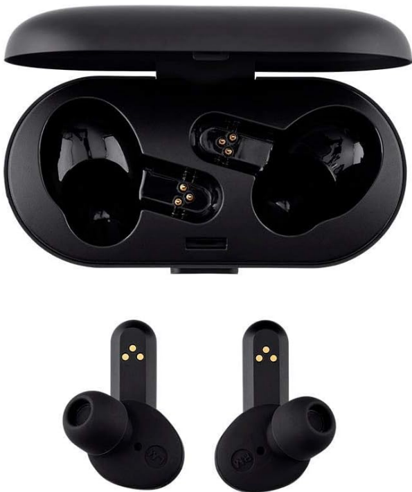
Image: The two black Monoprice TWE-04 TrueWireless Earphones are shown below their open charging case. The case is empty, revealing the charging contacts, while the earbuds display their gold charging pins and 'L' and 'R' markings.