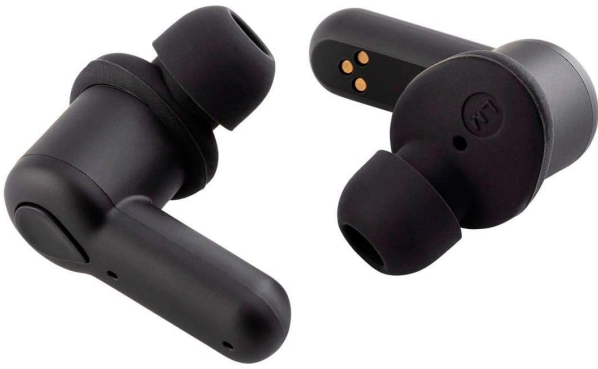
Image: A close-up perspective of the two black Monoprice TWE-04 TrueWireless Earphones. The image highlights the ergonomic shape, the silicone ear tips, and the charging contacts on the stem of each earbud.