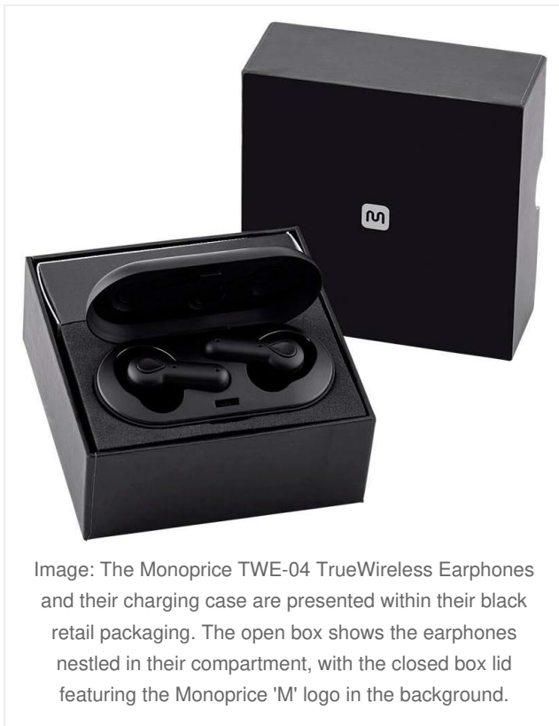
Image: The Monoprice TWE-04 TrueWireless Earphones and their charging case are presented within their black retail packaging. The open box shows the earphones nestled in their compartment, with the closed box lid featuring the Monoprice 'M' logo in the background.