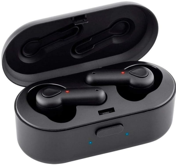
Image: The Monoprice TWE-04 TrueWireless Earphones resting inside their open charging case. The earbuds are black with red indicator lights, and the case is also black with blue indicator lights at the front.