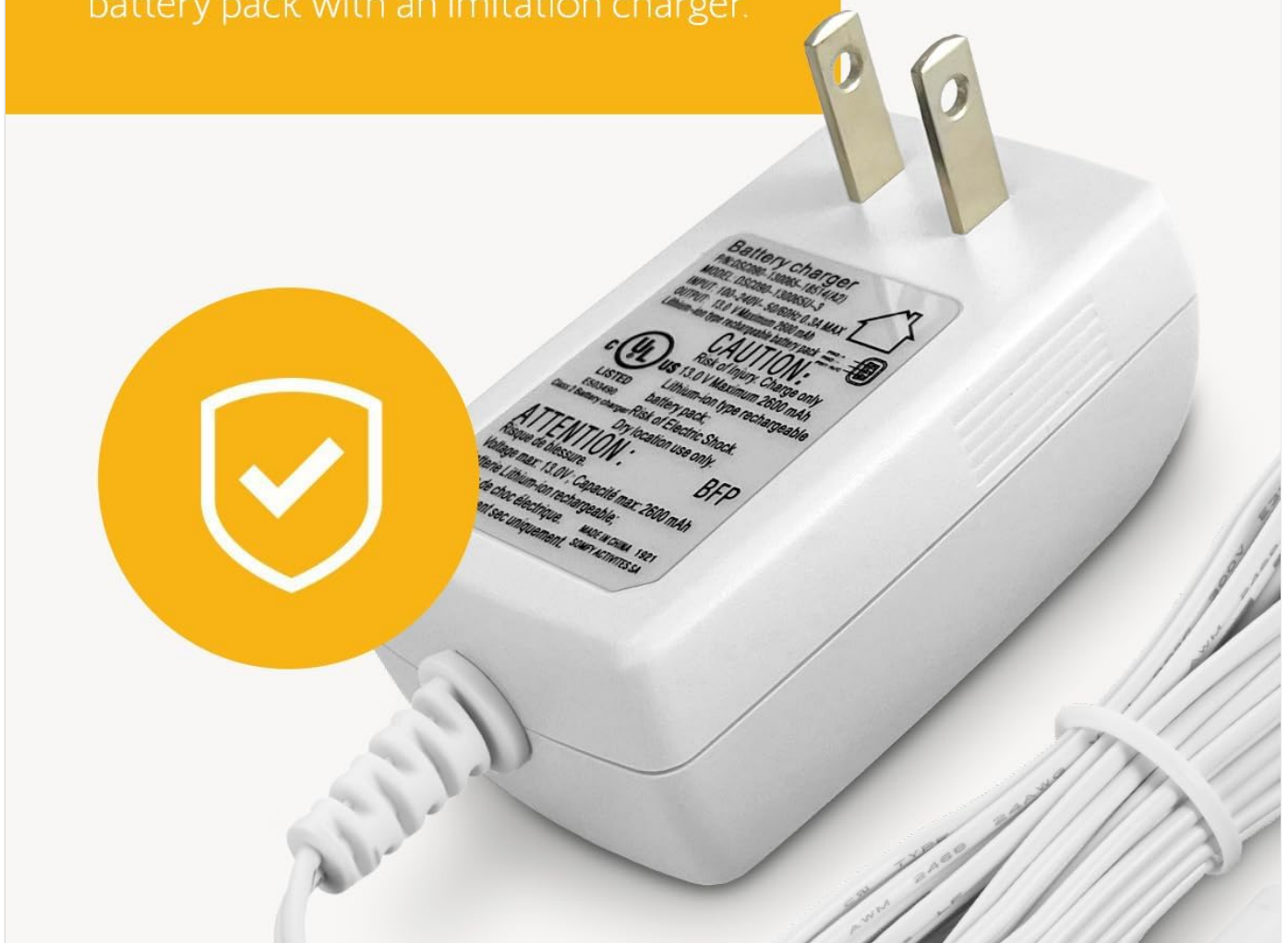
Image: A close-up of the Somfy charger's label, highlighting safety certifications and the importance of using a genuine product to prevent damage to the battery pack.

Don't risk damaging your Somfy battery pack with an imitation charger.