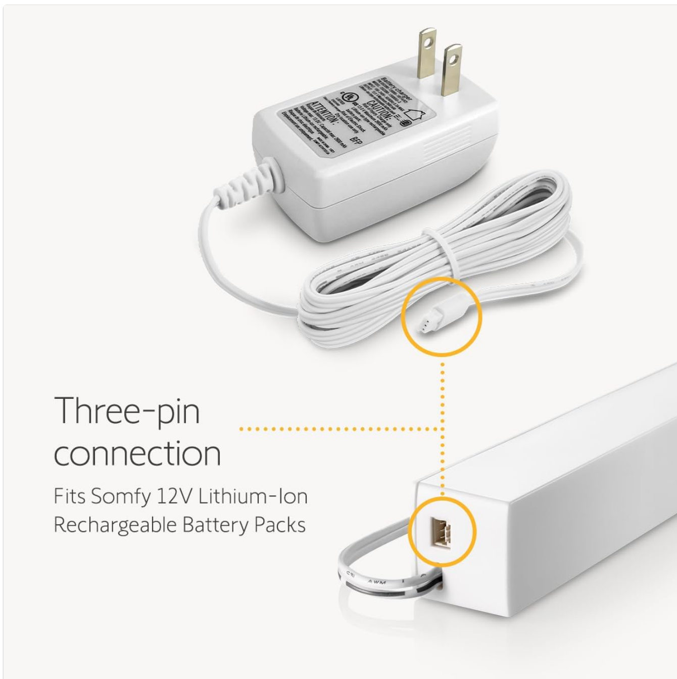
Image: A detailed view illustrating the 3-pin connector of the charger aligning with and connecting to the port on a Somfy 12V Lithium-Ion Rechargeable Battery Pack.