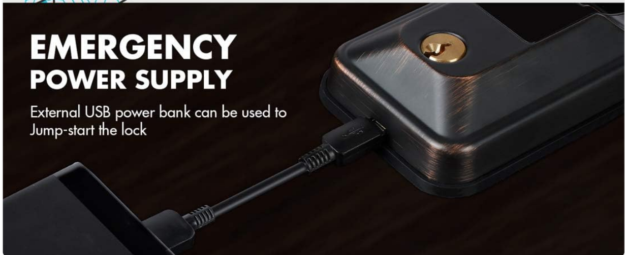
Image: A diagram illustrating the placement of 4 AA batteries within the lock's interior unit and the emergency USB power port.

External USB power bank can be used to Jump-start the lock