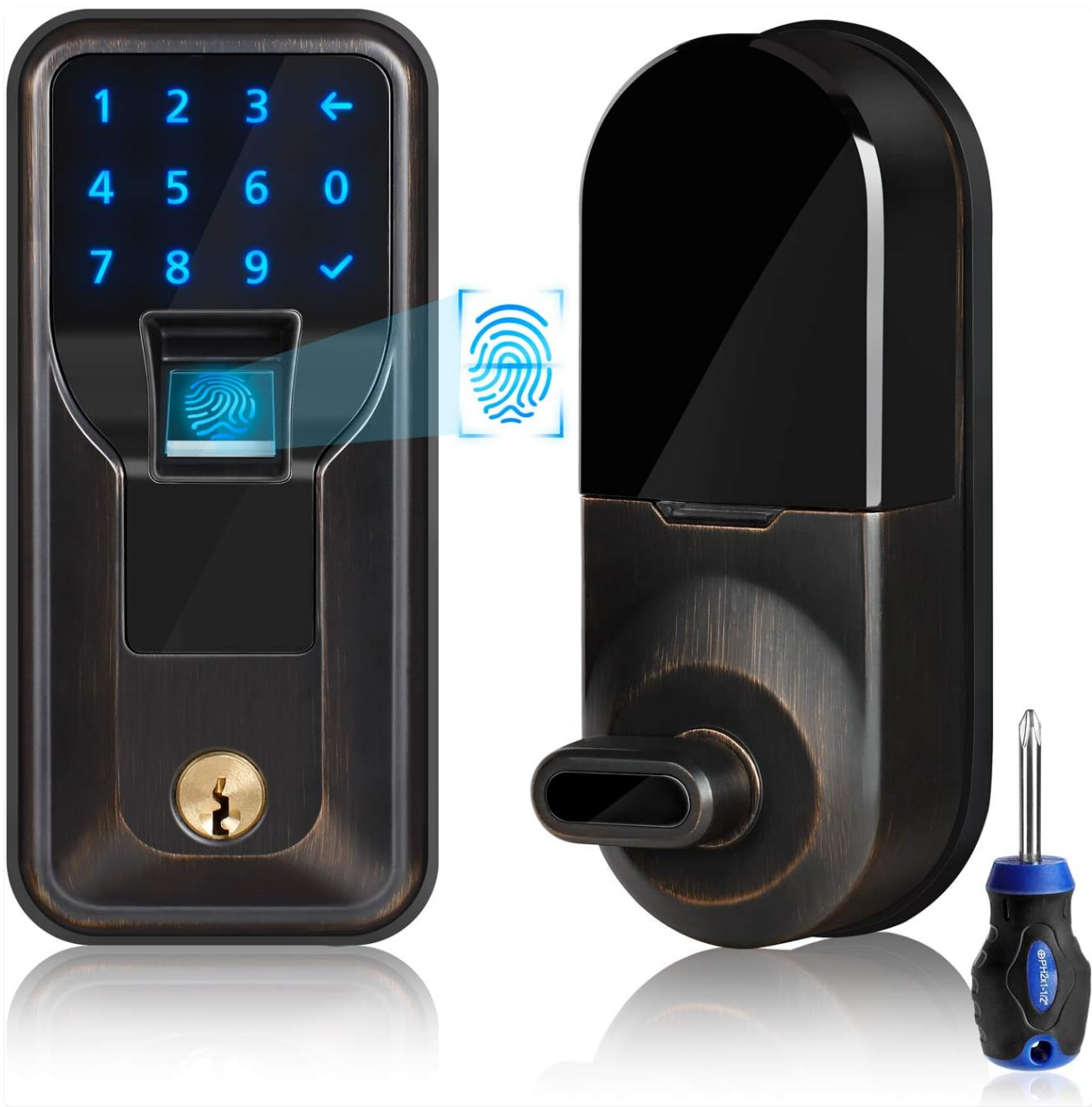
Image: The iMagic Electronic Fingerprint Keypad Deadbolt Lock, showing the exterior unit with fingerprint sensor and keypad, the interior unit, and a screwdriver for installation.