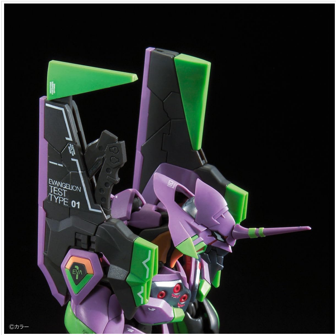
Figure 7: Detail of the upper body and head assembly.