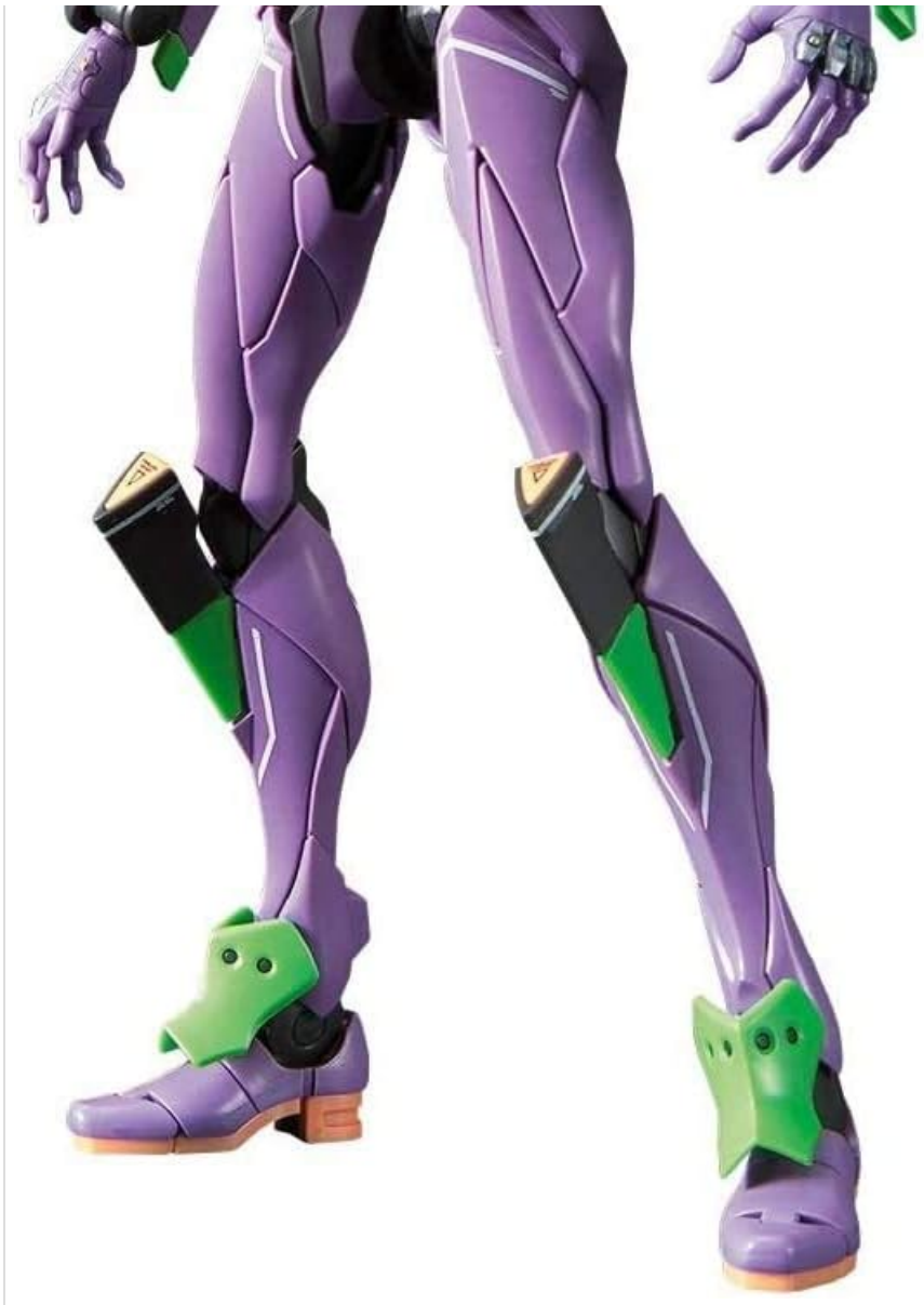
Figure 1: Fully assembled Evangelion Unit-01 model kit.