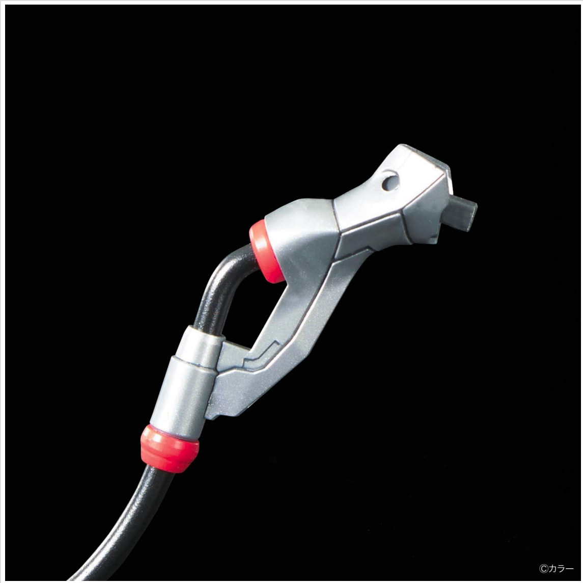
Figure 13: Evangelion Unit-01 connected to its Umbilical Cable.