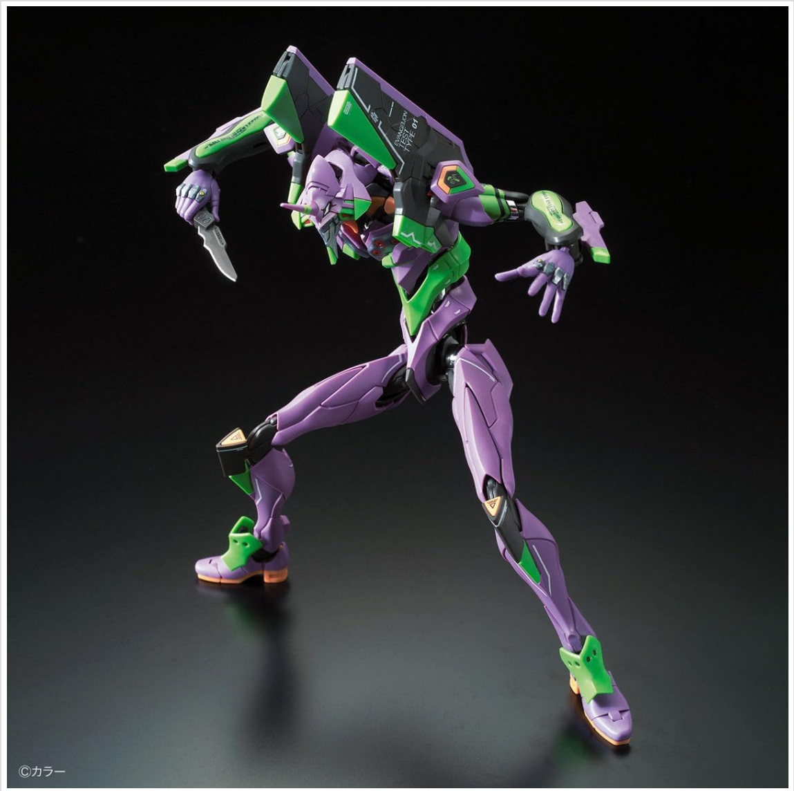
Figure 12: Evangelion Unit-01 equipped with Pallet Rifle and Progressive Knife.