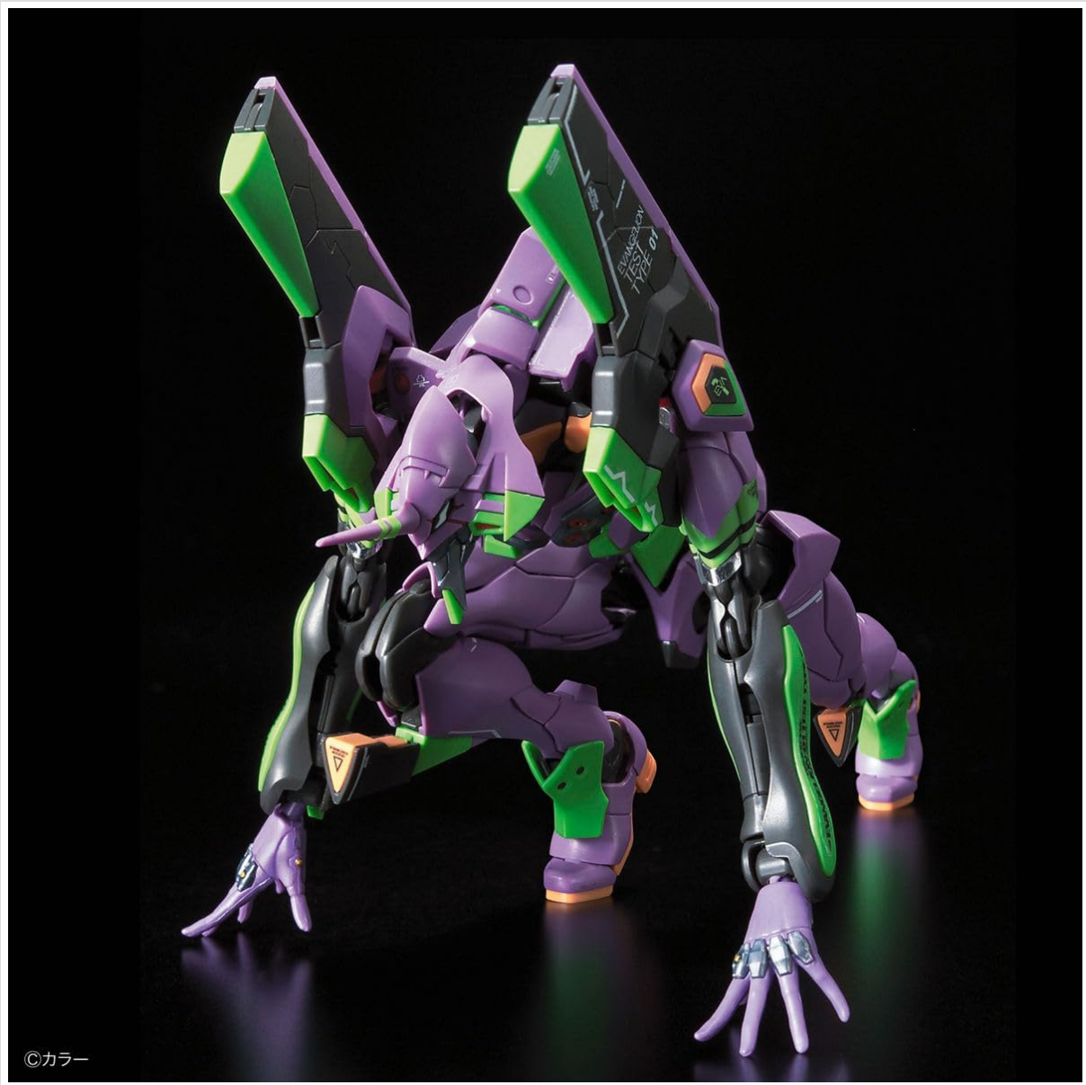
Figure 14: Examples of dynamic posing capabilities.

For stability in certain dynamic poses, consider using a display stand (sold separately) or utilizing the umbilical cable as a support.