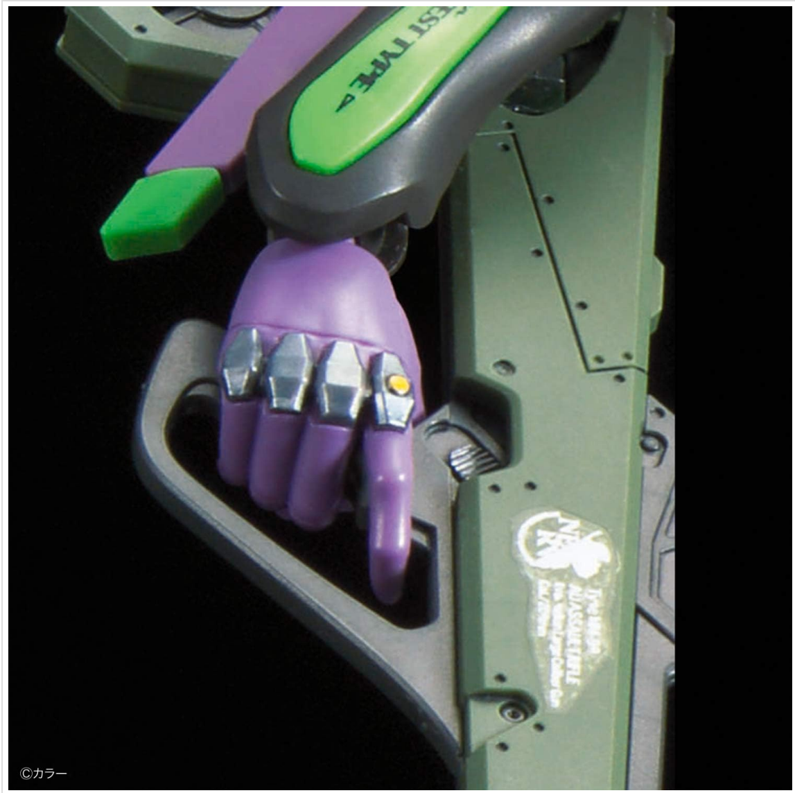
Figure 9: Arm articulation detail.