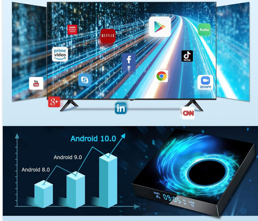
Image 6.1: The Android 10.0 interface displaying various applications.

Run smoothly and download Android applications freely