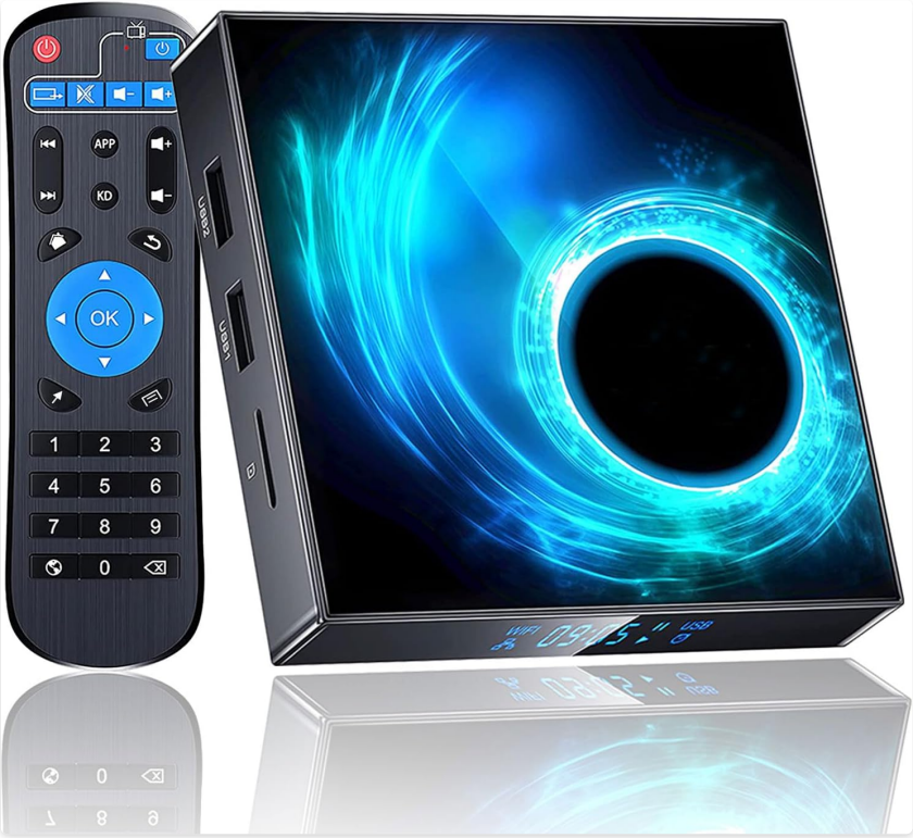
Image 1.1: The EASYTONE Android TV Box 2025 with its included remote control.

This manual provides detailed instructions for the setup, operation, and maintenance of your EASYTONE Android TV Box 2025 (Model: 4+32GB). This device is designed to transform your television into a smart entertainment hub, offering access to various applications, media content, and online services. Please read this manual thoroughly before using the product to ensure proper functionality and safety.