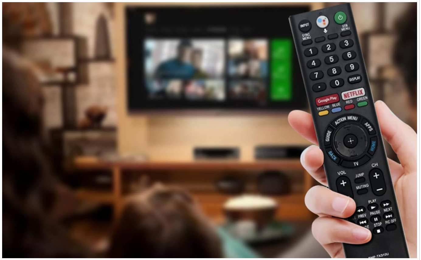
Image: A hand holding the RMF-TX310U remote control, with a Sony Smart TV displaying content in the background, illustrating typical usage.