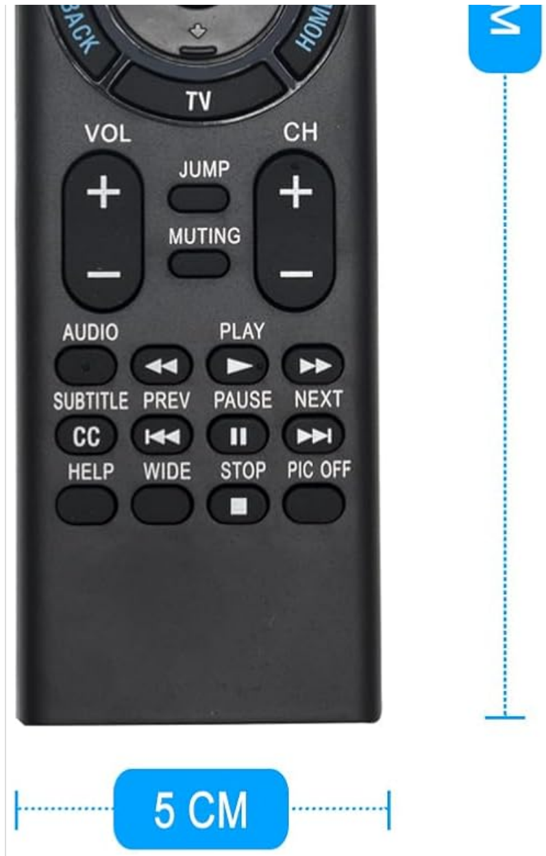
Image: A diagram illustrating the physical dimensions of the remote control, showing its length as 20 cm and width as 5 cm.