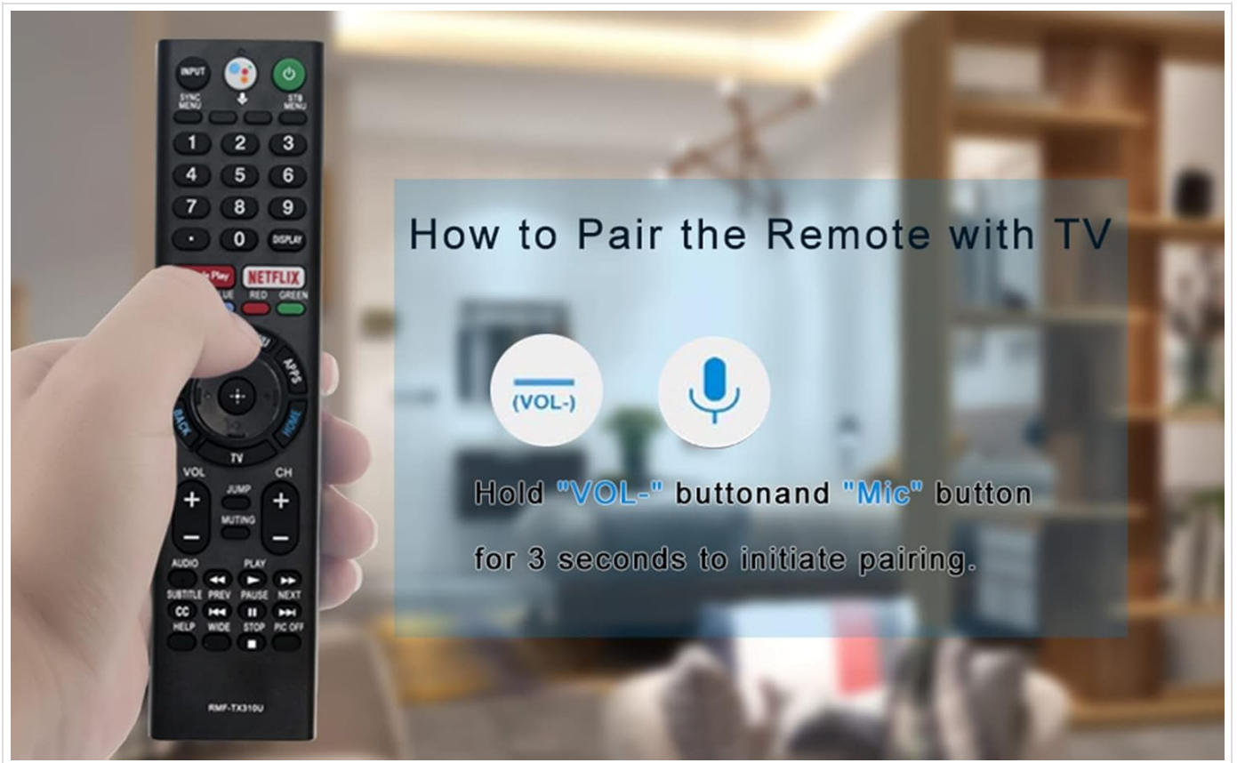
Image: A visual guide demonstrating how to hold the 'VOL-' and 'Mic' buttons on the remote control for 3 seconds to initiate the pairing process with the TV.

Note: If your original remote did not have voice functionality, you may need to enable voice control in your TV's menu settings. Navigate to the TV menu, find the VOICE CONTROL setting, and change its default from "disable" to "active" mode.