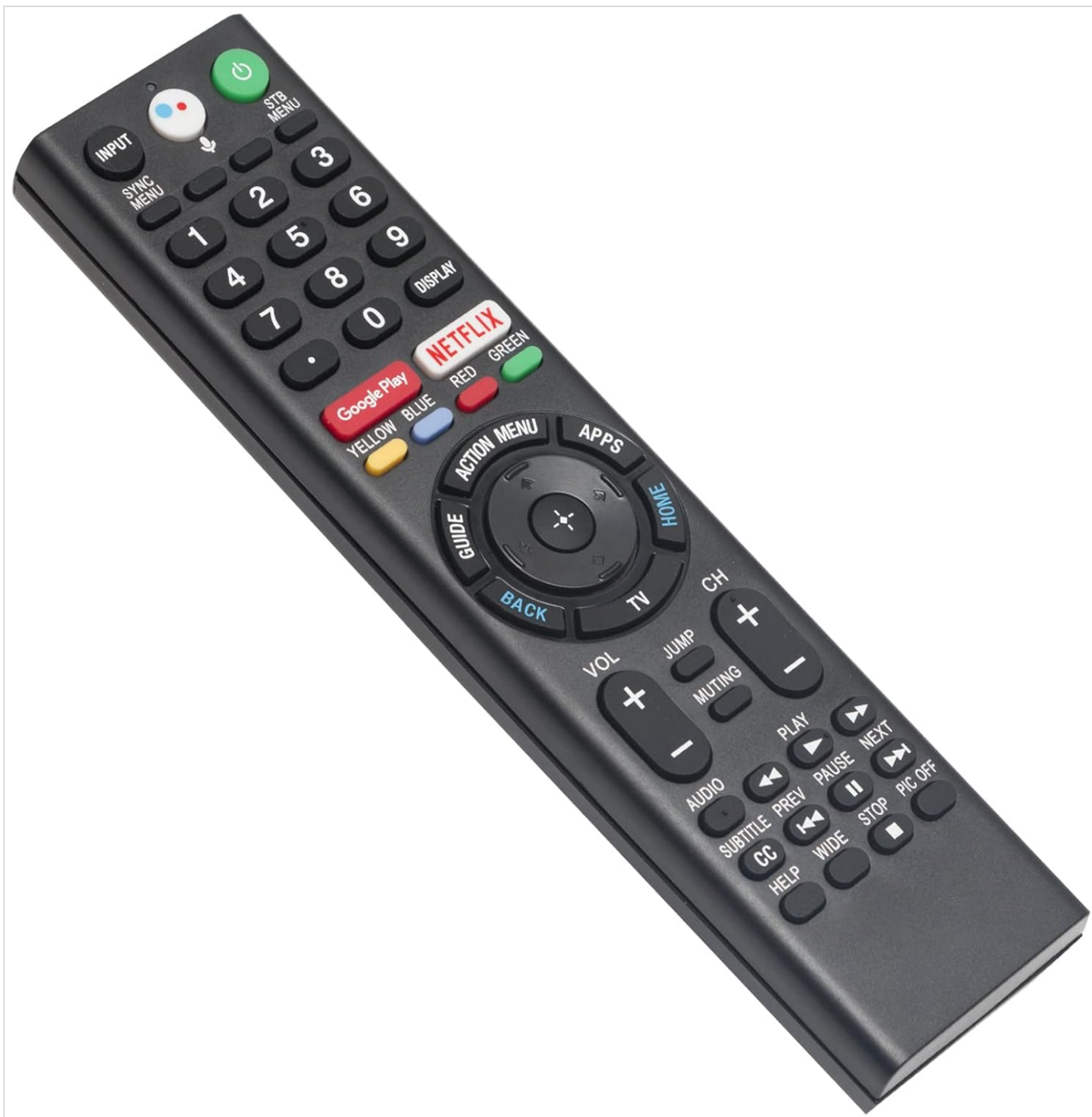
Image: The AIDITIYMI RMF-TX310U replacement voice remote control, showcasing its full button layout.