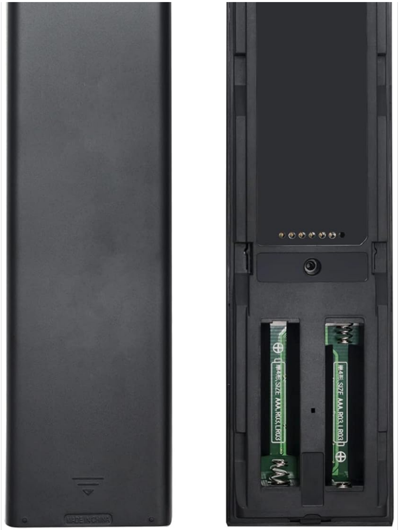
Image: The rear view of the remote control, with the battery cover removed to show the two AAA battery slots.