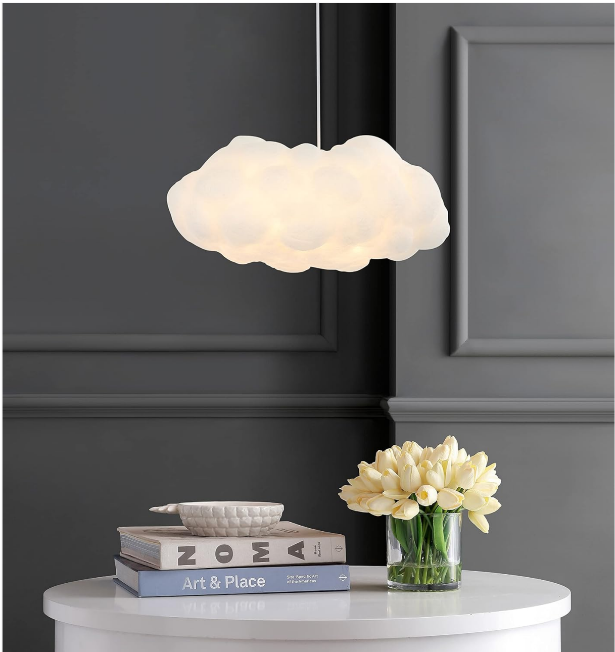
Image 1: The JONATHAN Y JYL9073A Cloud Pendant Light, showcasing its unique illuminated cloud design.