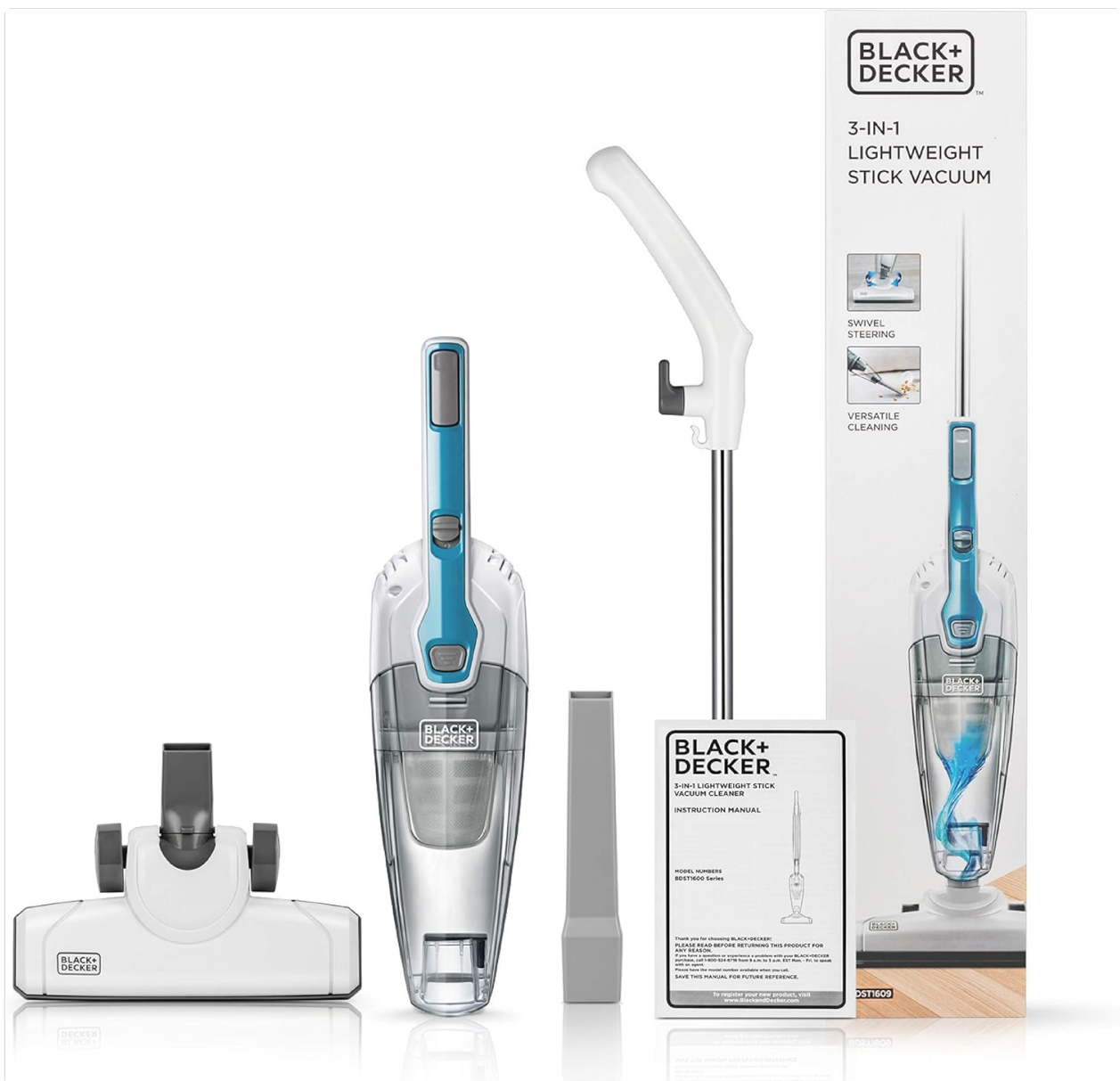
Image 2.1: Overview of the BLACK+DECKER BDST1609 vacuum cleaner and its included accessories, including the main unit, extension handle, floor nozzle, and crevice tool.