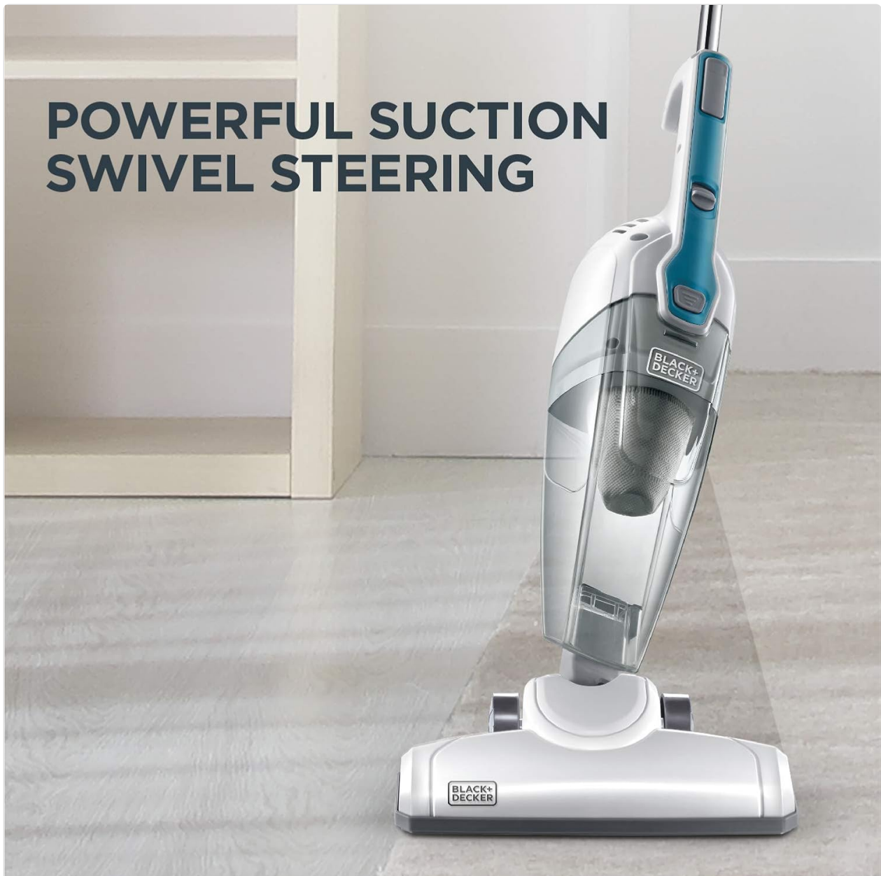
Image 4.1: The BDST1609 in stick vacuum configuration, actively cleaning a floor, highlighting its swivel steering capability.

Ideal for cleaning floors, carpets, and larger areas.