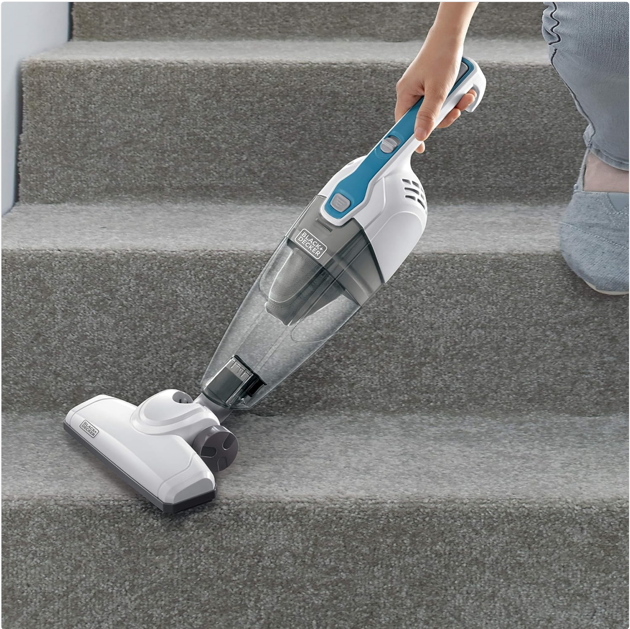
Image 4.3: A user cleaning carpeted stairs using the handheld vacuum unit with the floor nozzle attachment.