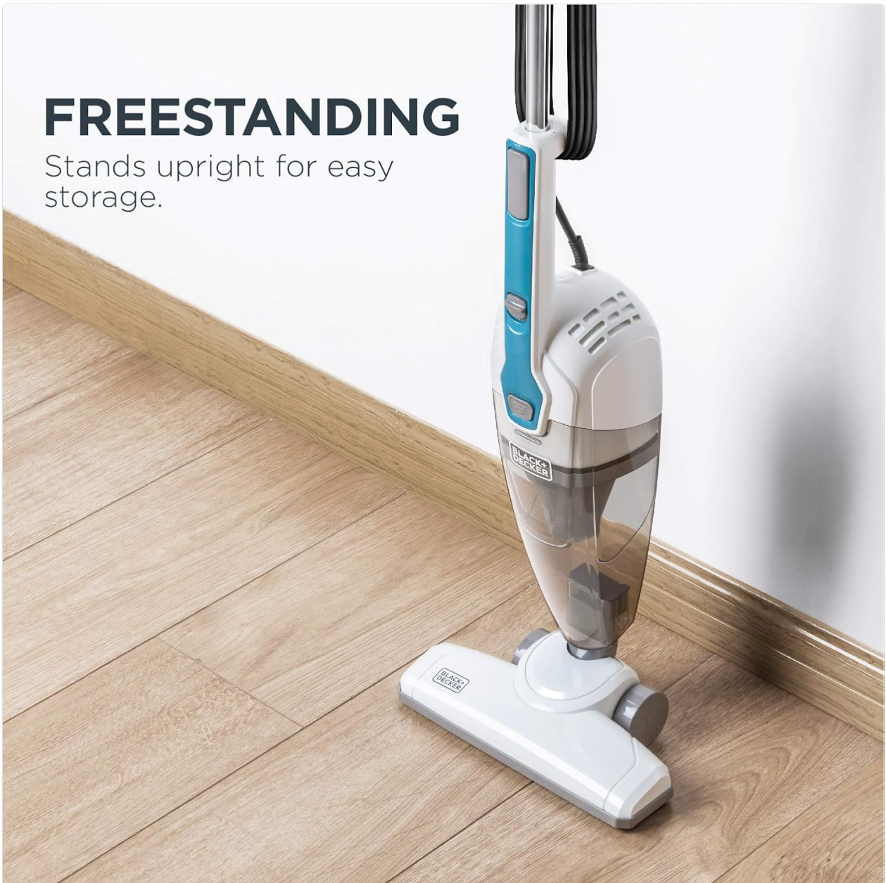
Image 8.1: The BDST1609 stick vacuum standing upright on its own, demonstrating its freestanding design for easy storage.