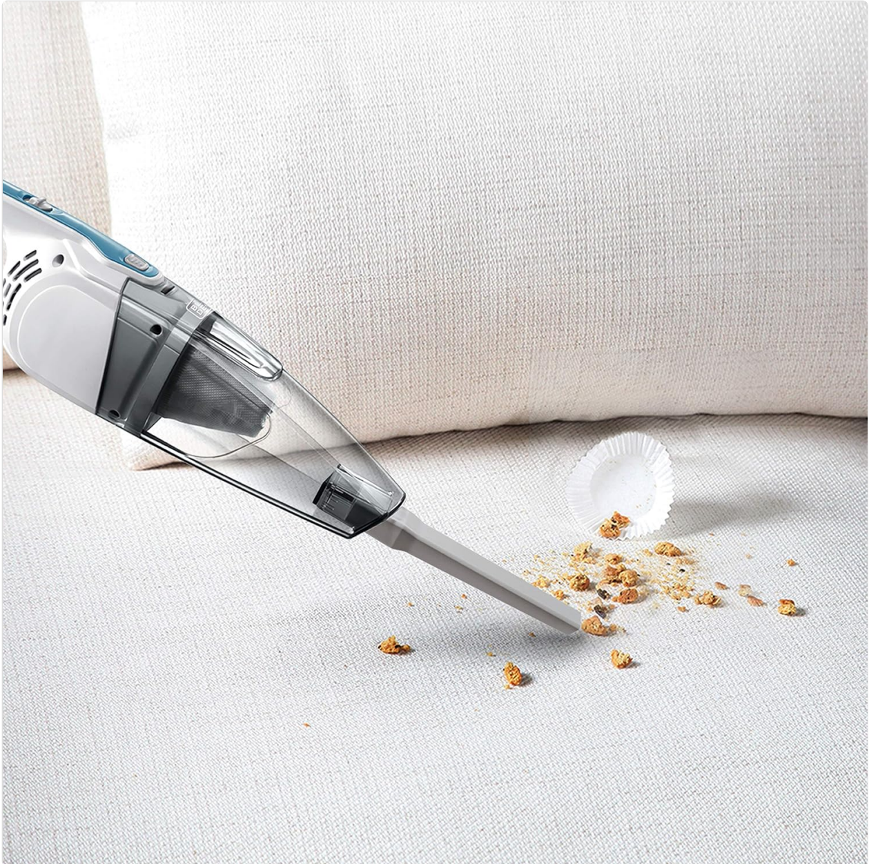
Image 4.2: The handheld vacuum unit with the crevice tool attached, effectively cleaning crumbs from a sofa.

Perfect for stairs, upholstery, car interiors, and hard-to-reach spots.