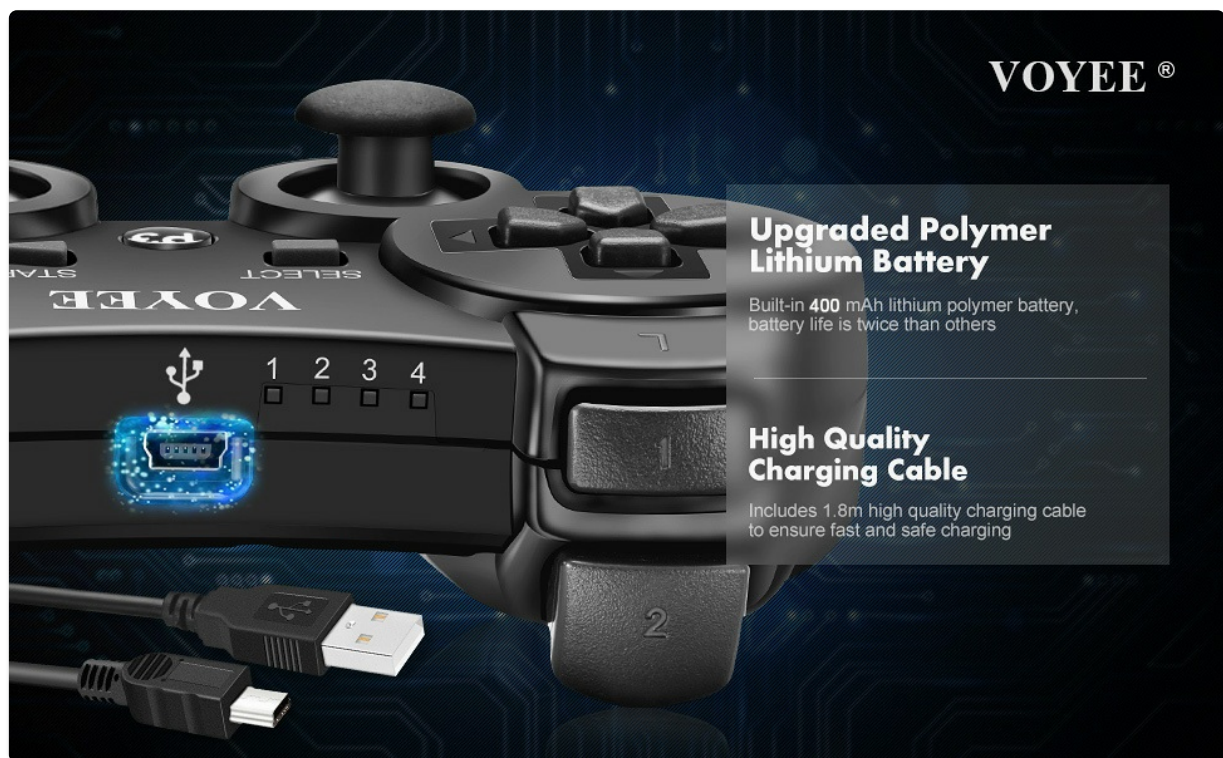
Image 3.1: Illustration of the controller's charging port and the USB charging cable connection.