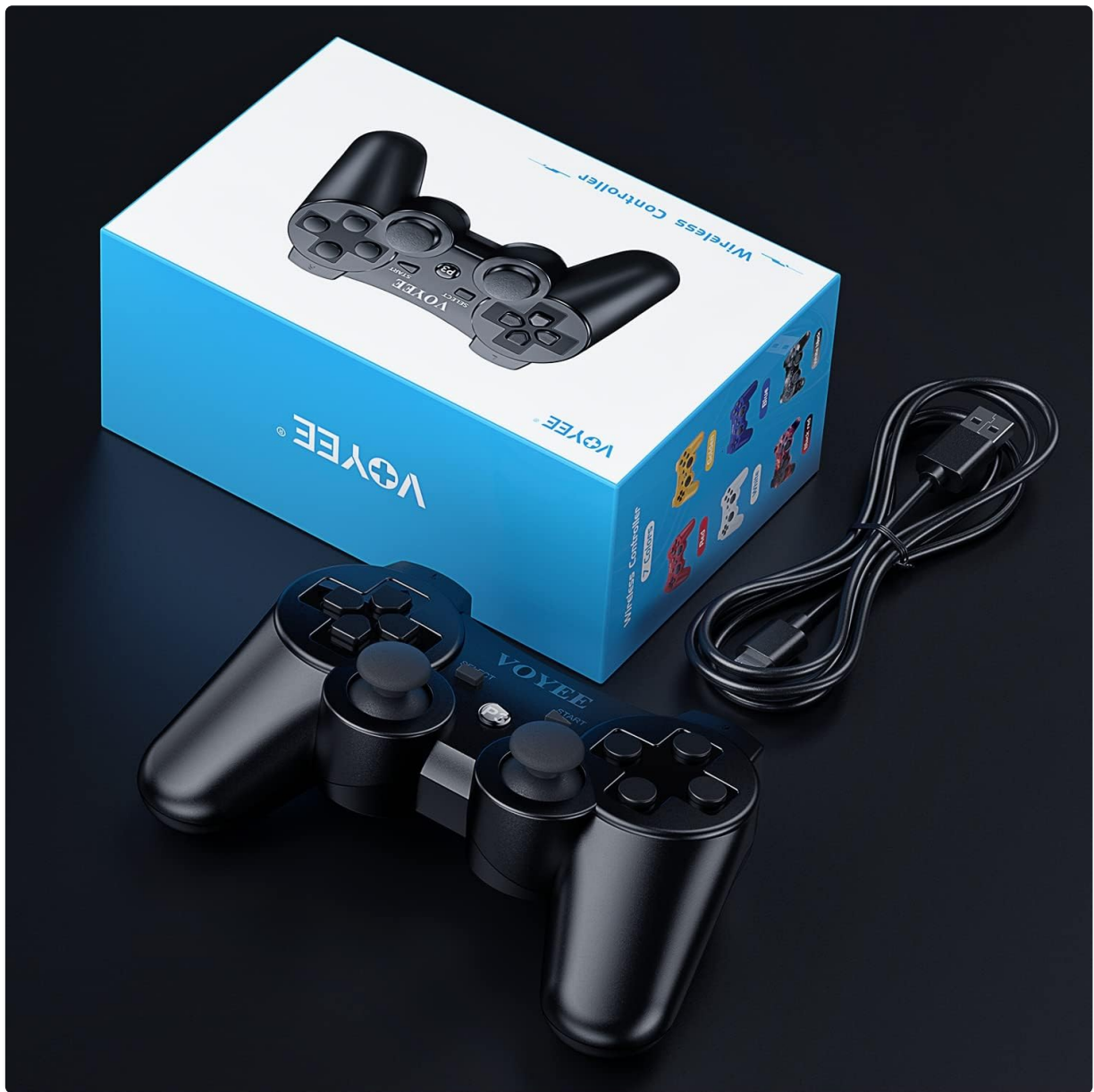
Image 1.1: Package contents including the VOYEE wireless controller, USB charging cable, and user manual.