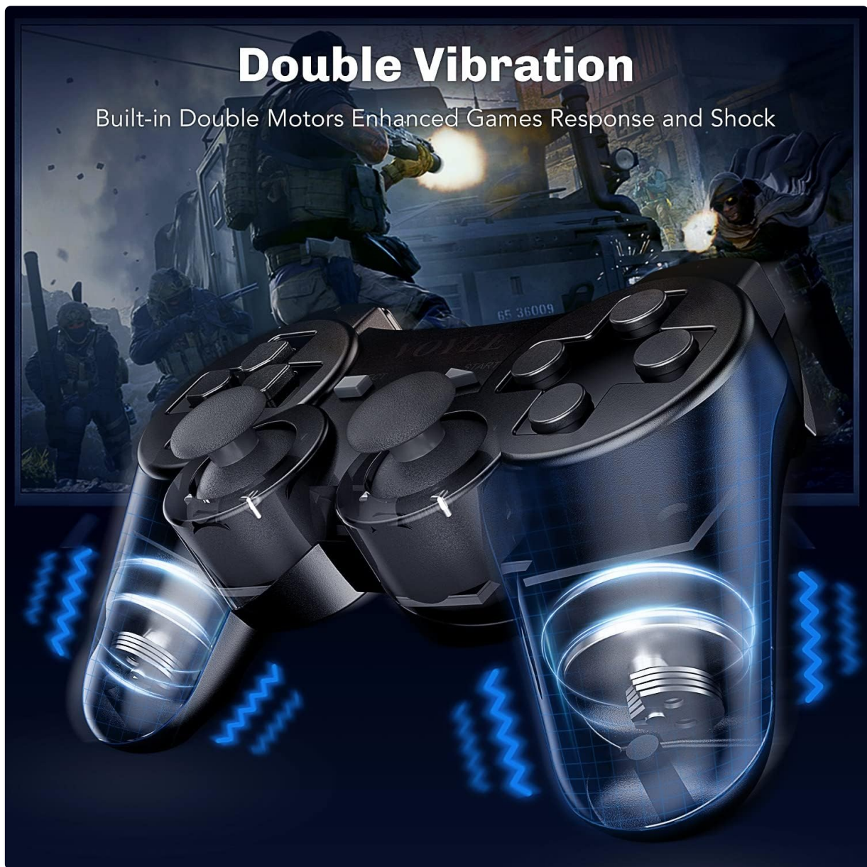
Image 4.2: Visual representation of the dual vibration feature within the VOYEE controller.