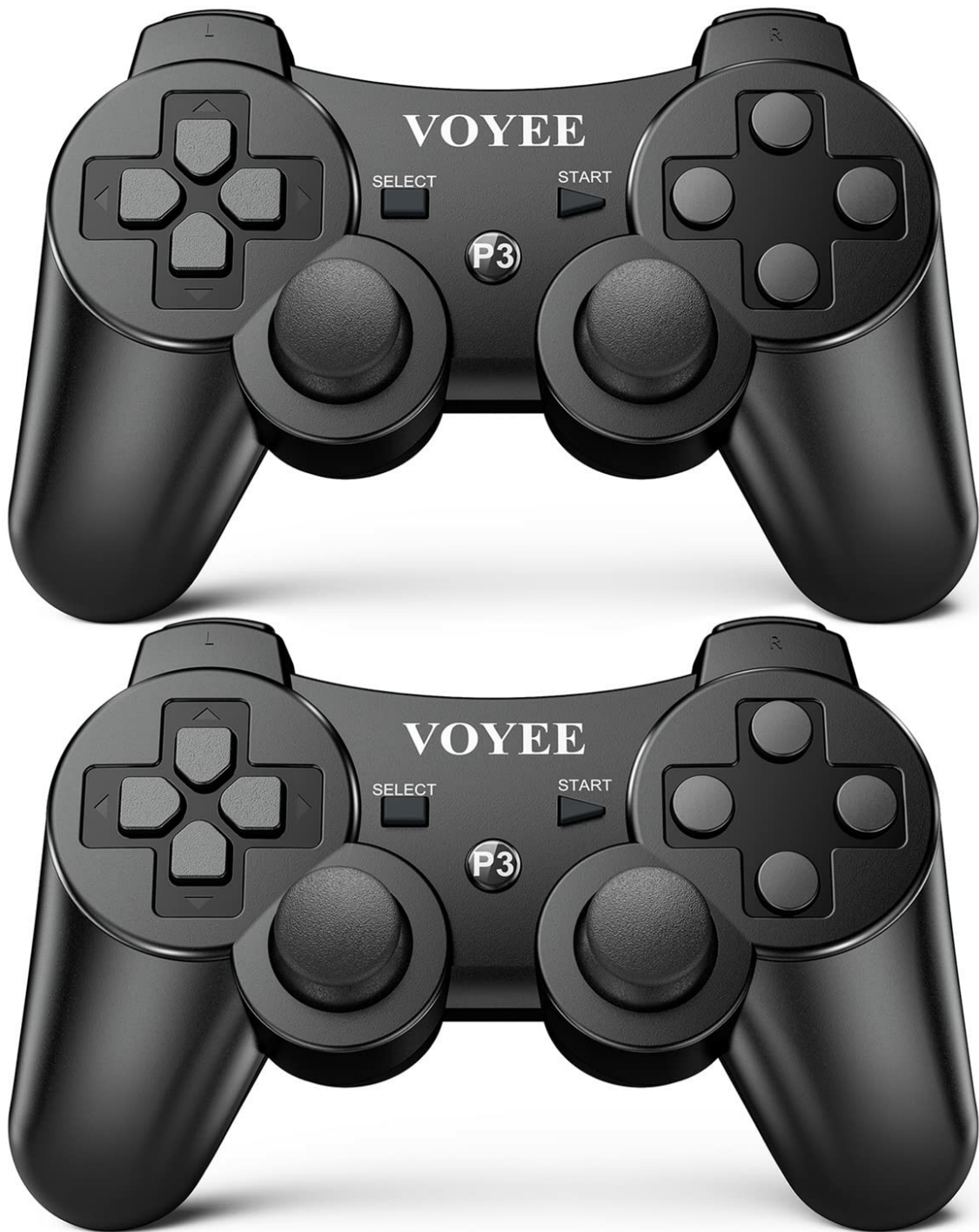
Image 2.1: Front view of the VOYEE Wireless Controller, showcasing its ergonomic design and button layout.