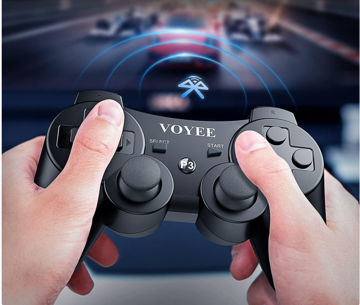
Image 3.2: A user holding the VOYEE controller, illustrating its wireless Bluetooth connectivity.