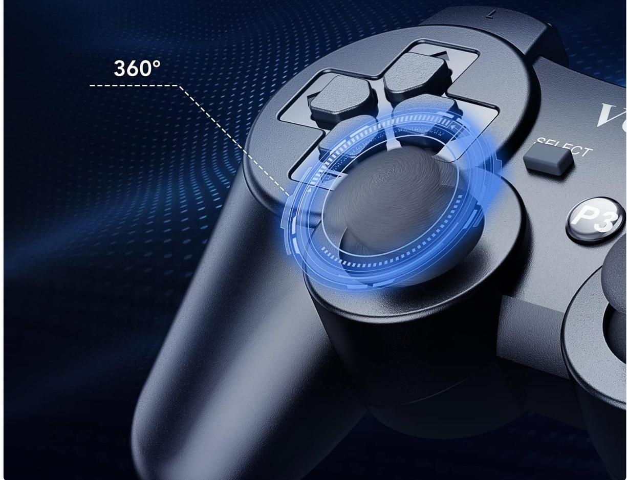
Image 4.1: A close-up view of the controller's upgraded joystick, highlighting its 360-degree precision.

360-degree positioning with ultra-accuracy New technology provides realistic gaming experience