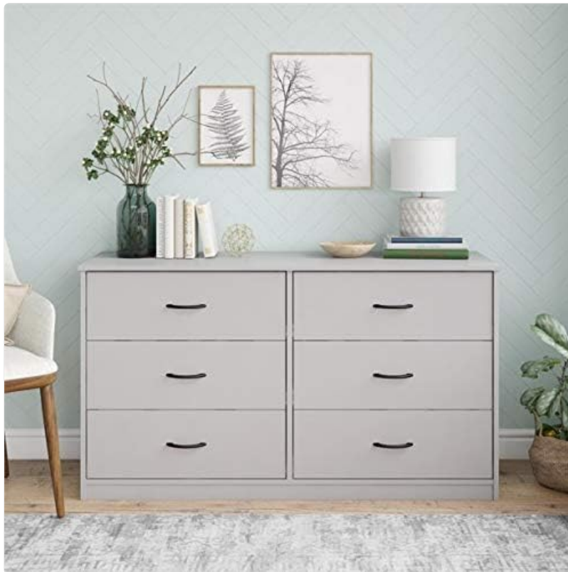
Image: Mainstays 6-Drawer Dresser in Dove Gray, shown in a bedroom setting with decorative items on top.

The Mainstays 6-Drawer Dresser is designed to provide ample storage for your bedroom or guest room. Featuring a durable construction and a stylish finish, this dresser offers a practical solution for organizing clothing and other items. Its spacious drawers and large top surface make it a versatile addition to any living space.