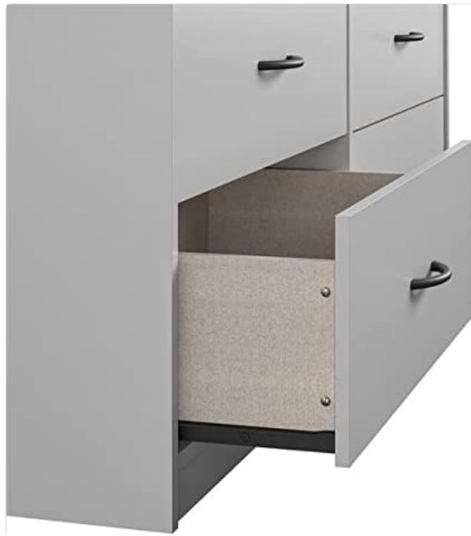
Image: An open drawer of the Mainstays 6-Drawer Dresser, revealing the interior space and linen-look finish.