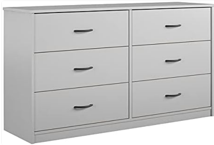
Image: Front view of the Mainstays 6-Drawer Dresser, illustrating its six spacious drawers.